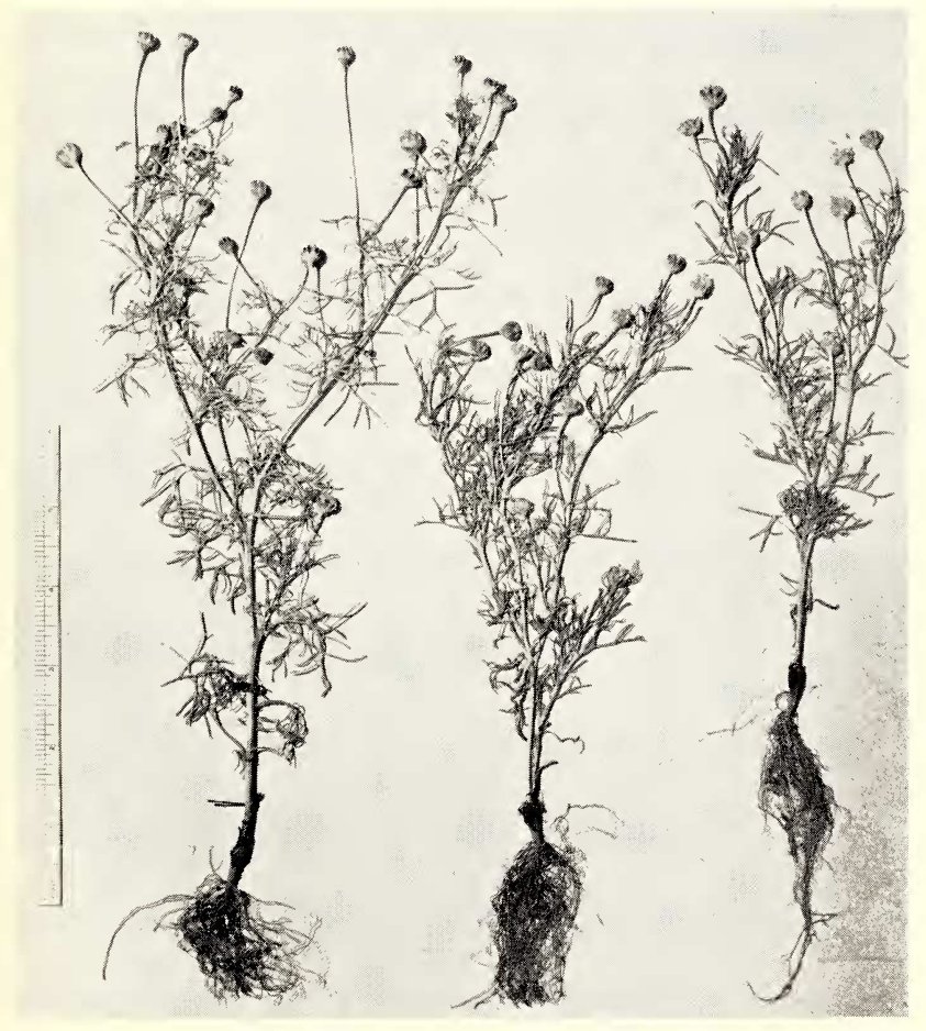
FIG. 1. Specimens of Hymenoxys anthemoides grown from Argentine seed ( Baldwin 15580 ). Six inch scale shown.

Parker (1950) published certain new combinations in Hymenoxys Cass. that she later (1951, in manuscript) used in a monograph of this genus. Earlier, she had asked us to survey the chromosomes of Hymenoxys and had supplied us with thirty-five collections of seeds representative of both subgenera, of fourteen of the twenty-four species recognized by her, and of five varieties.