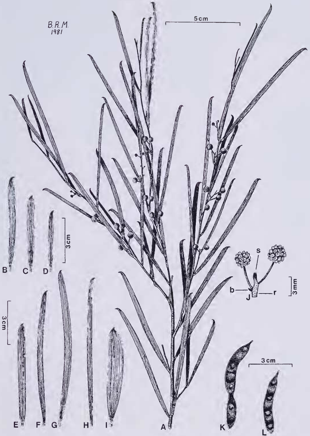
Figure 2. Acacia warramaba . A—Portion of branch. B to I—Phyllodes showing variability (D—an atypically small phyllode; I—an atypically broad phyllode; E to G—samples from separate plants in a single population). J—Inflorescence showing short raceme axis (r) with a dormant vegetative shoot(s) at its apex; note persistent bract (b) at base of one peduncle. K, L—Legumes showing variability. A from B. R. Maslin 4843 (the type); B from A. S. George 8599; C from B. R. Maslin 2465; D from A. S. George s.n., 6 Feb. 1963; E from B. R. Maslin 4836B; F from B. R. Maslin 4836; G from B. R. Maslin 4836A; H and J from M. J. D. White s.n., 24 Feb. 1979; I from K. Newbey 6299; K from A. E. Orchard 4178; L from M. J. D. White s.n., 7 Feb. 1979.