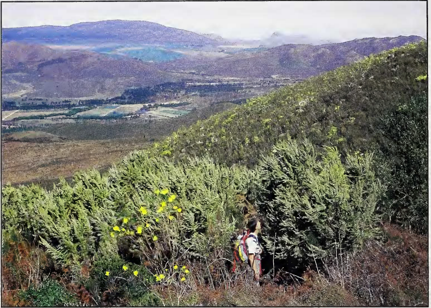
Fig. 1. Population of Erica oakesiorum above Greyton with Inge Oliver to show scale.

The plants were mostly 2–4m tall with the largest in the centre of the kloof being 4m tall. As such the species must be counted among the tallest of southern African heathers as only three other species are reported to reach this height in the wild, E. caffra L., E. canaliculata Andr. and E. dracomontana E. G. H. Oliv. The size of the plants of the new species is all the more surprising because the whole area was devastated by a fire only nine years ago. This was confirmed by the branching pattern indicating a remarkable yearly growth of 30–40cm.