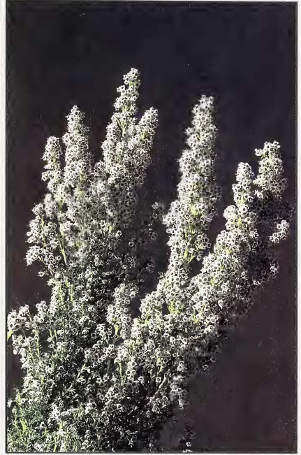
Fig. 4. (right)

Erica oakesiorum . A, flowering branch, natural size; B, branch; C, leaf; D, flower; E, sepal; F, stamen, back, front and side views; G, ovary, whole on left & opened laterally on right; H, capsule with one valve removed; I, subalveolate seed; J, testa cells; all drawn from the type collection. © Inga Oliver.