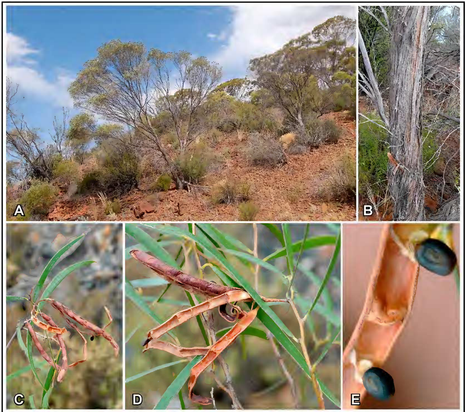
Figure 4. Acacia collegialis . A – habit and habitat; B – stem showing longitudinally fissured, fibrous bark; C – fruiting branchlet showing characteristically recurved phyllodes; D – pods red-brown with non-flanged margins; E – seeds showing heart-shaped differentiated tissue surrounding areole.

Characteristic features. Spreading shrub or tree . Phyllodes narrowly elliptic, mostly 5–8.5 cm long, 4–7 mm wide, l:w = 8-21 , falcately recurved, wide-spreading, acute to acuminate, glabrous, finely multi-striate; marginal nerve brown to red-brown, overlain by a ±thin to thick layer of light grey, opaque resin, sometimes yellow and not resinous on oldest phyllodes. Inflorescences simple or rudimentary racemes to c. 1 mm long; peduncles (1–)2–6 mm long. Spikes obloid to short-cylindrical, 5–9(–12) mm long. Sepals free or united at base. Pods linear to narrowly oblong, 4–6 mm wide, ±thinly coriaceous-crustaceous, ±straight-edged, dark brown to dark red-brown (due to dense layer of glandular trichomes within a resin matrix), marginal nerve not or scarcely raised above face of valve. Seeds longitudinal in pods, with heart-shaped differentiated tissue at centre.