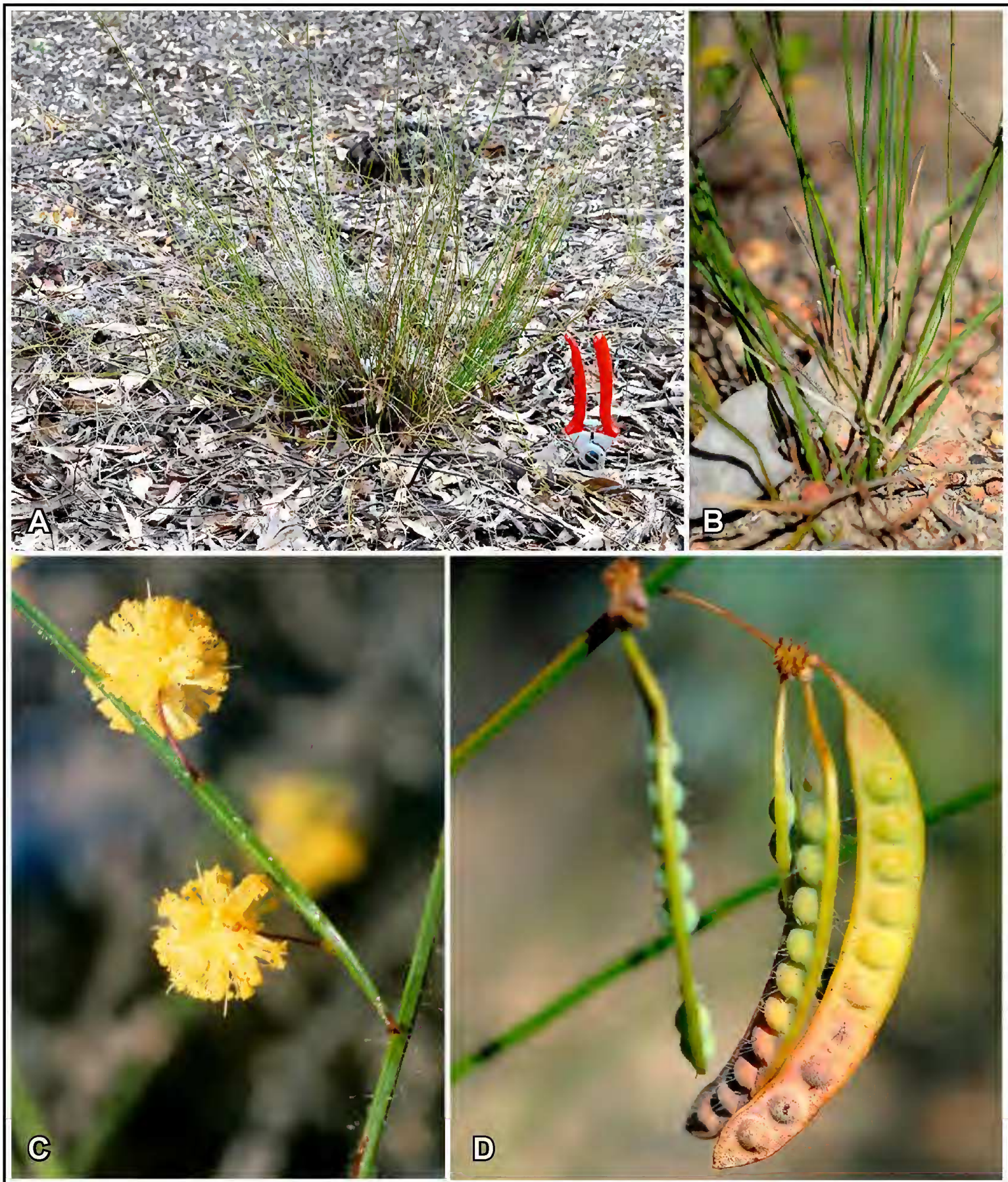
Figure 3. Acacia thieleana . A – grass-like habit; B – multiple stems at ground level; C – flower heads; D – pods.

Characteristic features. Grass-like, caespitose, multi-stemmed sub-shrub , erect or \pm prostrate. Stems gracile, little-divided, green, mostly terete to sub-terete or quadrangular, infrequently a few flattened and with a vestigial wing 0.3–0.5(–1) mm wide. Phyllodes continuous with stems, normally extremely reduced, erect, \pm terete, brown appendages 0.5–1.5 mm long, sometimes phyllodes clearly-developed