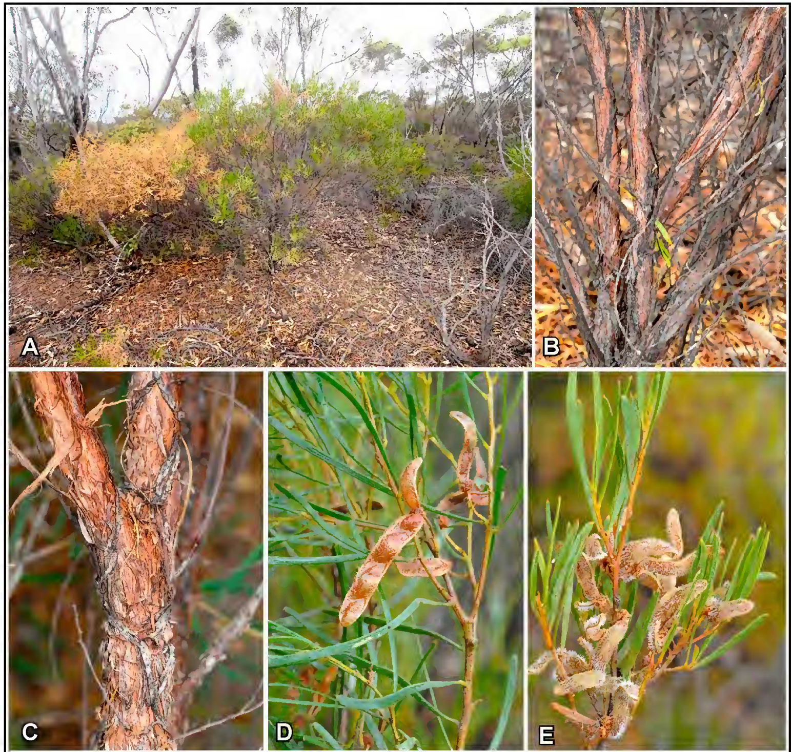
Figure 5. Acacia besleyi . A – habit (adolescent plant) and habitat; B – stem base showing multiple stems and stringy bark; C – outer grey bark exfoliating to reveal light brown new bark; D – branch showing long, narrow phyllodes and sparsely hairy pods; E – branch showing short phyllodes and densely hairy pods.

Characteristic features. Resinous shrub . Bark stringy and fibrous, grey externally, the underlying new bark light brown to reddish brown. Branchlets smooth or tuberculate, glabrous or with \pm sparse, short, antrorsely appressed hairs. Phyllodes linear but gradually and discernibly narrowed towards their base, 40–85 mm long, 2–3(–3.5) mm wide, mostly shallowly incurved, erect, glabrous; longitudinal nerves 3–5, not or scarcely raised, widely spaced with the central one normally yellow and more evident than the often impressed, brownish flanking nerves; lateral nerves absent or few, longitudinally trending with sometimes a few anastomosing; apices normally \pm abruptly contracted to a distinct, acute point. Inflorescences short racemes (1–)2–4(–6) mm long, with 2, opposite peduncles at distal end of raceme axis; peduncles 5–8 mm long, normally glabrous; heads globular, 15–22-flowered. Bracteoles 0.8–1 mm long, claws linear, abruptly expanded into ovate, concave, curved, acute to short-acuminate laminae 0.5 \times 0.4 mm. Flowers 5-merous; sepals narrowly oblong to linear, free or united near their base, \pm glabrous; petals \pm glabrous. Pods narrowly oblong, 10–30 mm long, 3.5–5 mm wide, thinly coriaceous-crustaceous, straight to variously curved or sigmoid, often \pm undulate, sparsely to densely