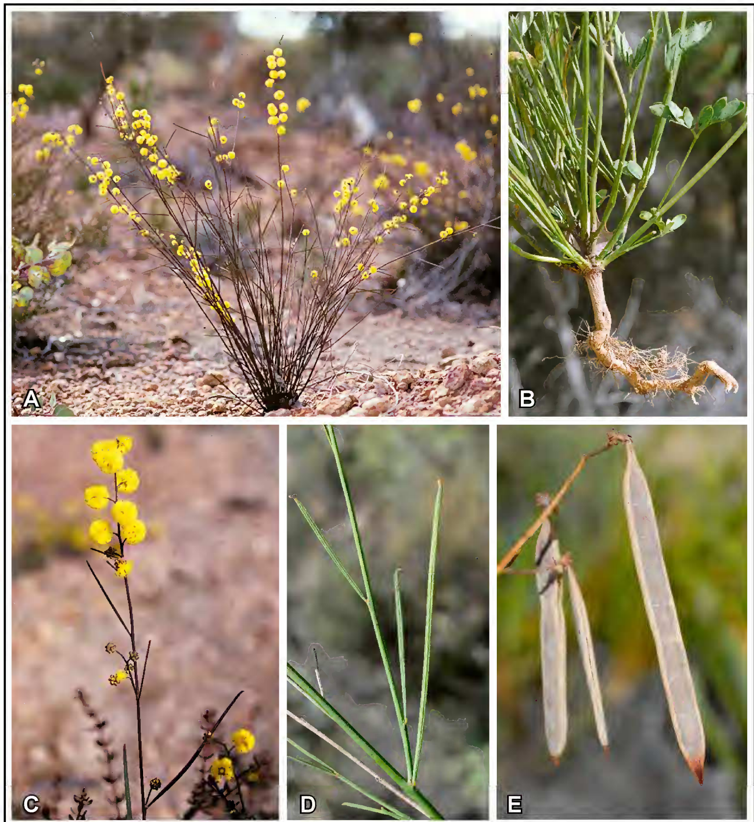
Figure 1. Acacia adjutrices . A – habit; B – stem base showing multi-stemmed base and strong main root; C – flowering branch showing inflorescences simple (lowermost node) or arranged in axillary racemes or false terminal racemes; D – branchlets with linear phyllodes; E – pods.

Phenology . Flowers in July and August; pods with mature seed have been collected from late November to mid-December.