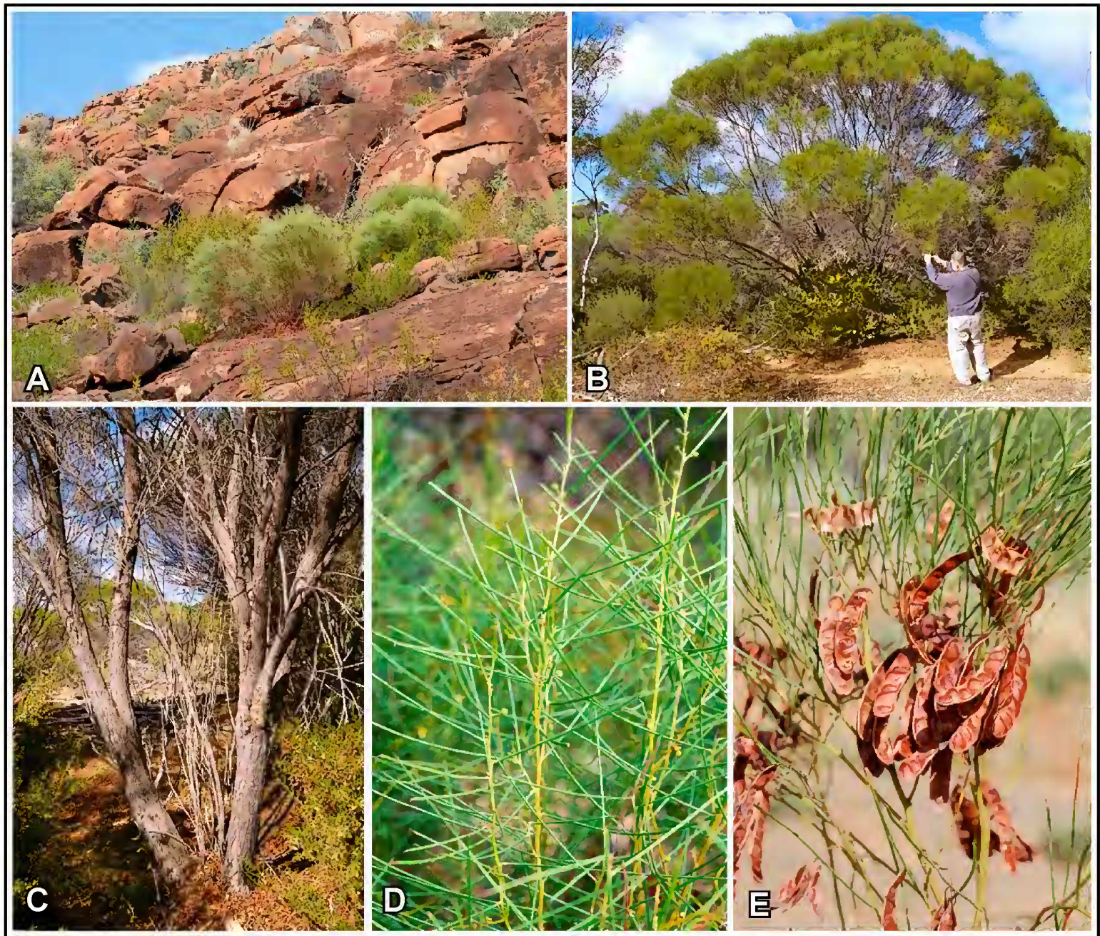
Figure 6. Acacia fraternalis . A – habitat (Jimberlana Hill); B – habit (with David Seigler, U.S.A.); C – stem base; D – phyllodes; E – pods.

collection apparently represents a disjunct occurrence of the species. Herbarium labels suggest that A. fraternalis is at least sometimes common in the places where it occurs.