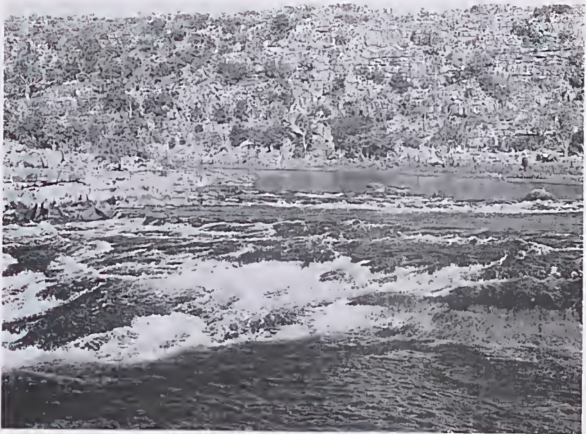
Figure 3. Mouth of the Calder River at eastern end of Walcott Inlet, surrounded by sandstone cliffs.