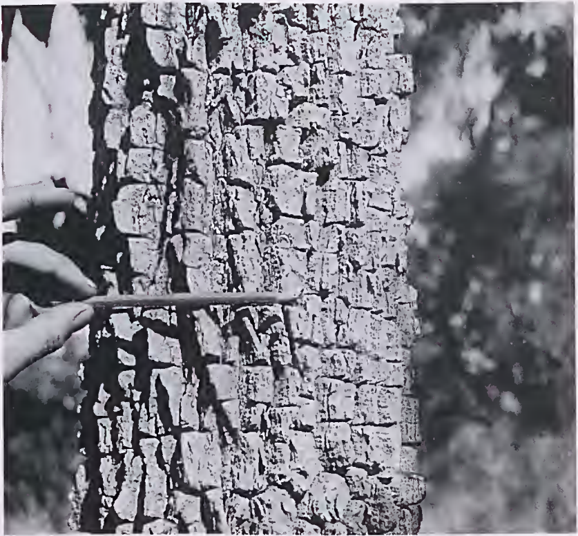
Figure 13. Fissured, corky bark of Pouteria arnhemica .