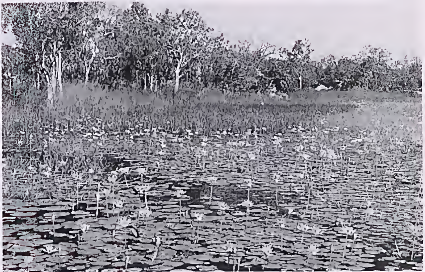
Figure 14. Billabong below sandstone escarpment dominated by blue waterlilies ( Nymphaea violacea ) and chinese water chestnut ( Eleocharis dulcis ). Both plants have edible tubers.