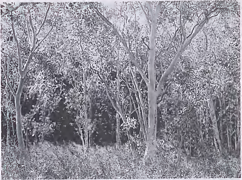
Figure 7. Edge of gallery forest fringing Calder River, dominated by Eucalyptus houseana .

americanus , Ilex arnhemensis , Miliusa brahei , Mimusops elengi , Polyalthia australis , Polyaulax cylindrocarpa , Pouteria sericea and Wrightia pubescens . The vines include Abrus precatorius , Adenia heterophylla , Ampelocissus acetosa , Canavalia papuana , Capparis sepiaria , Flagellaria indica , Ichmocarpus frutescens , Pachygone ovata , Parsonsia velutina , Pisonia aculeata and Secamone timoriensis . The epiphytic orchid Dendrobium affine occasionally occurs.