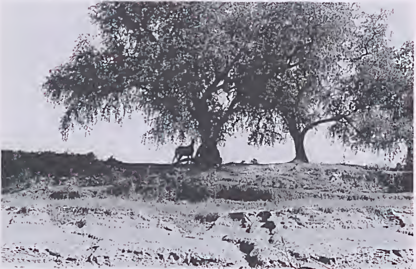
Figure 6. Alluvial banks support groves of bauhinia ( Lysiphyllum cunninghamii ).

forests. Rainforest species include the trees Aidia racemosa , Aglaia elaeagnoidea , Albizia lebbeck , Alstonia linearis , Alphitonia excelsa , Bombax ceiba , Canarium australianum , Celtis philippensis , Cryptocarya cunninghamii , Ficus virens , F. racemosa , Ganophyllum falcatum , Grewia breviflora , Gyrocarpus