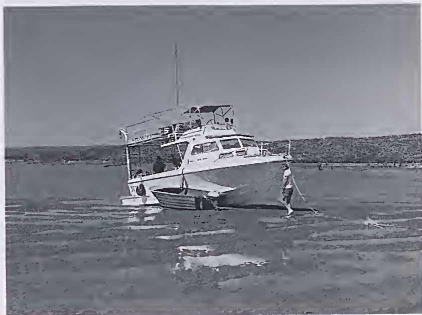
Figure 2. Boat stranded during the emptying of Walcott Inlet at extremely low tide.