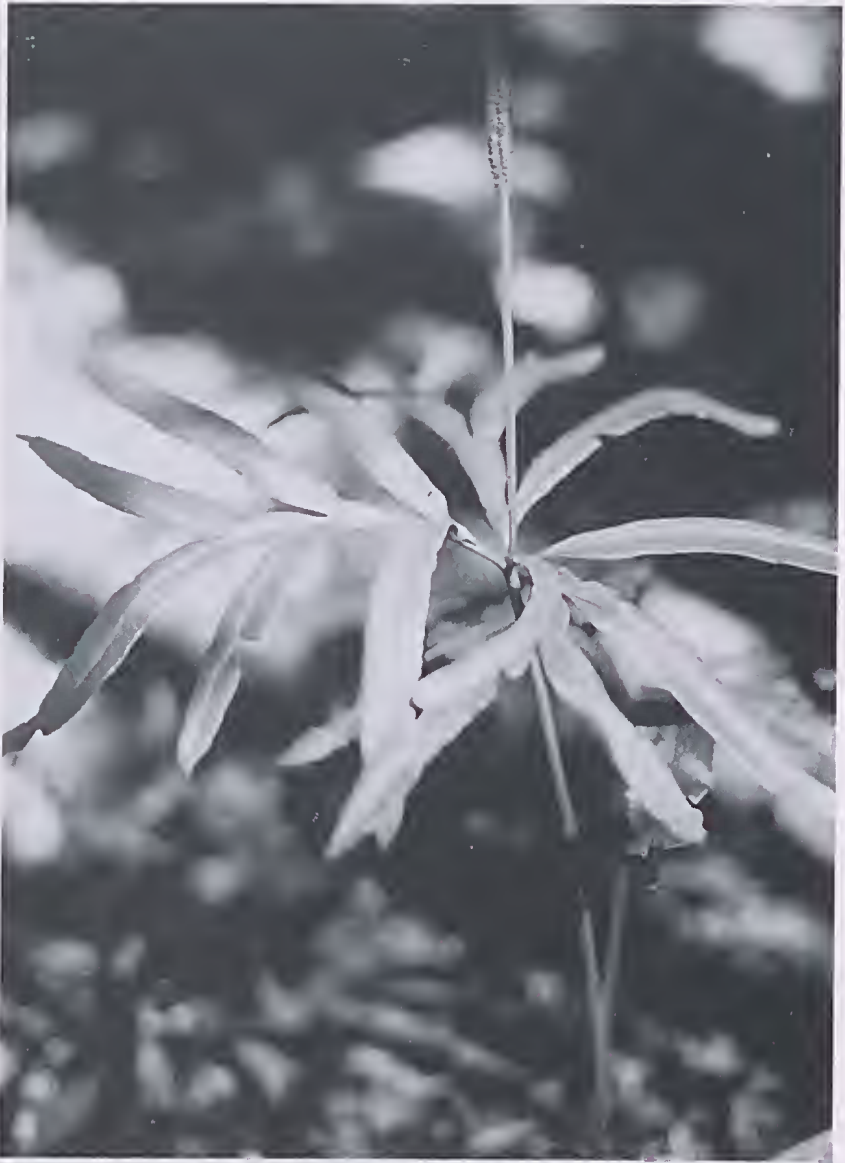
Figure 10. Helminthostachys zeylanica , a rarely collected fern in the gallery forest.

Feral stock are present in limited numbers and the vegetation is in reasonably good condition. Fire ecology in the study area requires further investigation. The absence of permanent settlement reduces a significant source of ignition although some temporary camping takes place at Munja during stock mustering from nearby Pantijan Station.