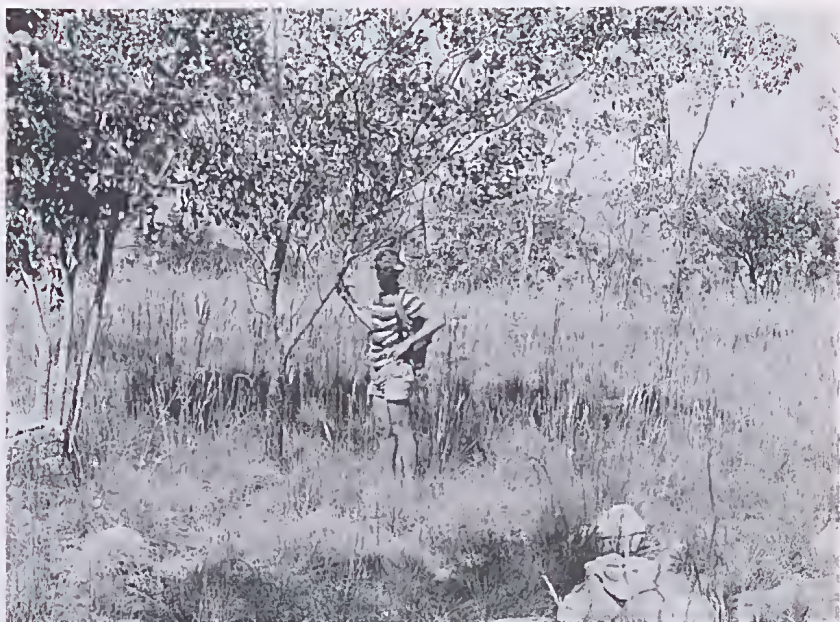
Figure 11. Hummock grassland in sandstone dominated by Grevillea refracta and Terminalia hadleyana .

(Pontederiaceae), Merremia gemella (Convolvulaceae), Kalanchoe crenata (Crassulaceae), Decaisnina biangulata (Loranthaceae), Acacia froggattii (Mimosaceae), Syzygium nervosum (Myrtaceae) all of which appear restricted to the study area (Kenneally, 1983; Wheeler et al. 1992).