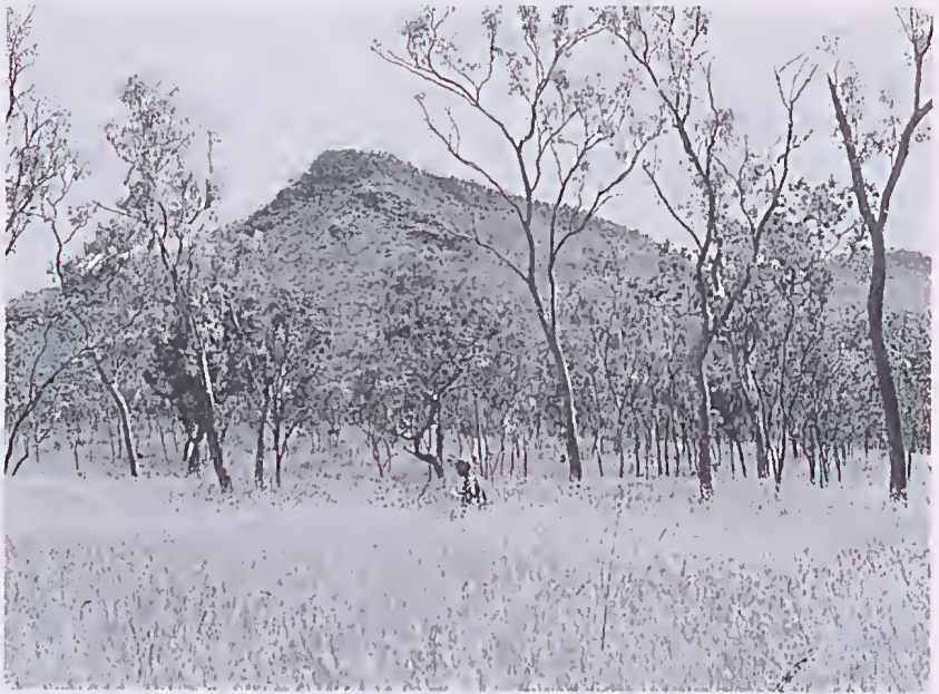
Figure 5. Savanna woodland dominates the alluvial plains with Mount Daglish in the background.