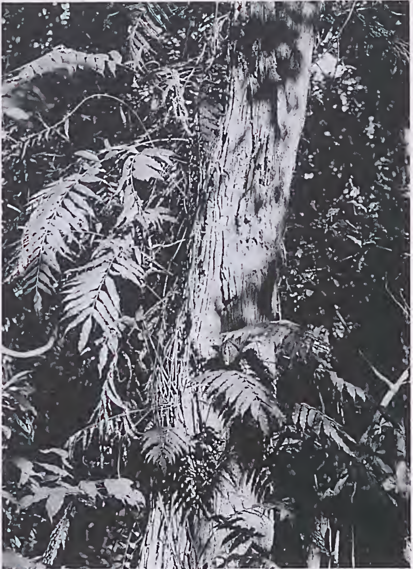
Figure 9. Climbing Swamp Fern ( Stenochlaena palustris ), on trunk of Syzygium angophoroides .