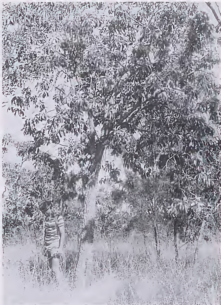
Figure 12. Pouteria arnhemica on sandstone.

The advice and companionship of the late Wattie Ngerdu in helping to understand the traditional Aboriginal significance of the area will always be deeply appreciated.