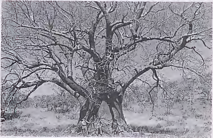
Figure 4. A giant baobab ( Adansonia gregorii ) on alluvial plain near old Munja mission.

hirsuta , M. mutica , Mitrasacme hispida and Vernonia cinerea .