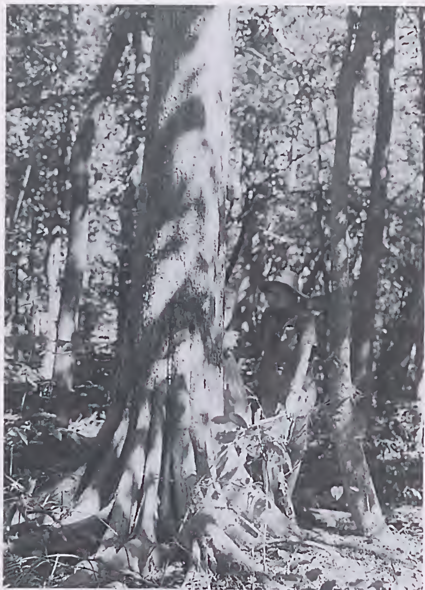
Figure 8. Buttressed roots of Syzygium nervosum in gallery forest.