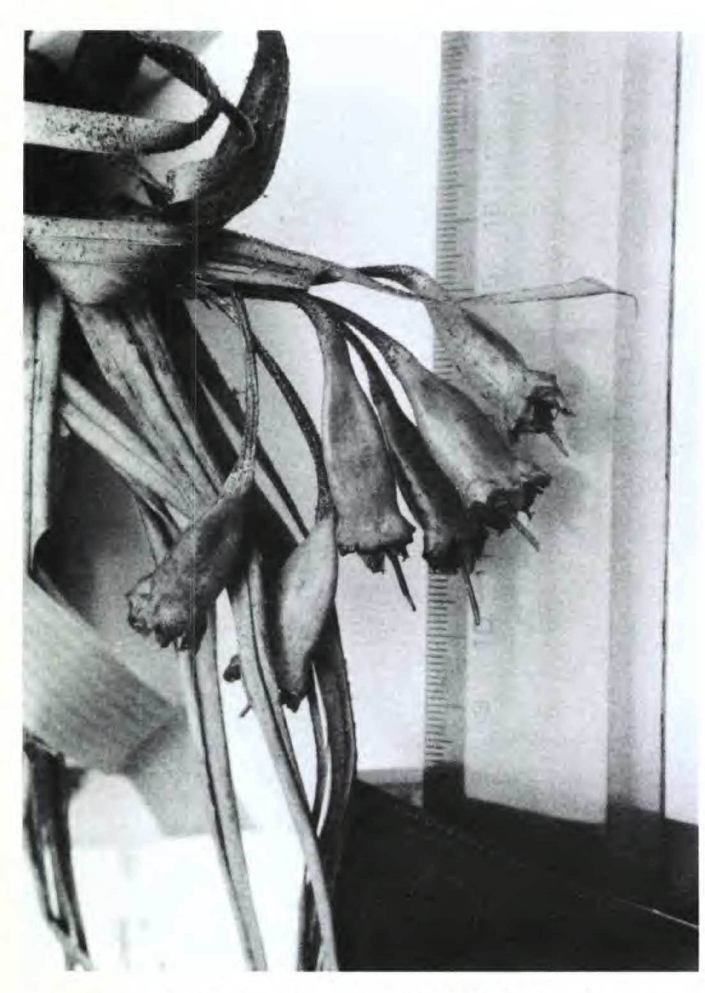
Figure 3. Vellozia kolbekii R. J. V. Alves. Holotype, detail of scapes and capsules.

brachypoda mainly by a longer caudex, longer tepals, a more angular ovary with the apex broadened into a crown (Fig. 3), leaves with more linear setae on margins, and deeper furrows on the abaxial surface. It further differs from V. variabilis Martius ex Schultes f. by a glabrous ovary, from V. tomeana Lyman B. Smith & Ayensu by partly connivent staminal filaments, a glabrous ovary and glabrous leaves. The fact that V. kolbekii has a glabrous ovary and that part of its scape is slightly vestite may indicate a possible relationship with V. subscabra Mikan (V. scabra Sprengel), listed under "Ex-