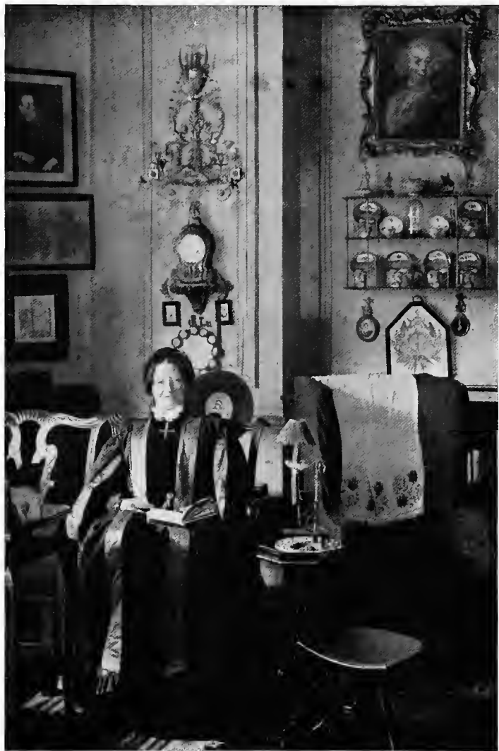
LADY DOROTHY NEVILL AT HOME