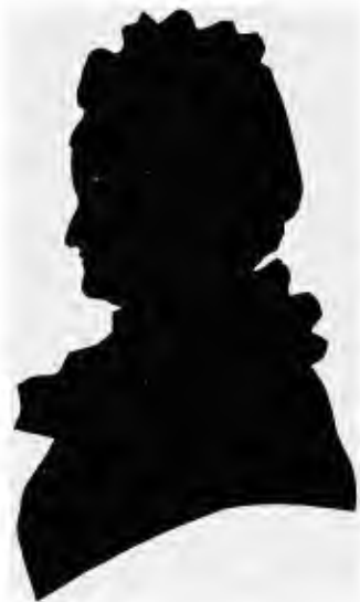
LADY DOROTHY NEVILL IN OLD AGE FROM A SILHOUETTE EXECUTED ABOUT 1907