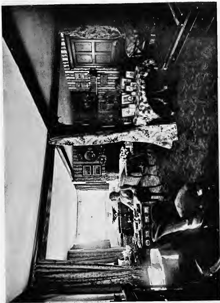
LADY DOROTHY NEVILL IN HER COTTAGE AT HASLEMERE