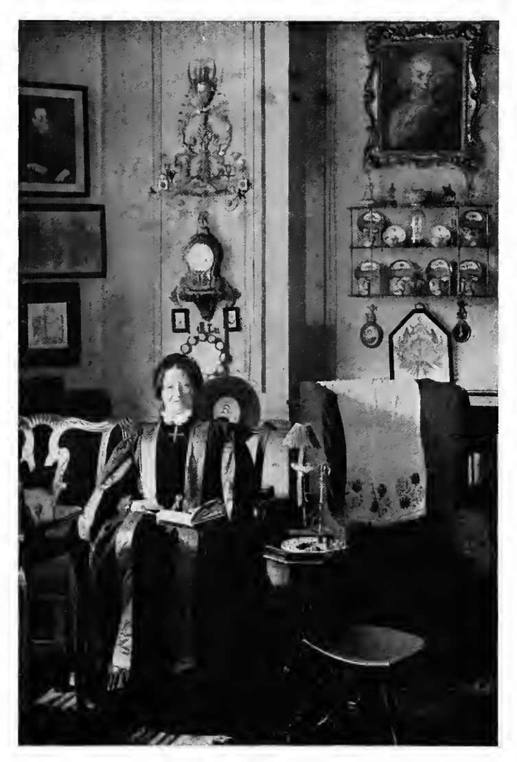
LADY DOROTHY NEVILL AT HOME