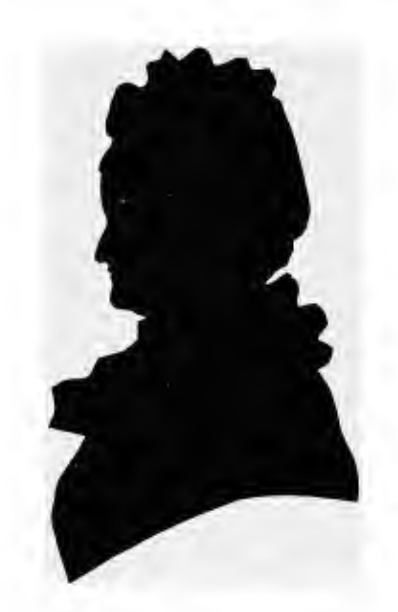
LADY DOROTHY NEVILL IN OLD AGE FROM A SILHOUETTE EXECUTED ABOUT 1907