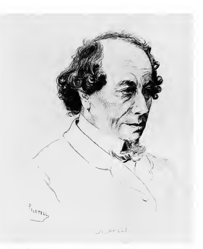
Published by Mittersia 109 ST-AM