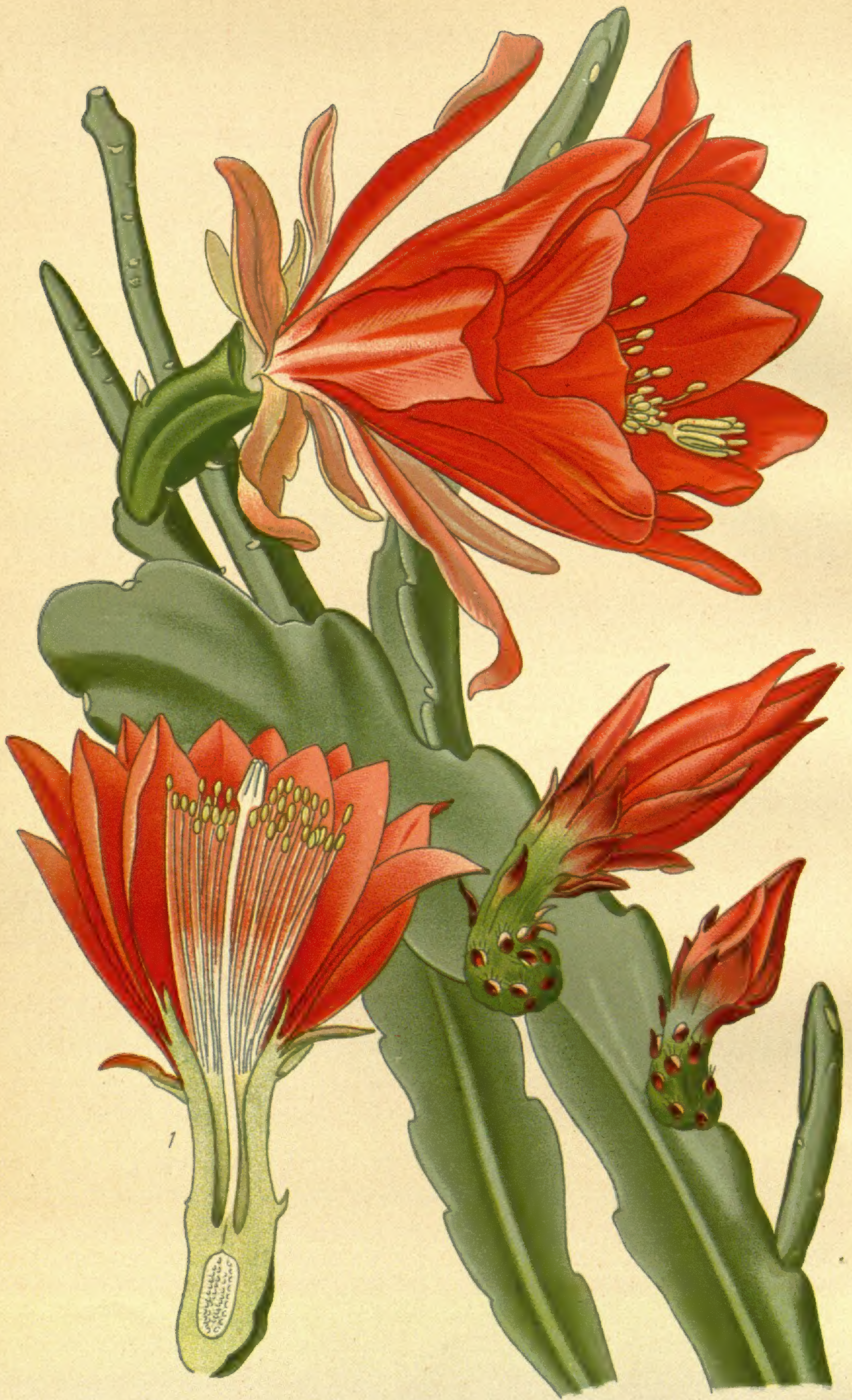
LEAF-STEMMED CACTUS (PHYLLOCACTUS PHYLLANTHOIDES)