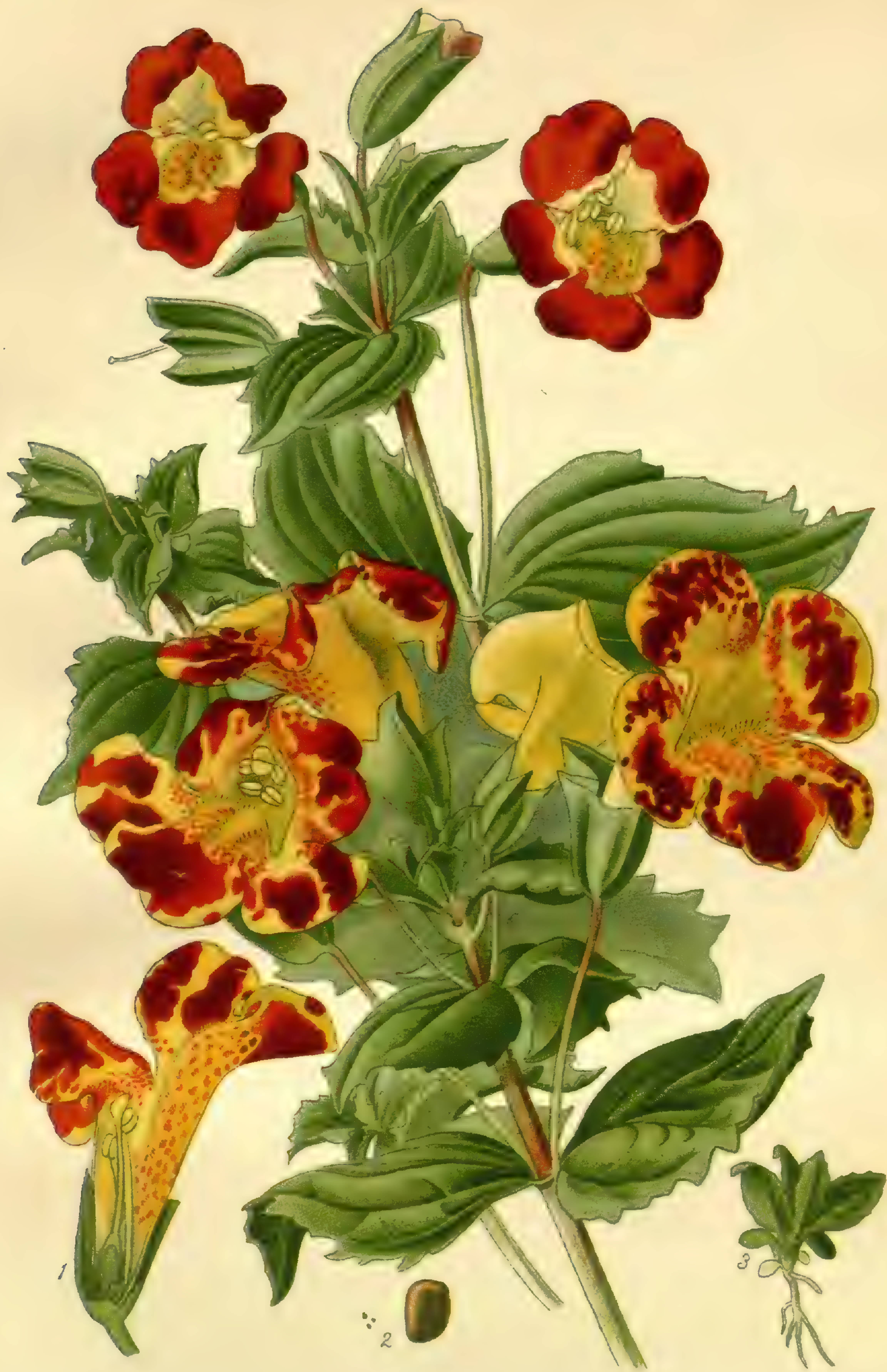
HARLEQUIN MONKEY FLOWER (MIMULUS LUTEUS VARIEGATUS)