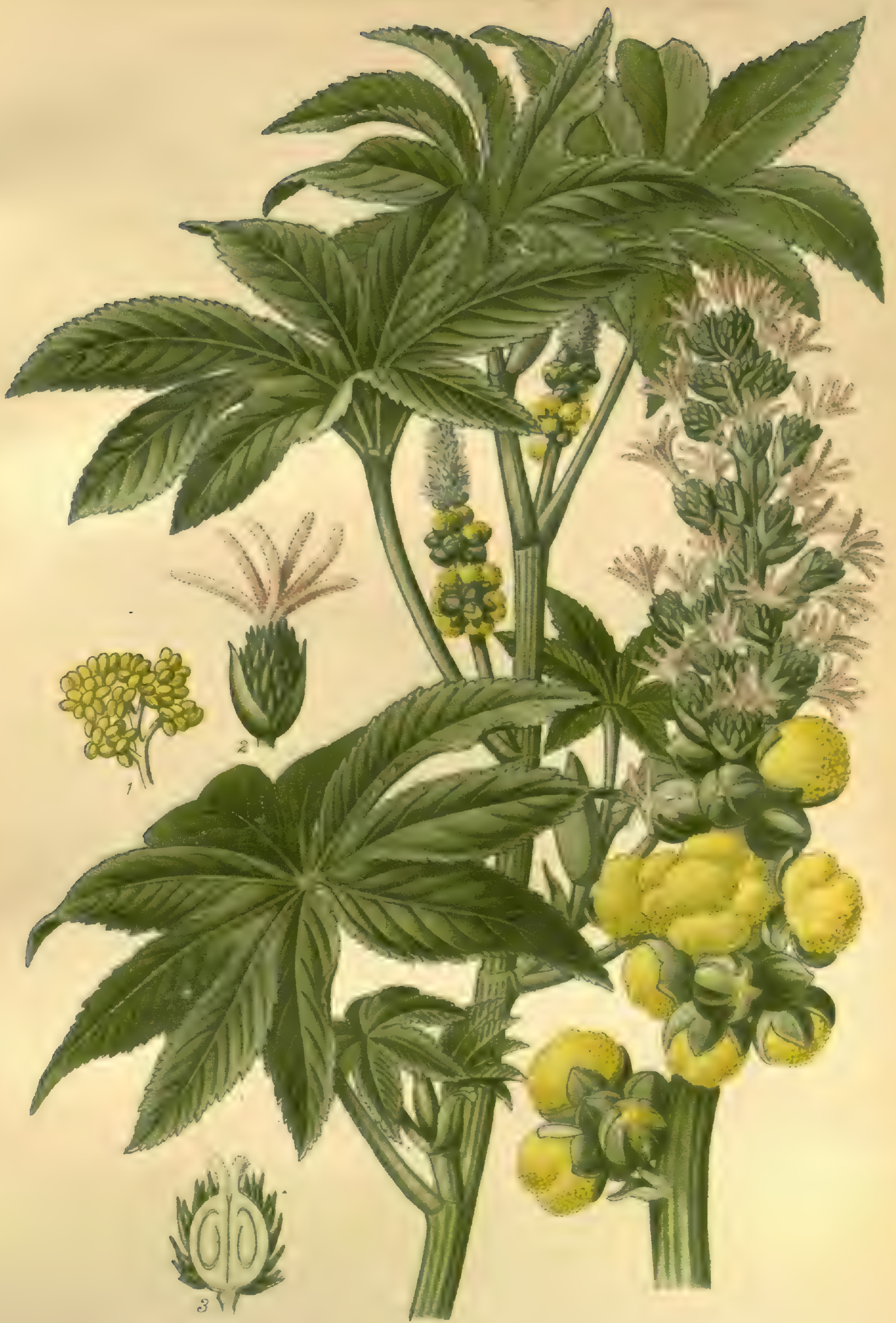
CASTOR-OIL PLANT ( RICINUS COMMUNIS )