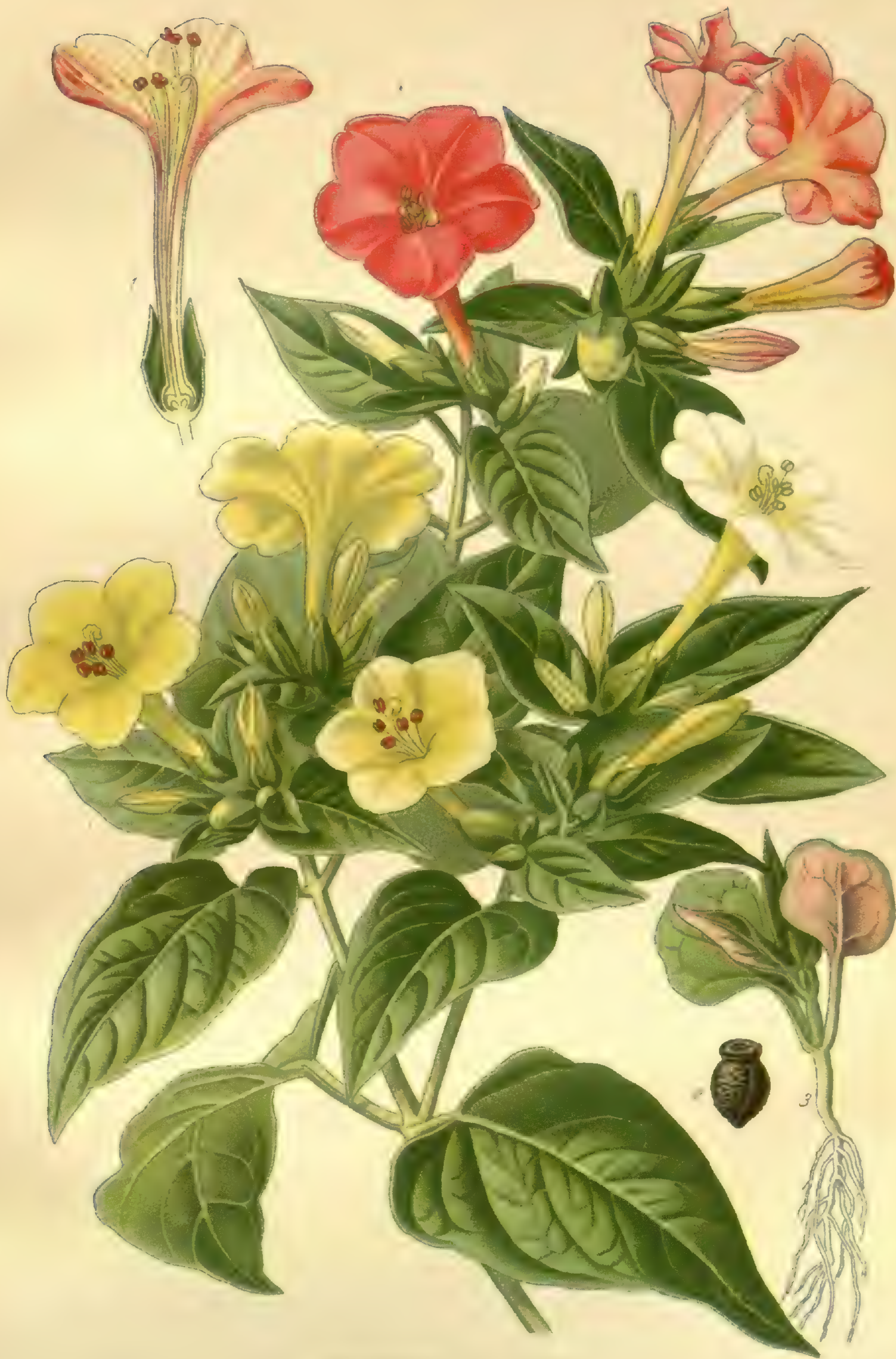
MARVEL OF PERU (MIRABILIS JALAPA)