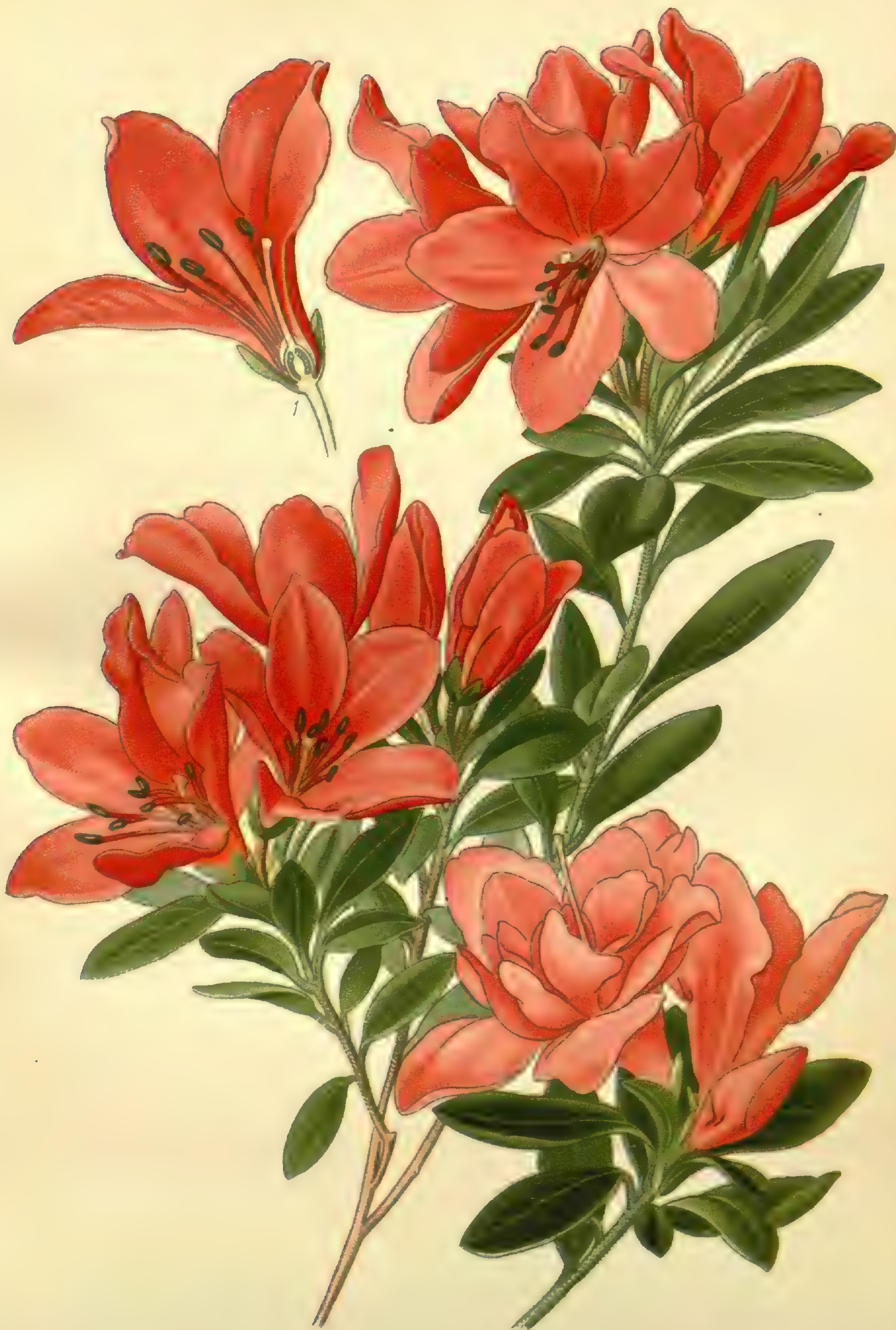
AZALEA (AZALEA INDICA)