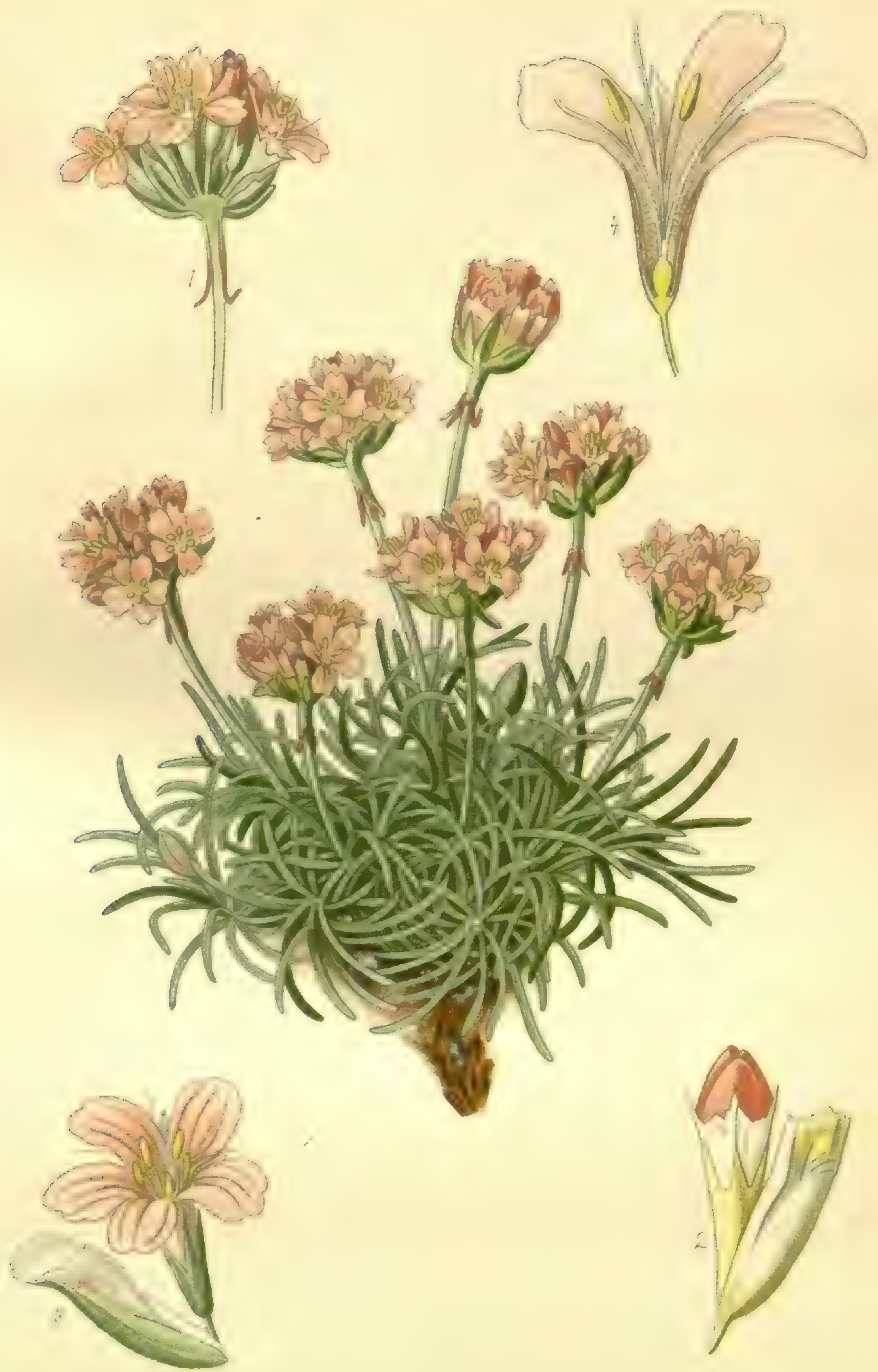
THRIFT OR SEA-PINK ( ARMERIA MARITIMA )