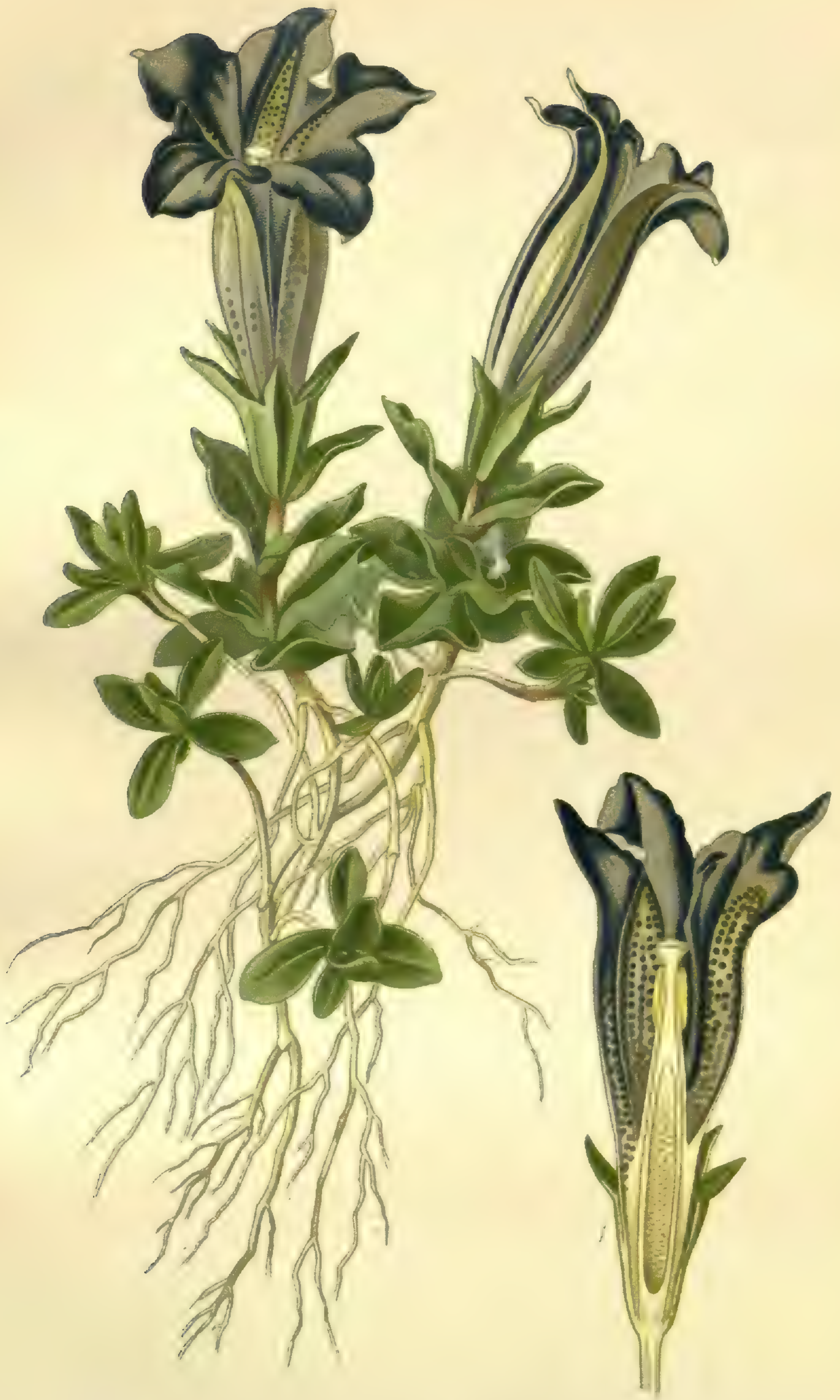
GENTIANELLA (GENTIANA ACAULIS)