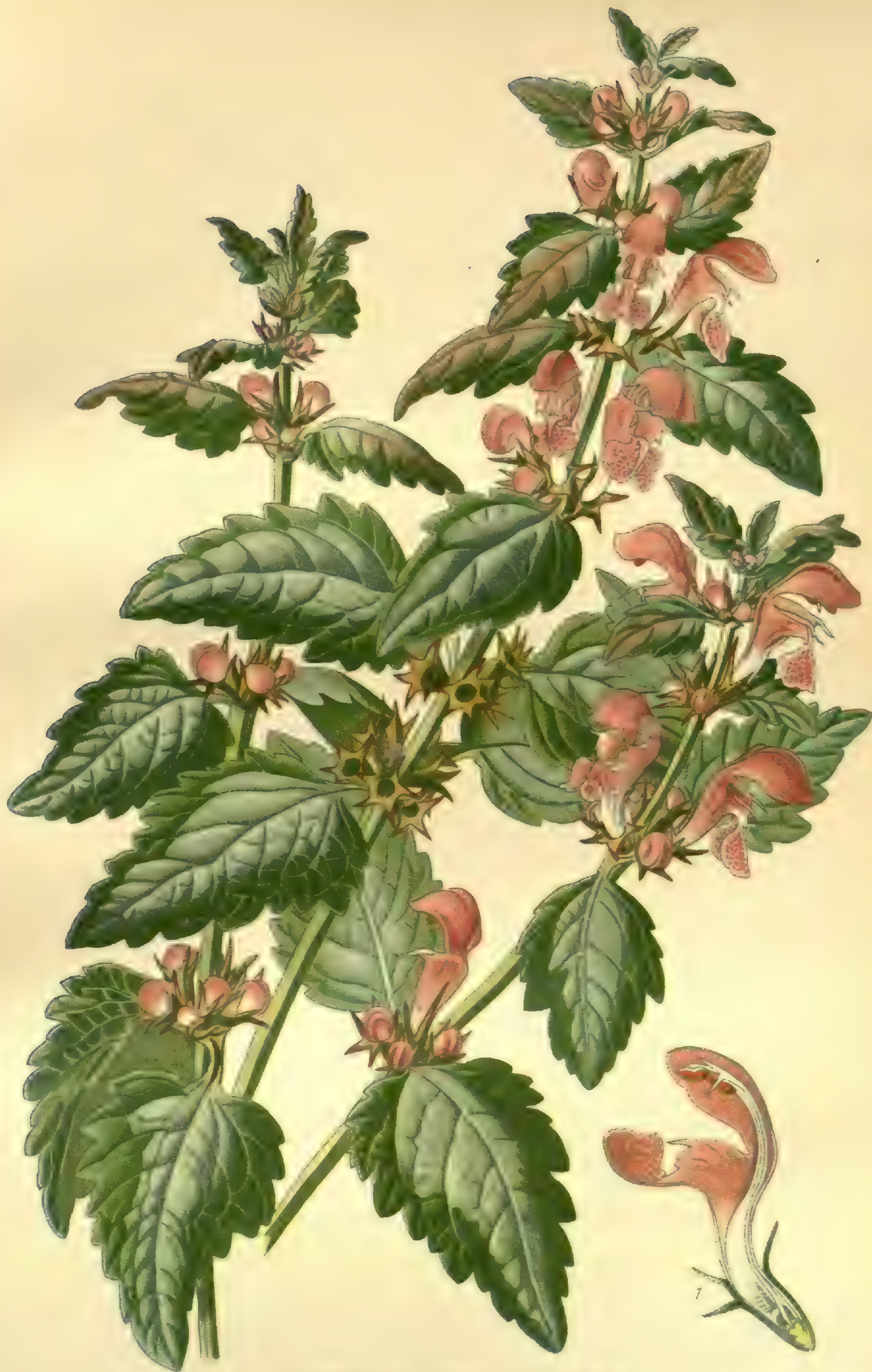
SPOTTED DEAD NETTLE ( LAMIUM MACULATUM )