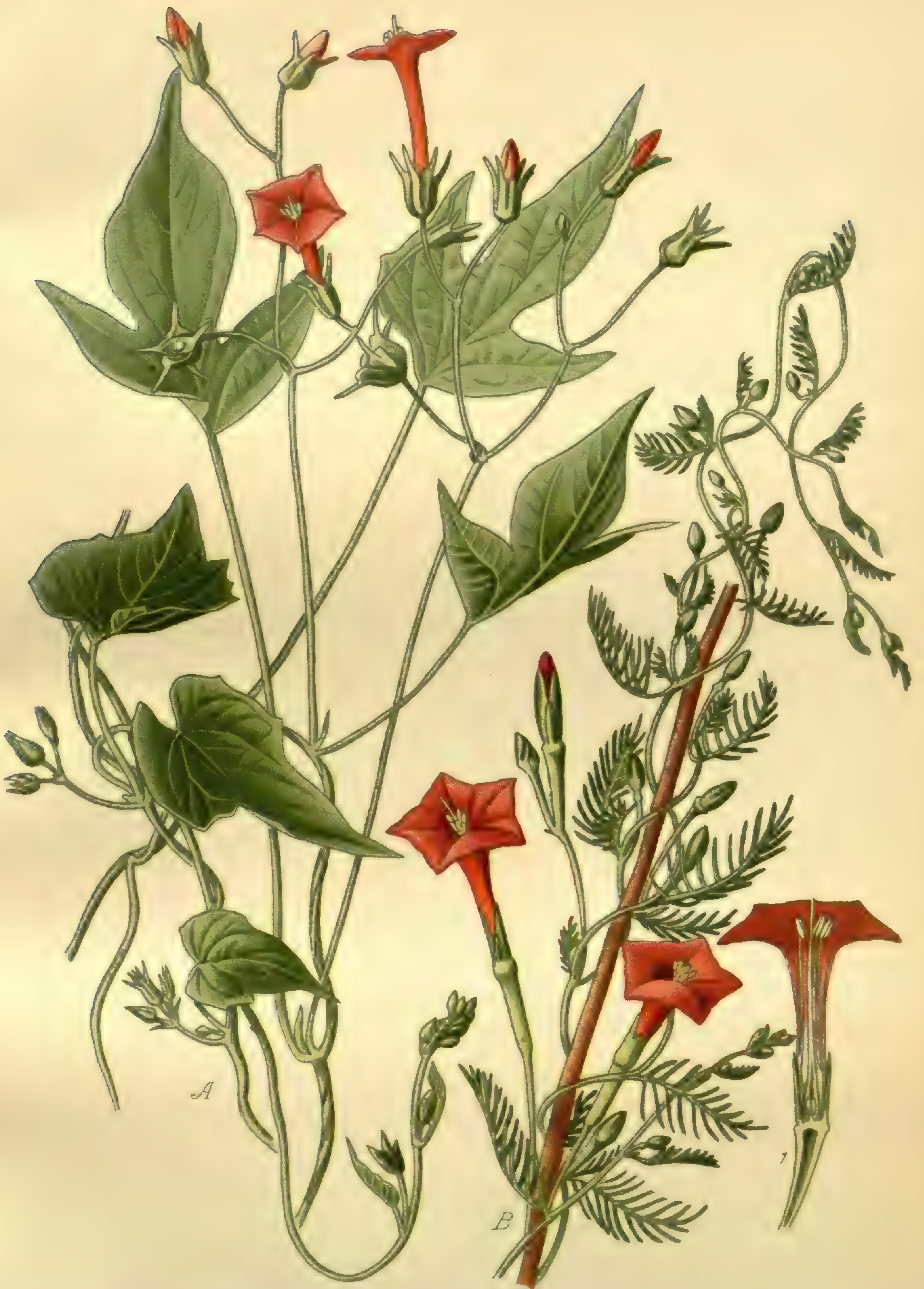
(A) I POMÆA COCCINEA