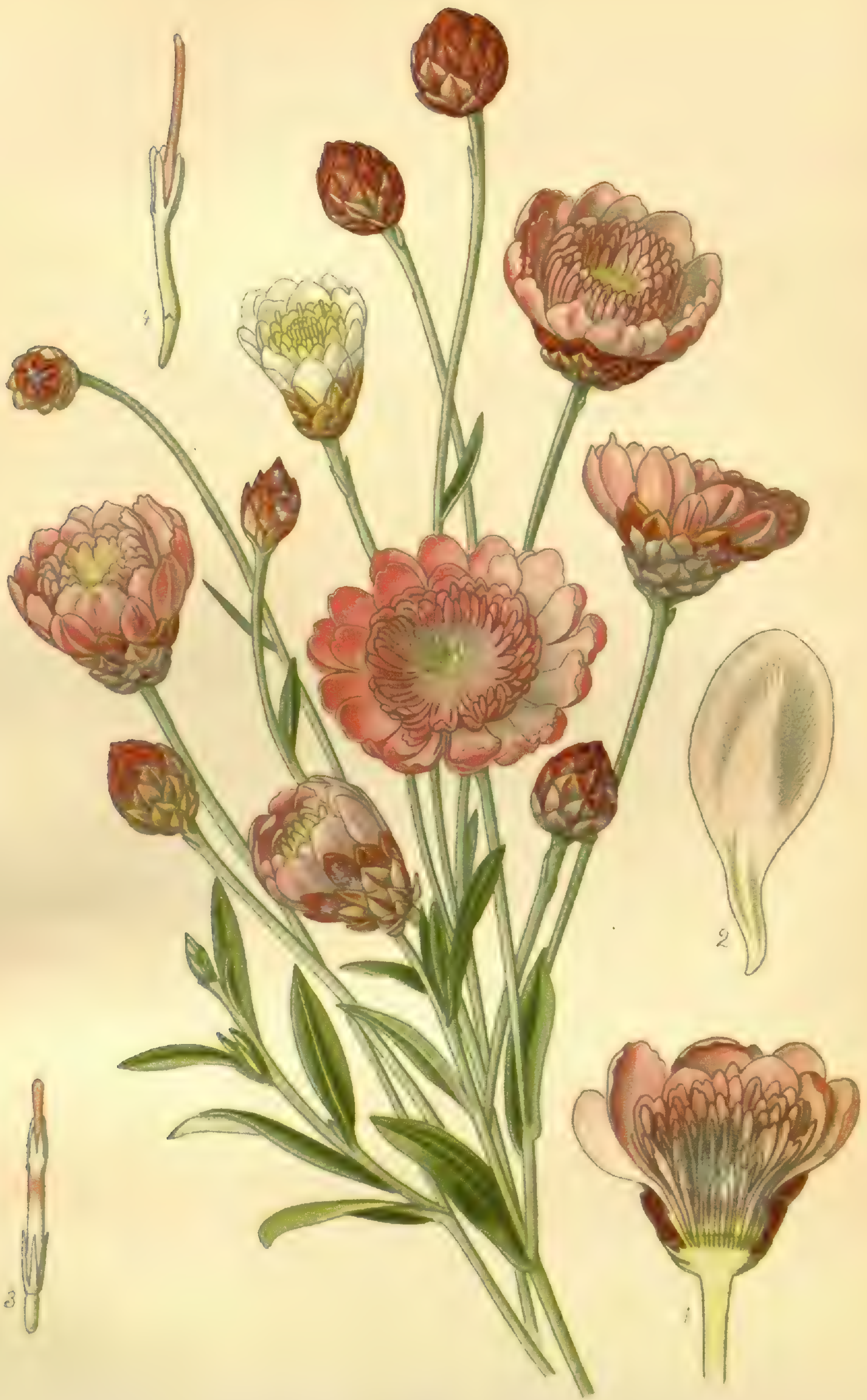
ANNUAL IMMORTELLE (XERANTHEMUM ANNUUM)