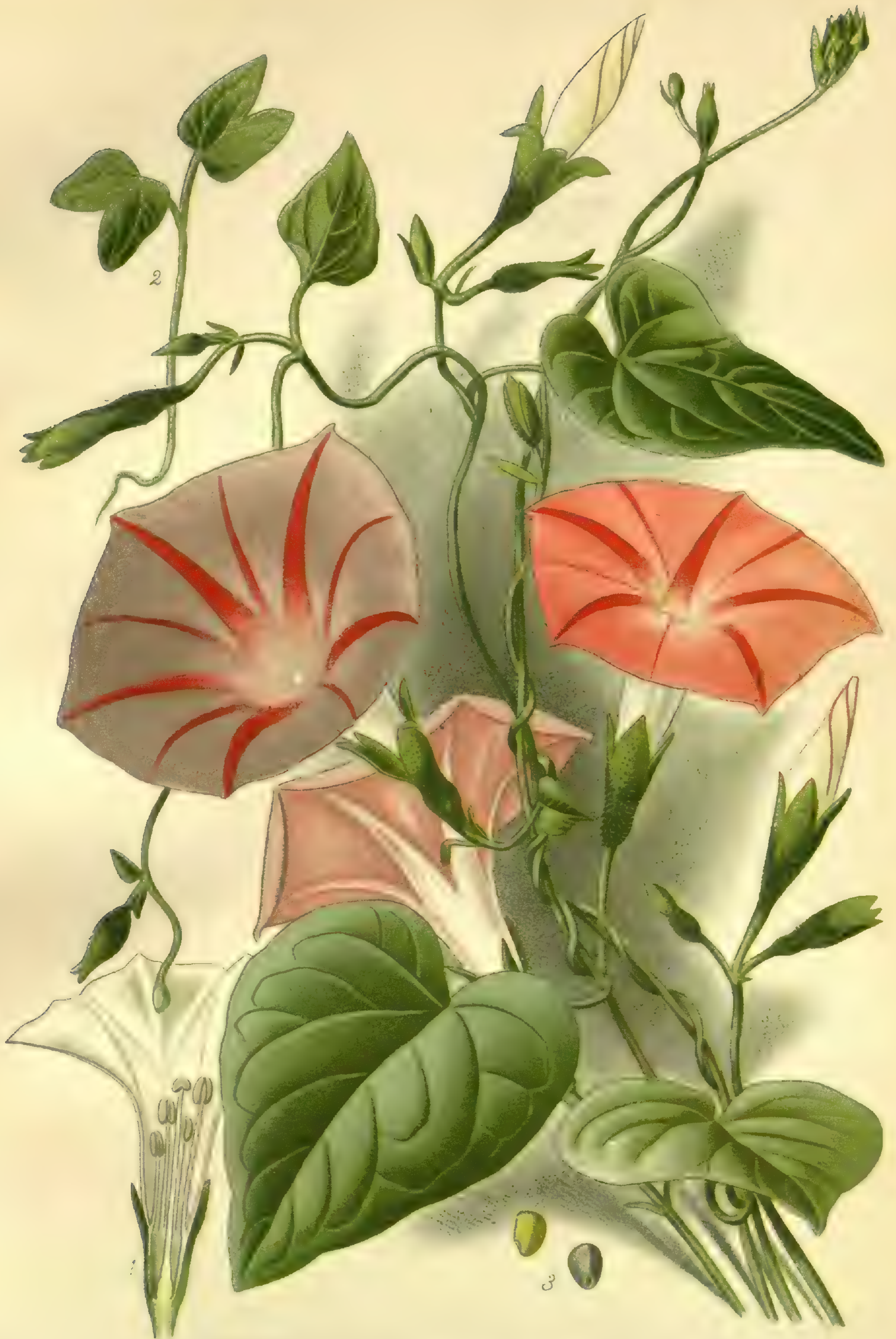
CONVOLVULUS, OR MORNING GLORY ( IPOMÆA PURPUREA )