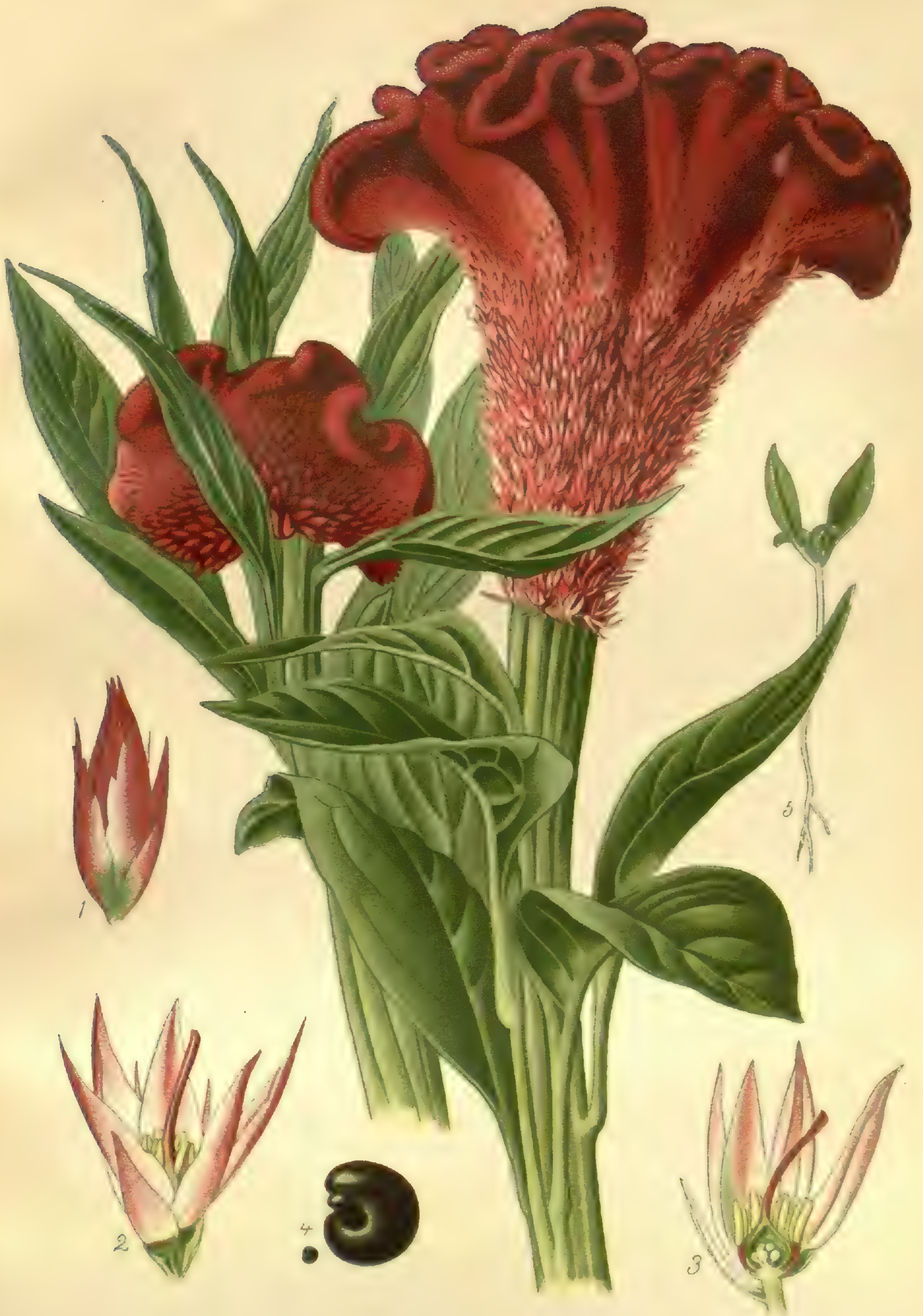
COCK'S-COMB (CELOSIA CRISTATA)