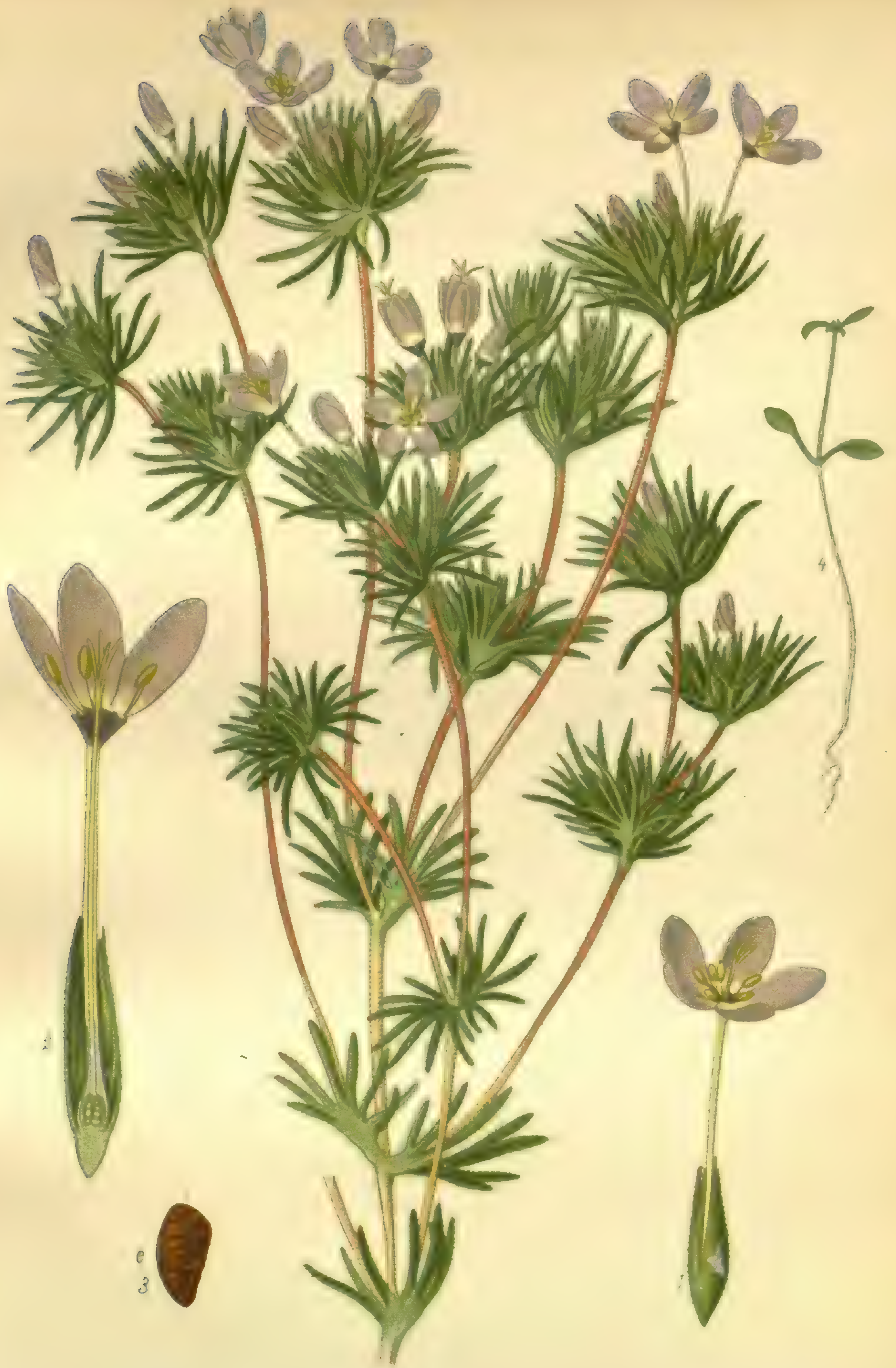
G ILIA (LEPTOSIPHON) ANDROSACEA