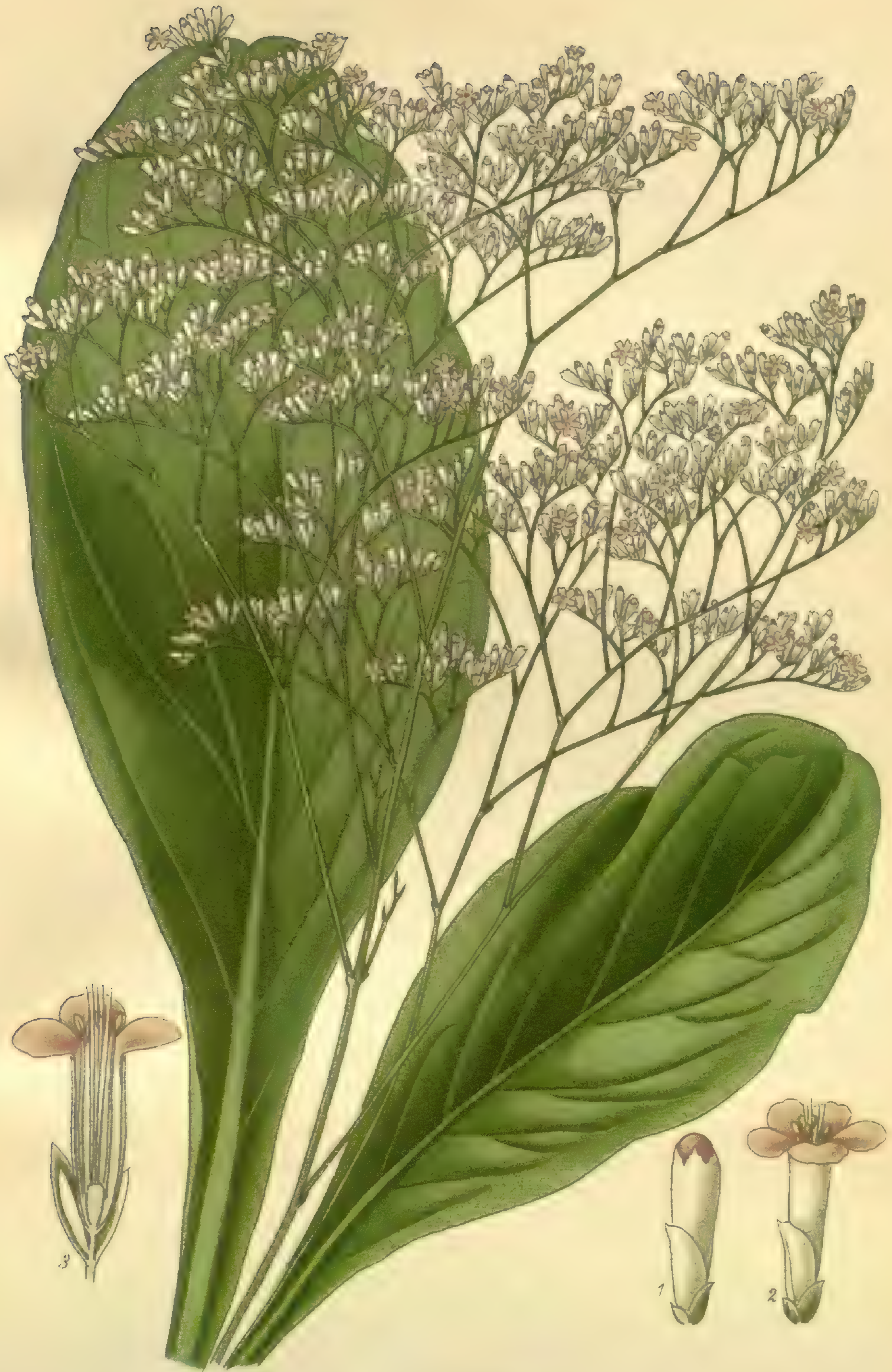
SEA LAVENDER ( STATICE LATIFOLIA )