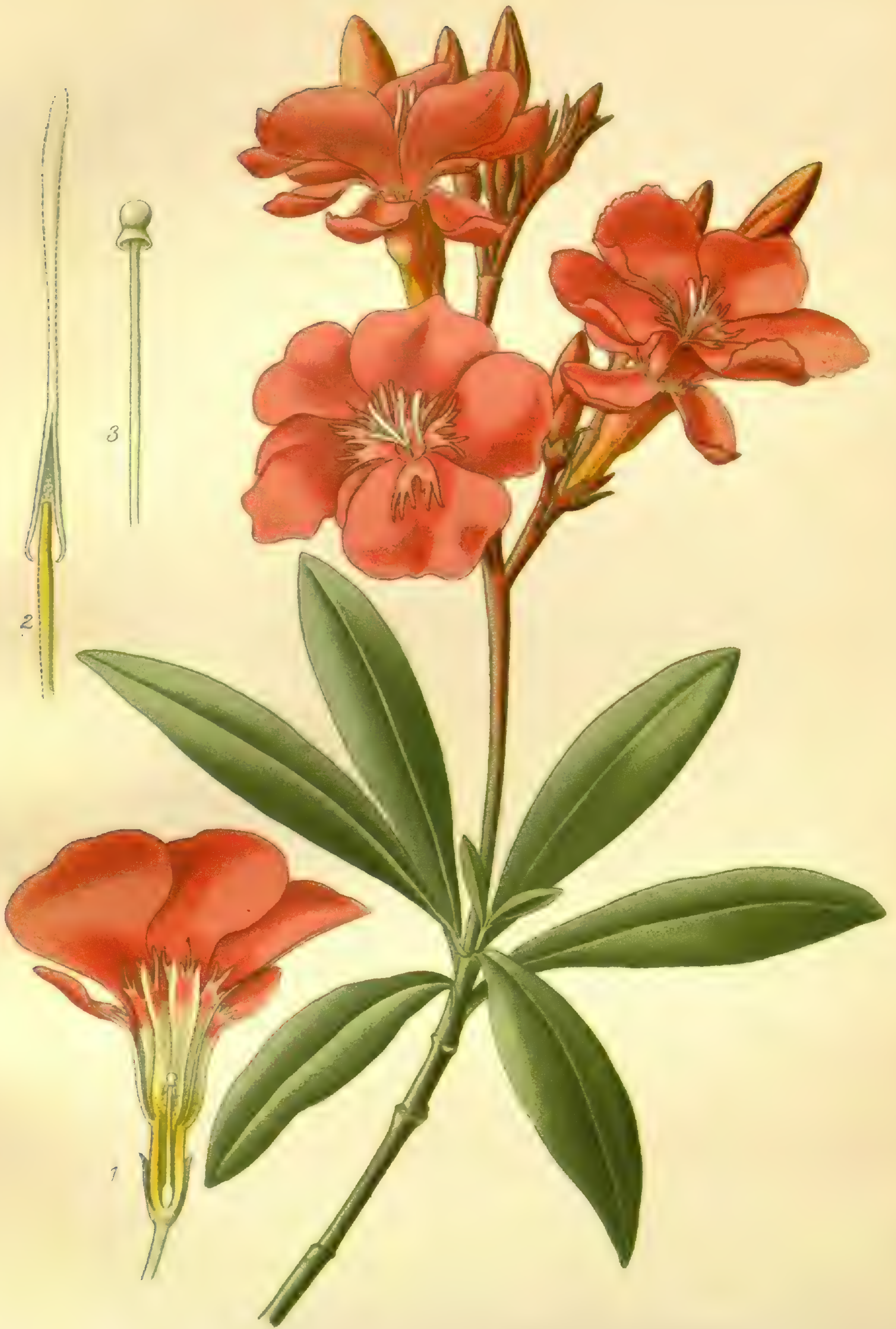
OLEANDER (NERIUM OLEANDER)