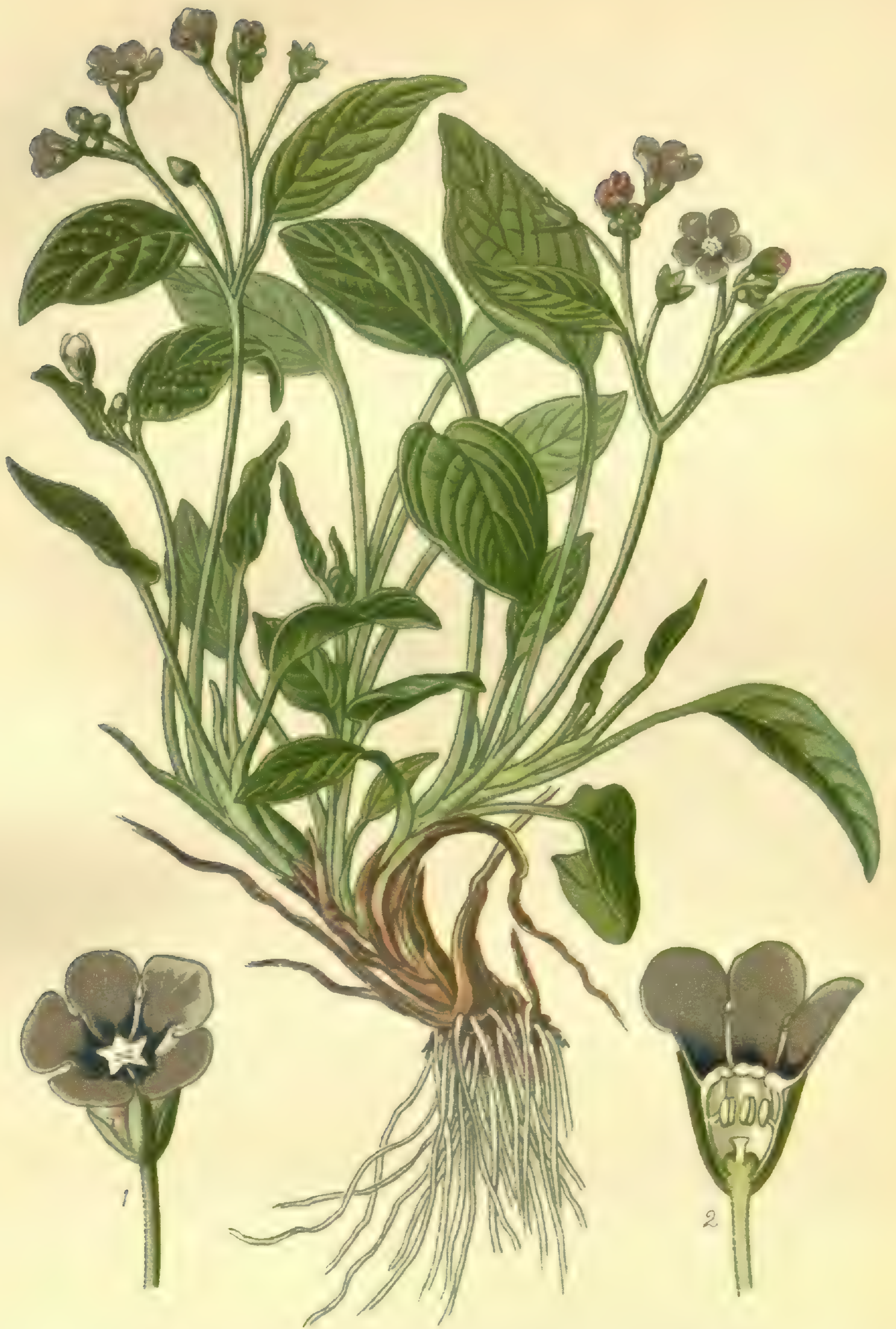
VENUS' NAVELWORT ( OMPHALODES VERNA )