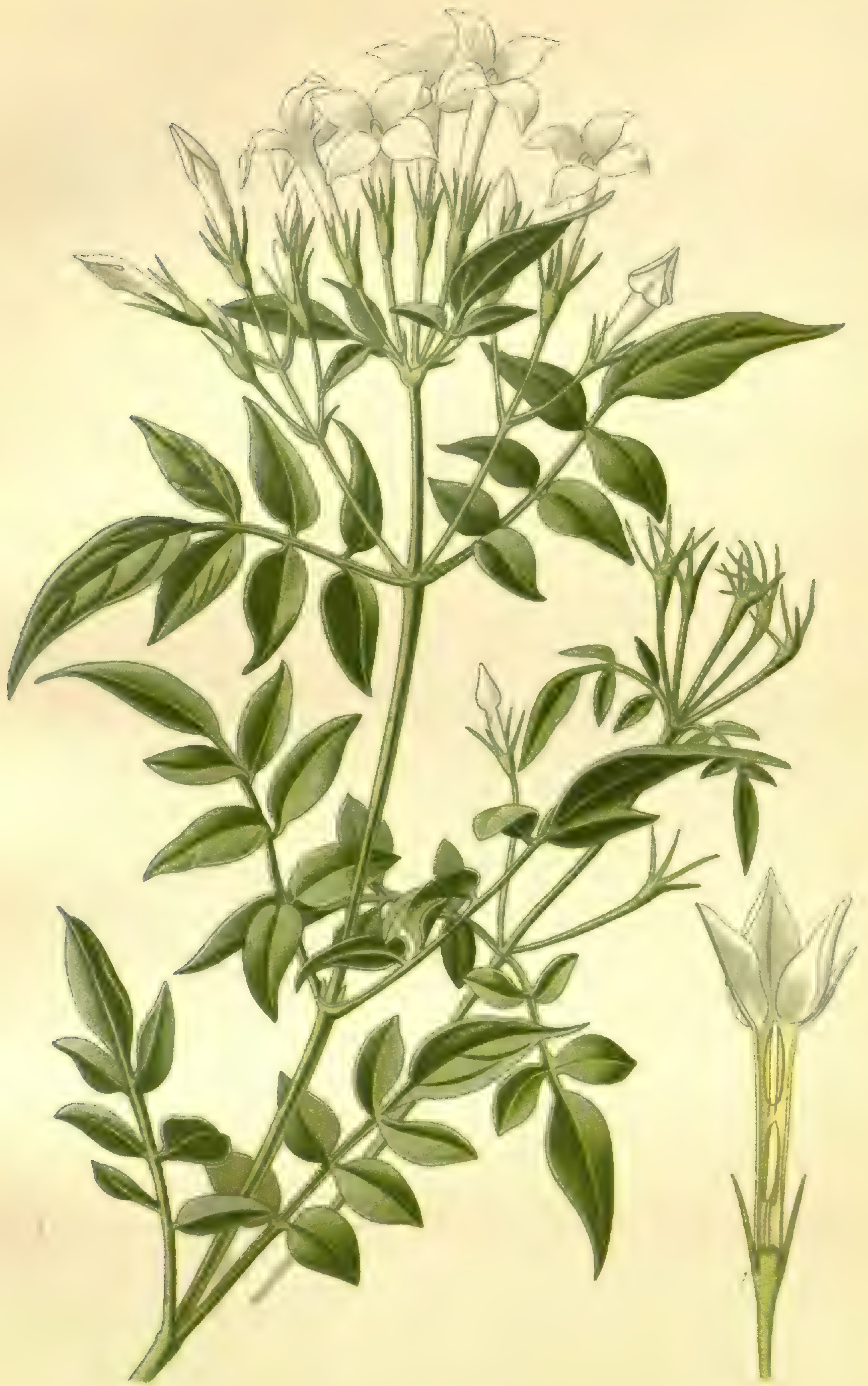
JASMINE (JASMINUM OFFICINALE)