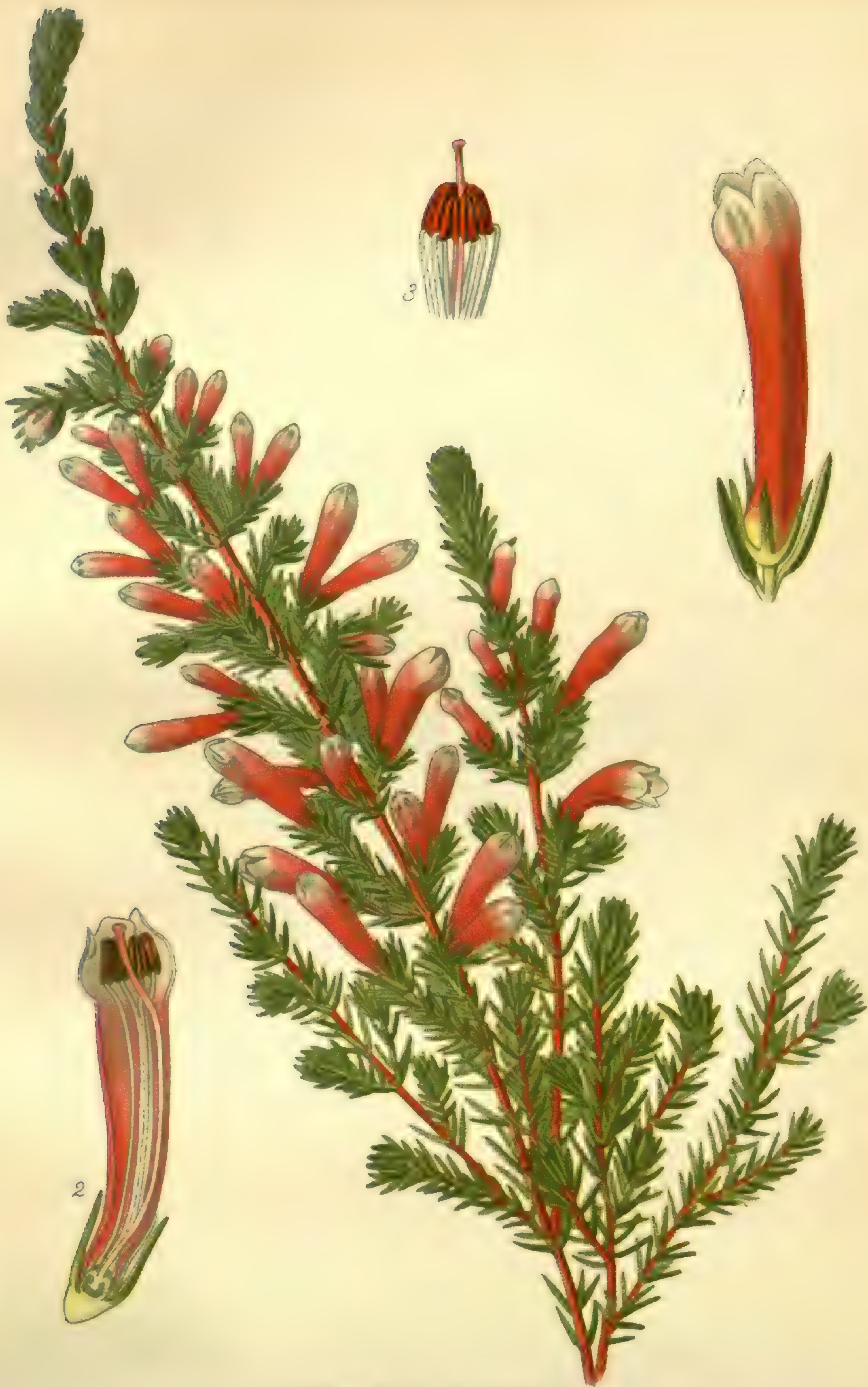
WILMORE'S HEATH ( ERICA WILMOREANA )