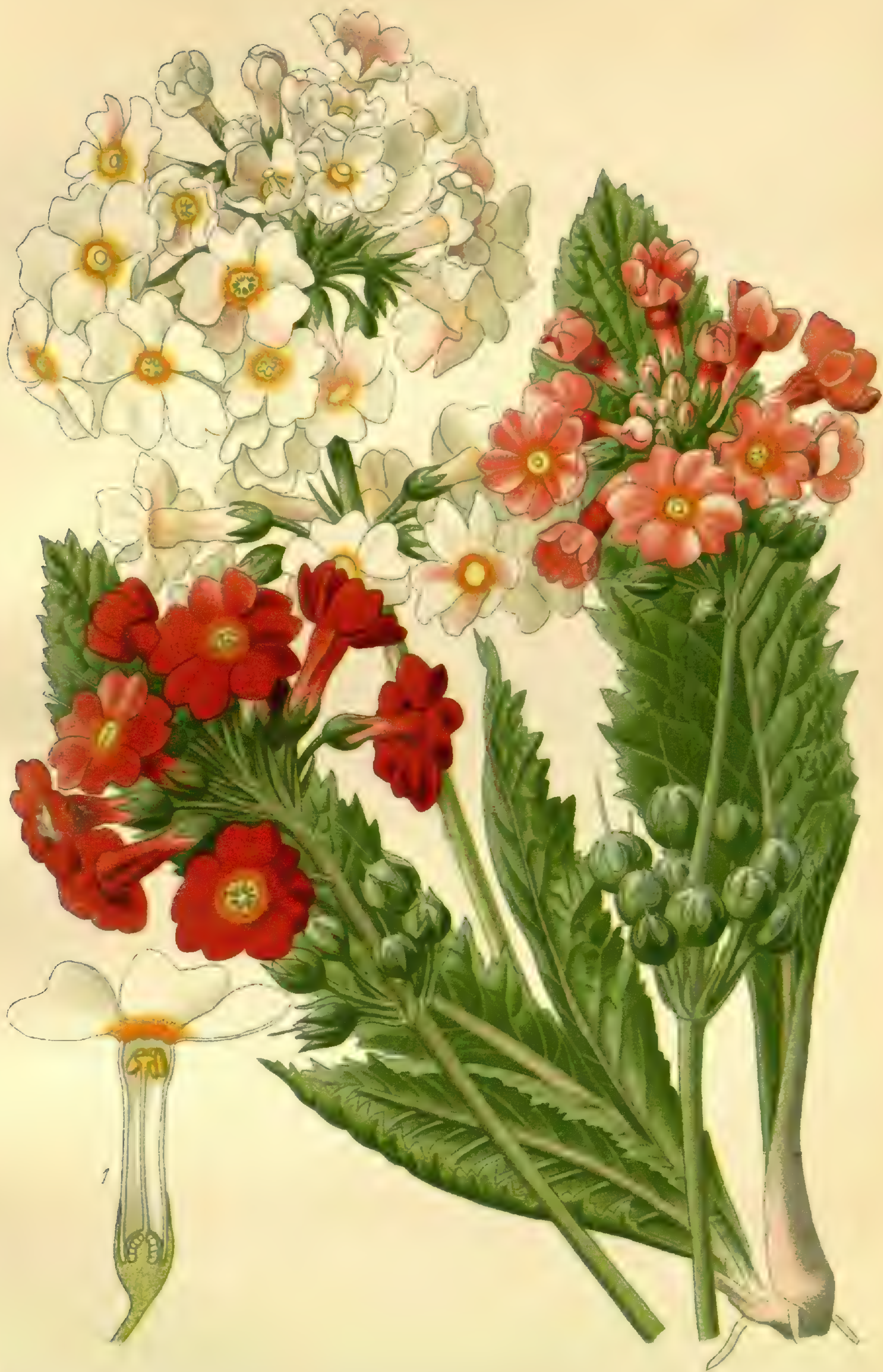
JAPANESE PRIMROSE ( PRIMULA JAPONICA)