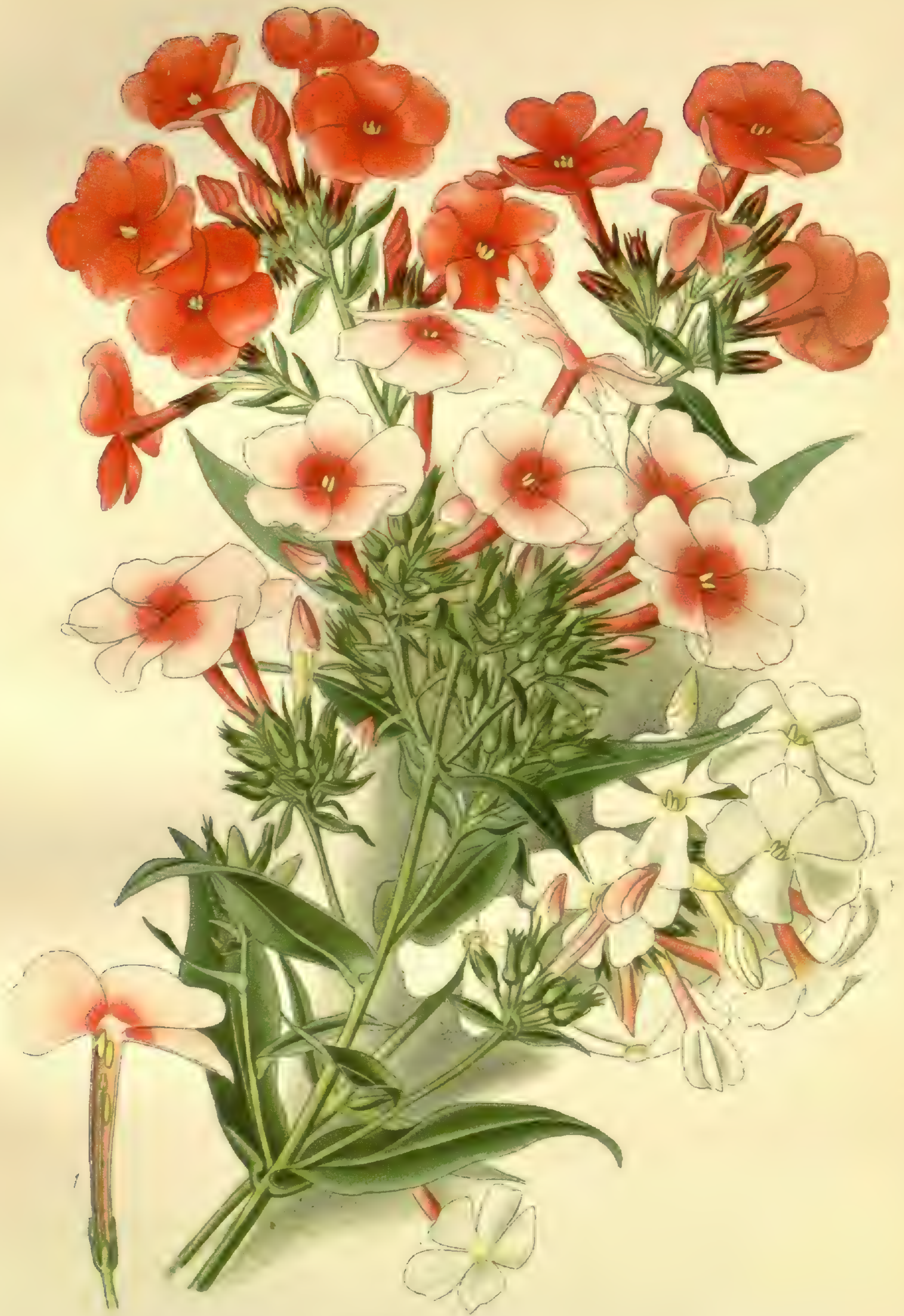
PERENNIAL PHLOX ( PHLOX PANICULATA , var. )