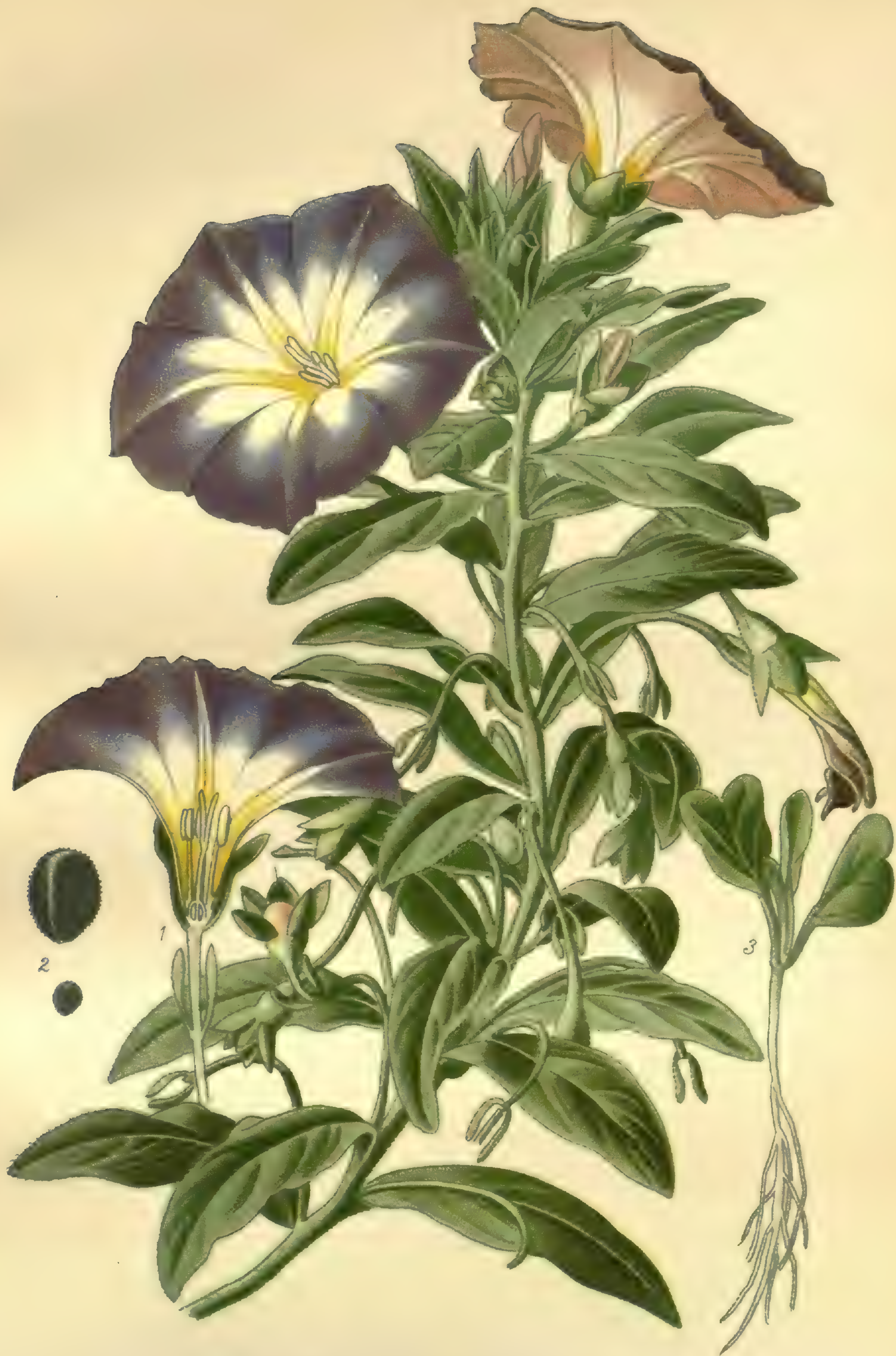
MINOR CONVULVULUS (CONVOLVULUS TRICOLOR)