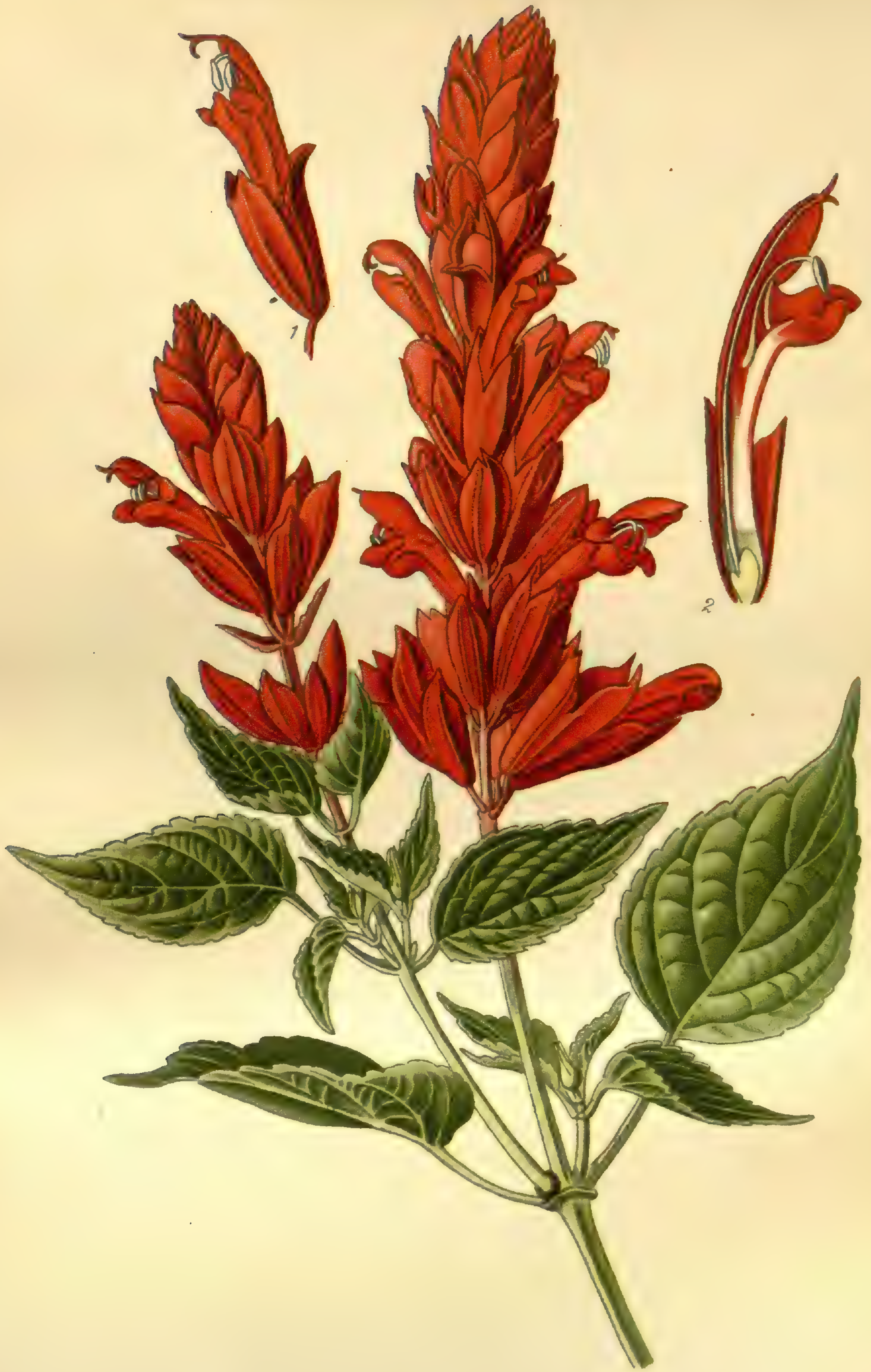
SCARLET SAGE ( SALVIA SPLENDENS )