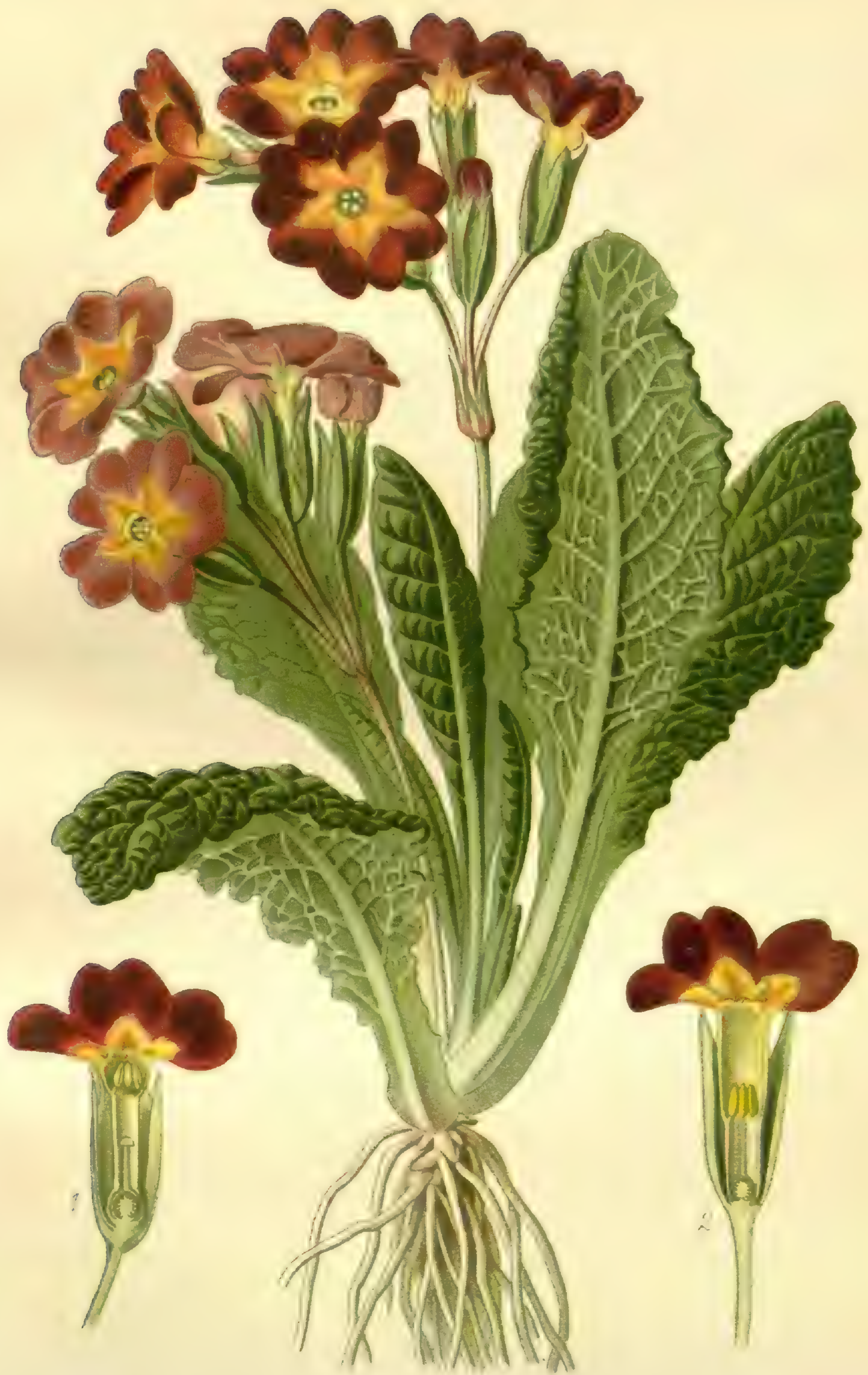
POLYANTHUS (PRIMULA VARIABILIS)