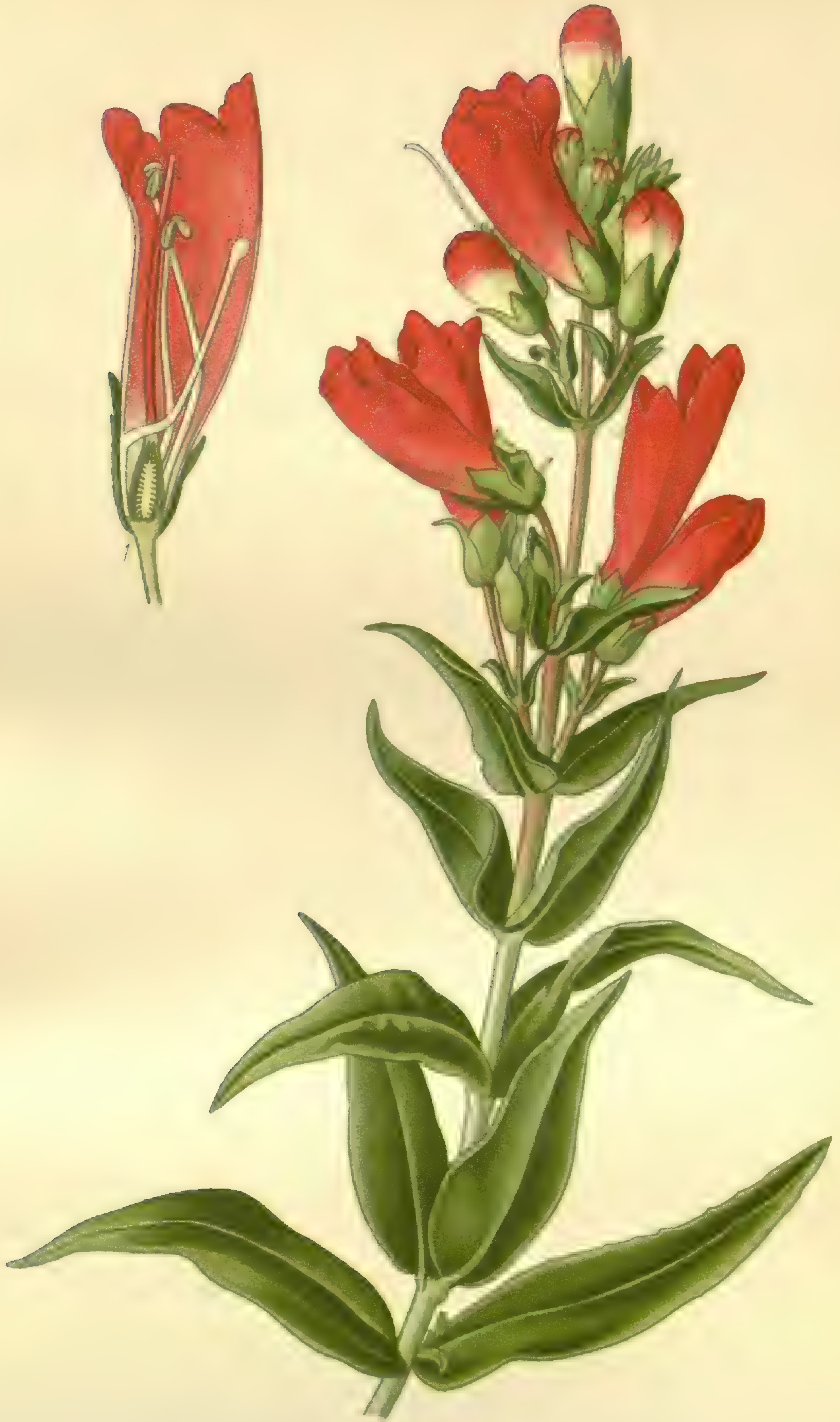
BEARD-TONGUE (PENTSTEMON HARTWEGI)