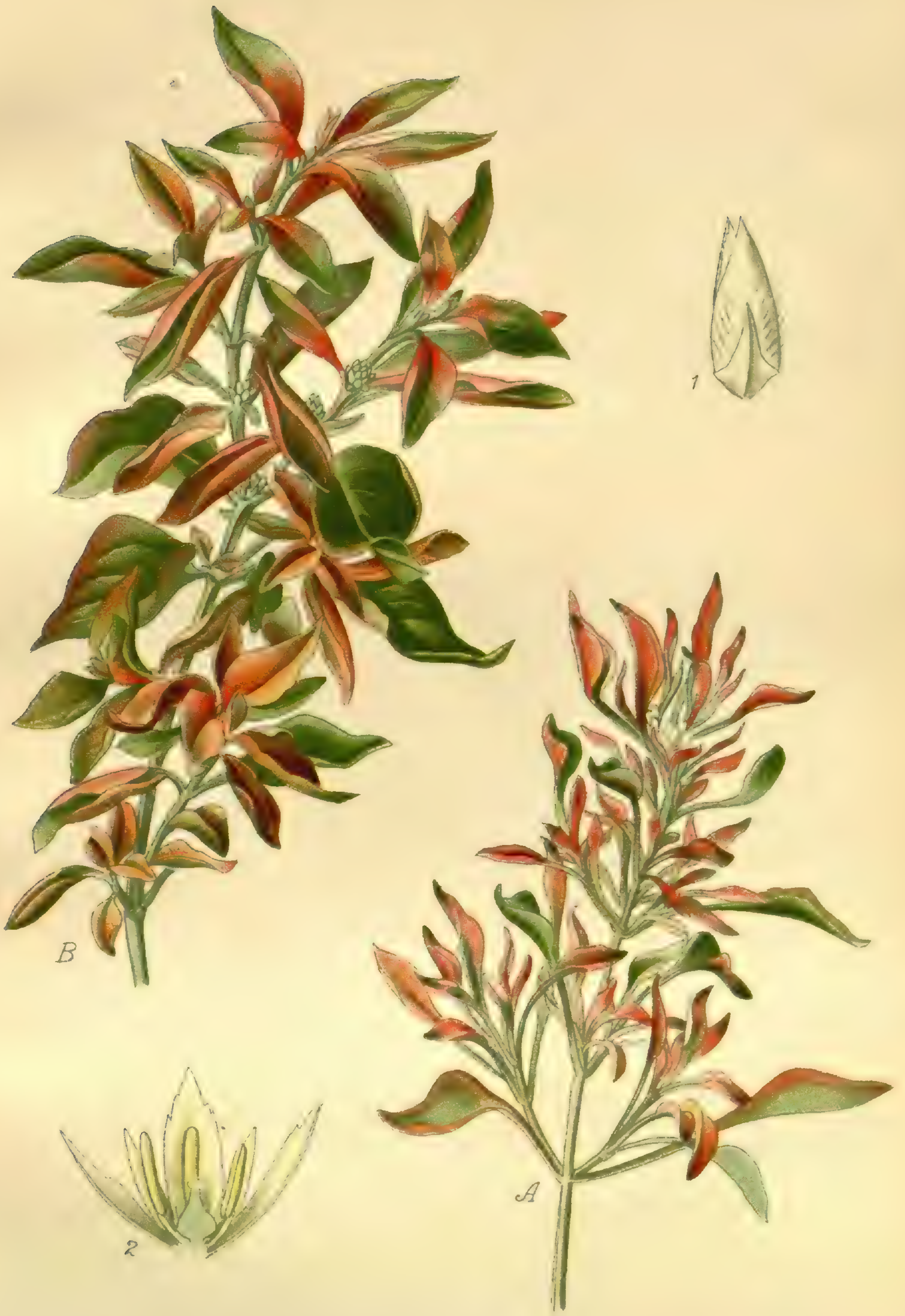
(A) TELANTHERA AMÆNA