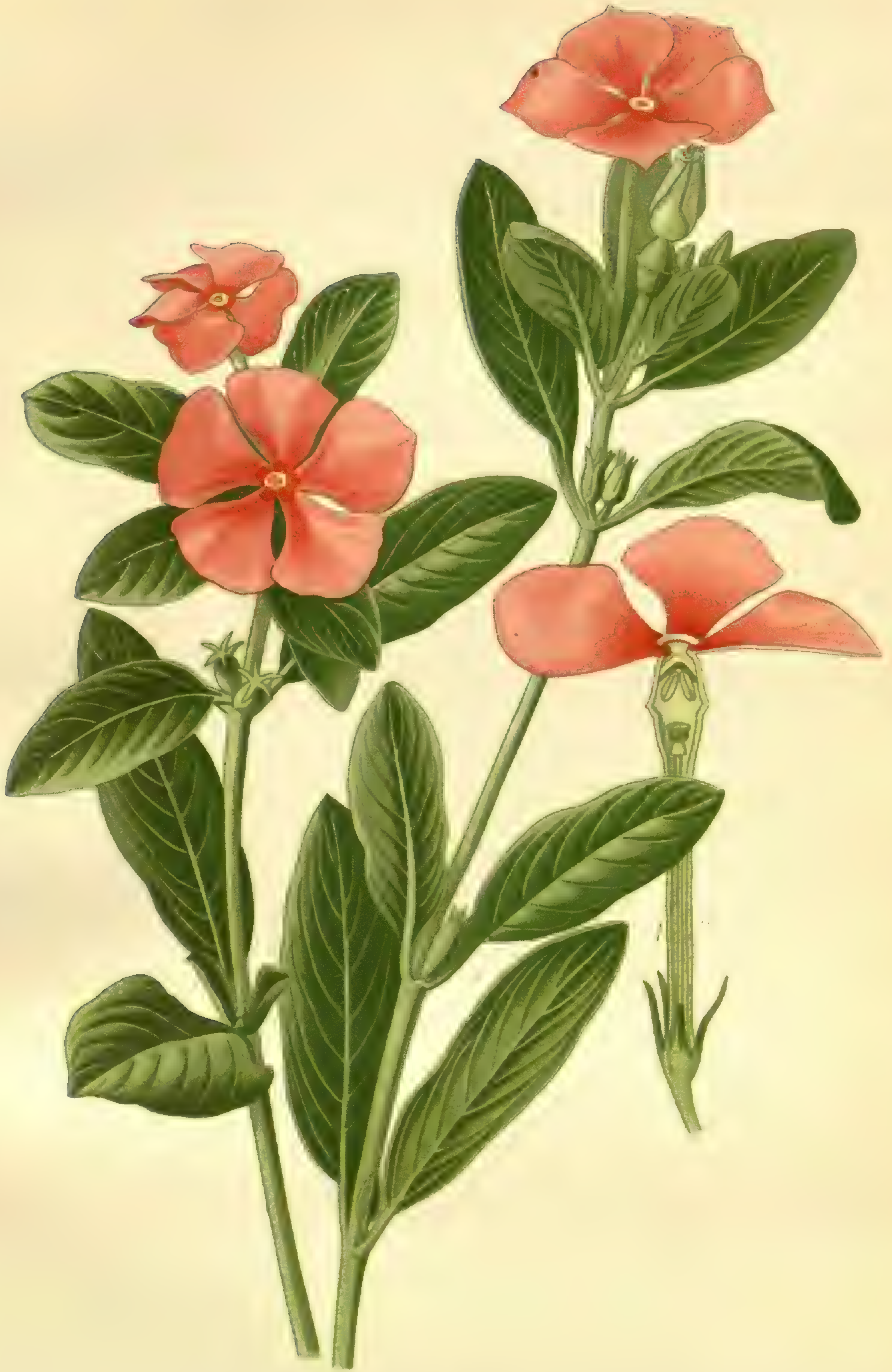
OLD MAID (VINCA ROSEA)