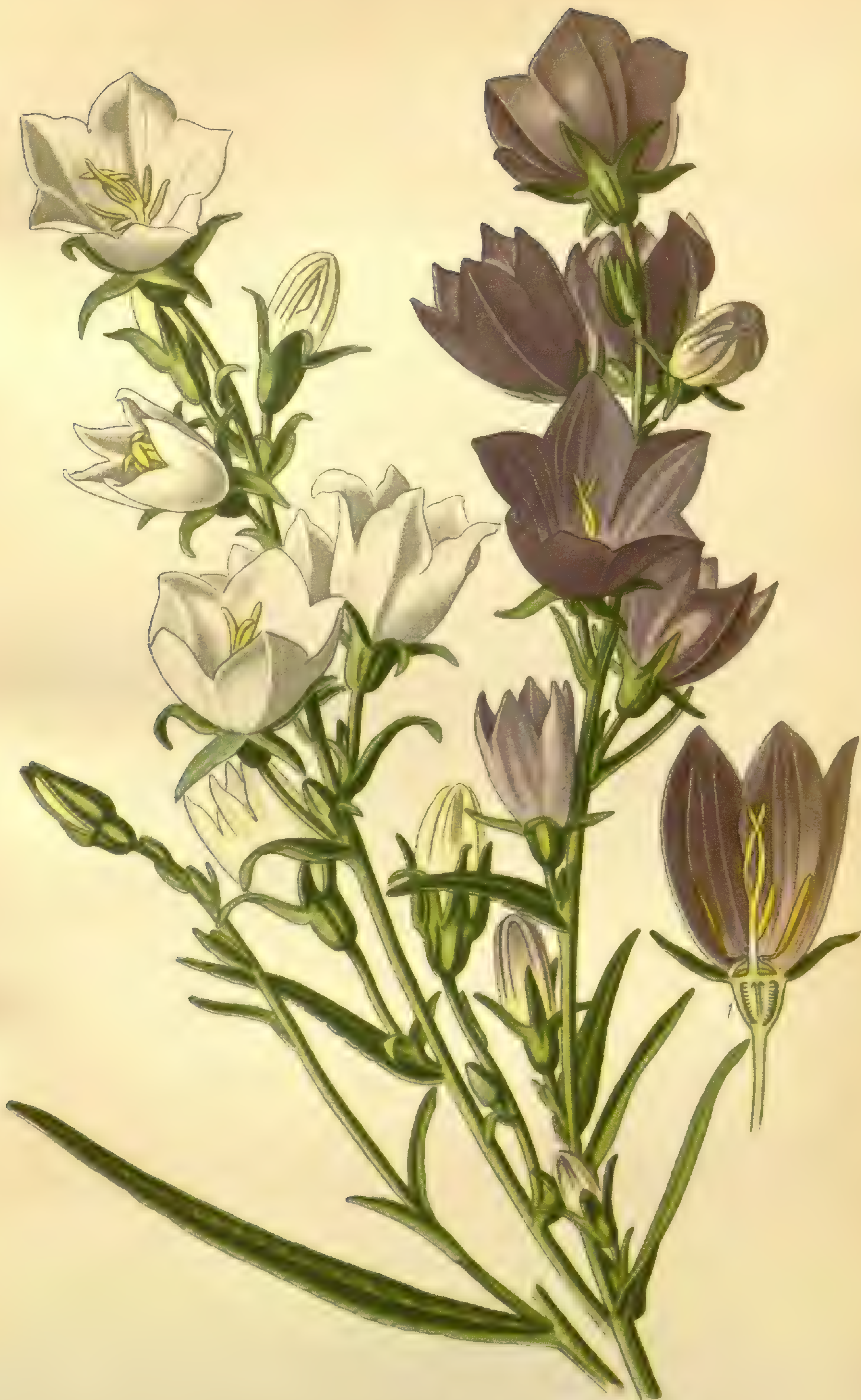
PEACH-LEAVED BELL-FLOWER ( CAMPANULA PERSICIFOLIA )