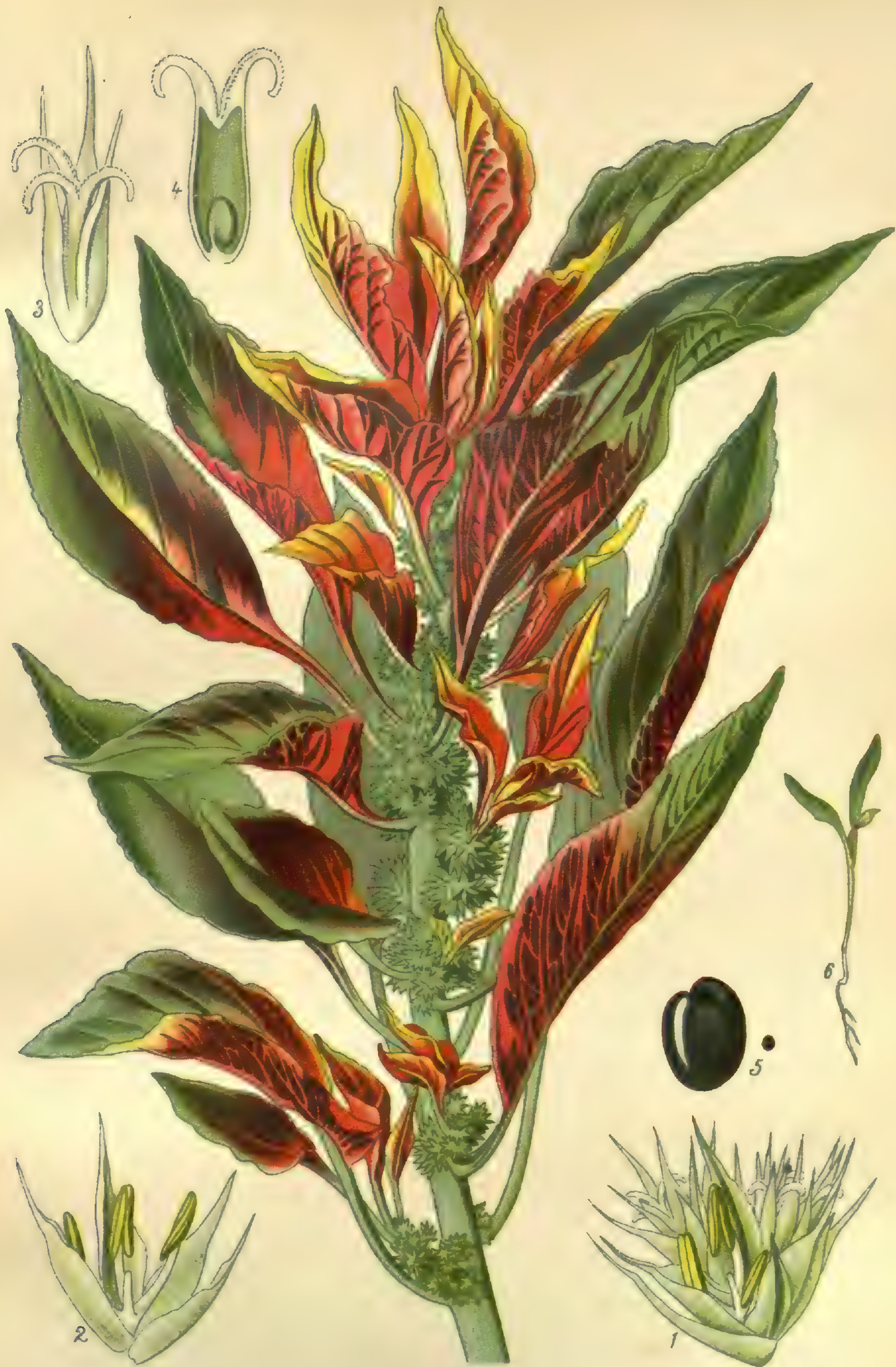
VARIEGATED AMARANTH (AMARANTUS TRICOLOR)