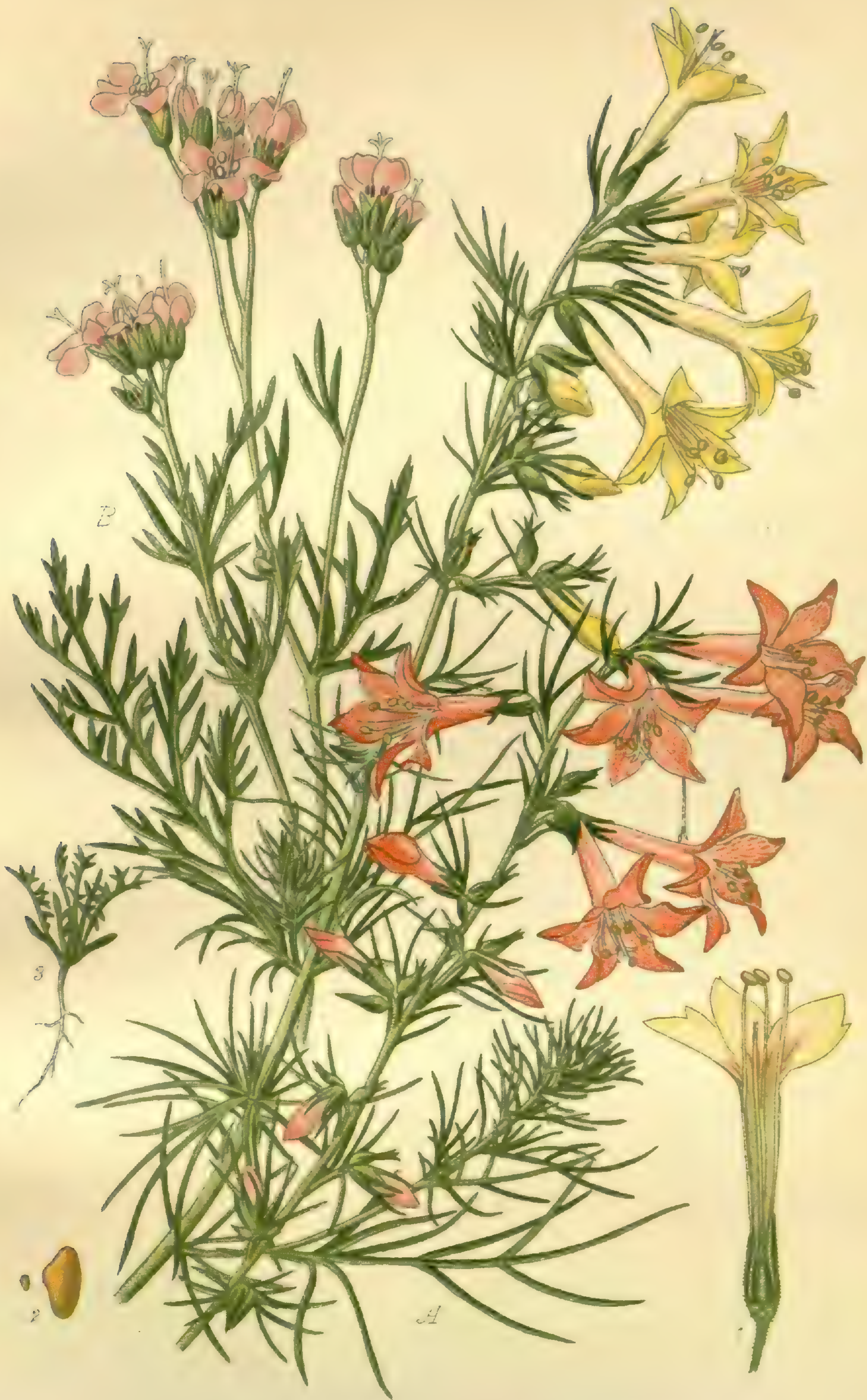
(A) GILIA CORONOPIFOLIA (B) GILIA TRICOLOR