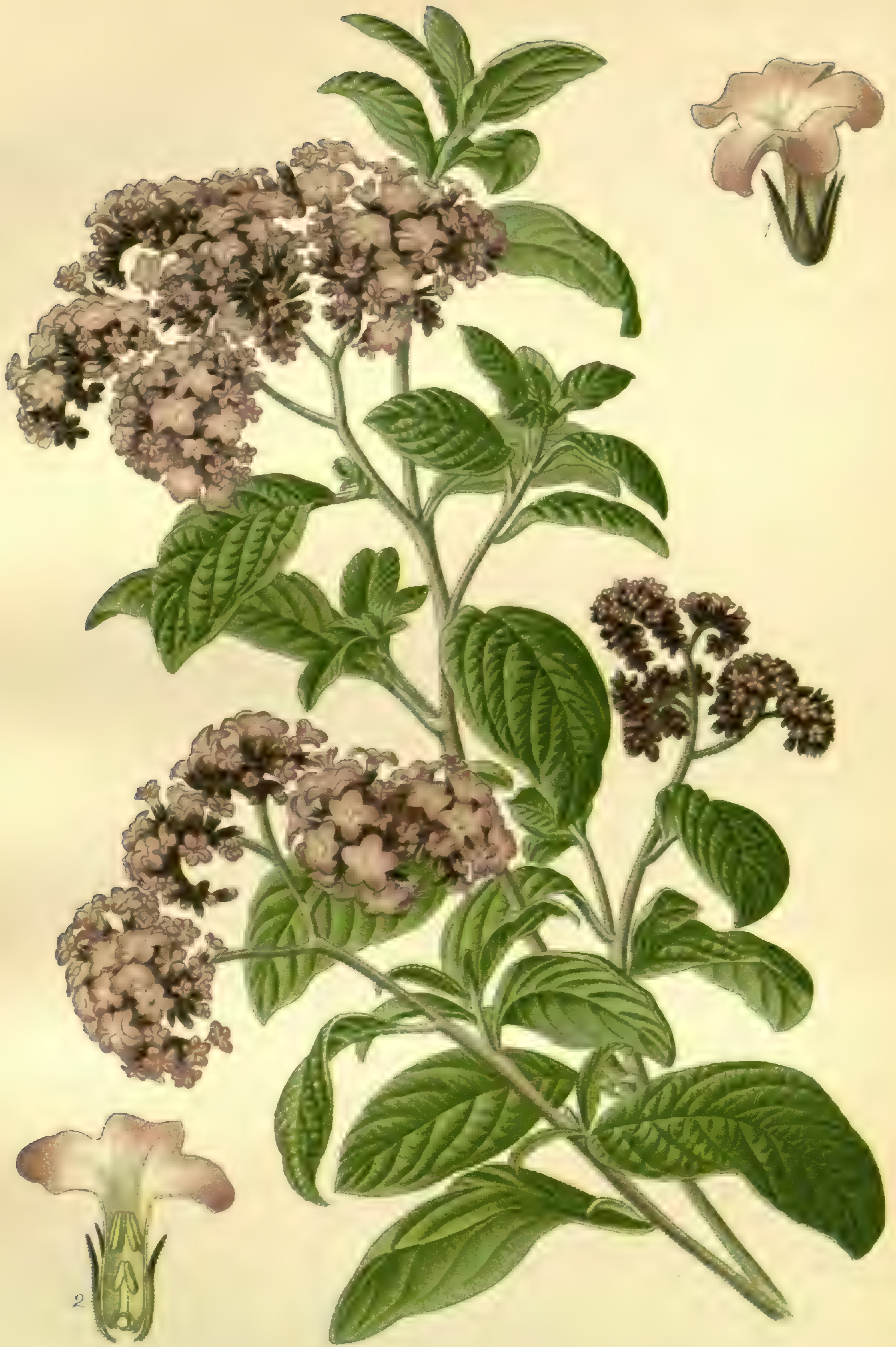
CHERRY PIE ( HELIOTROPIUM PERUVIANUM)