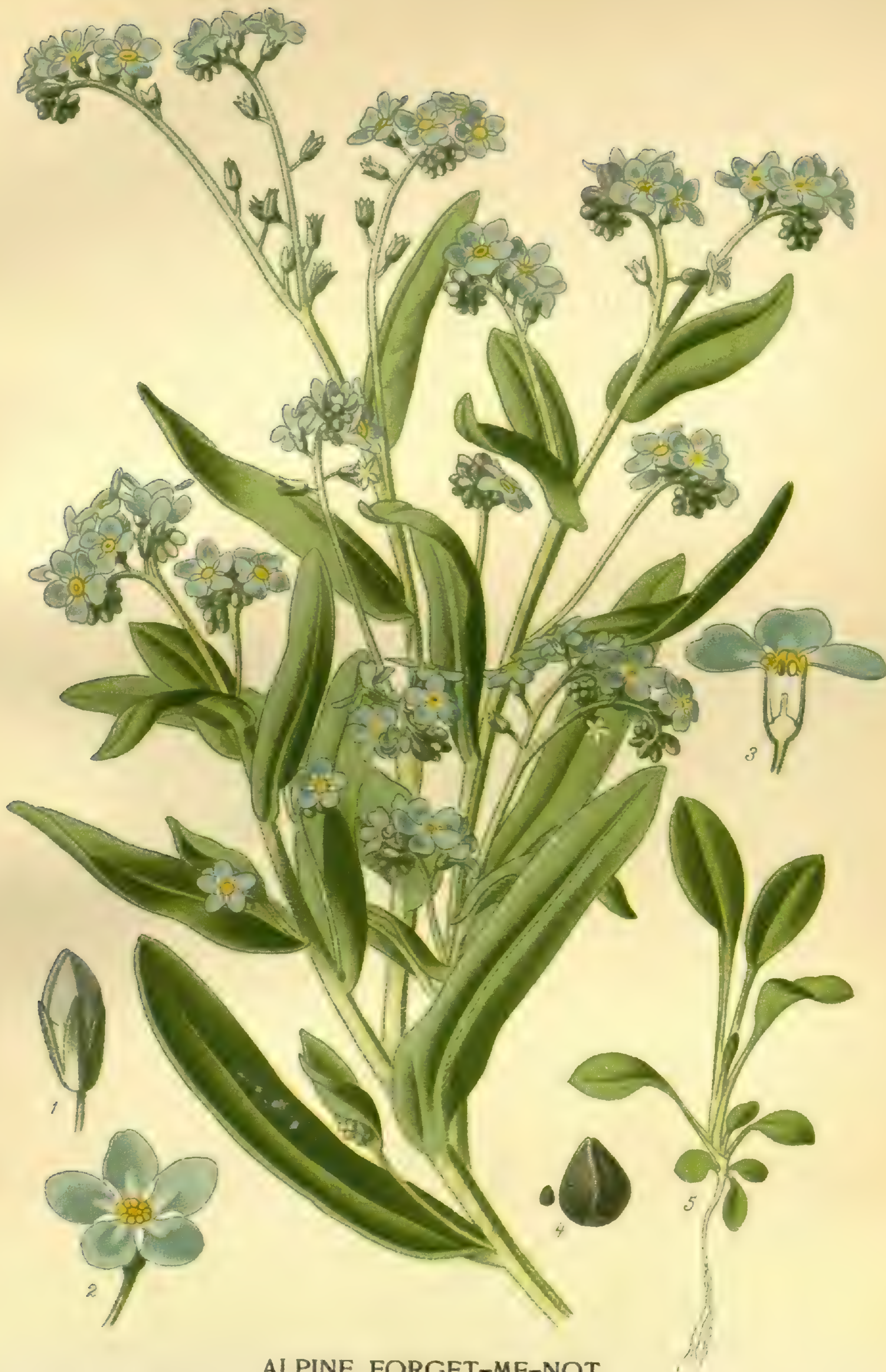
ALPINE FORGET-ME-NOT ( MYOSOTIS ALPESTRIS )