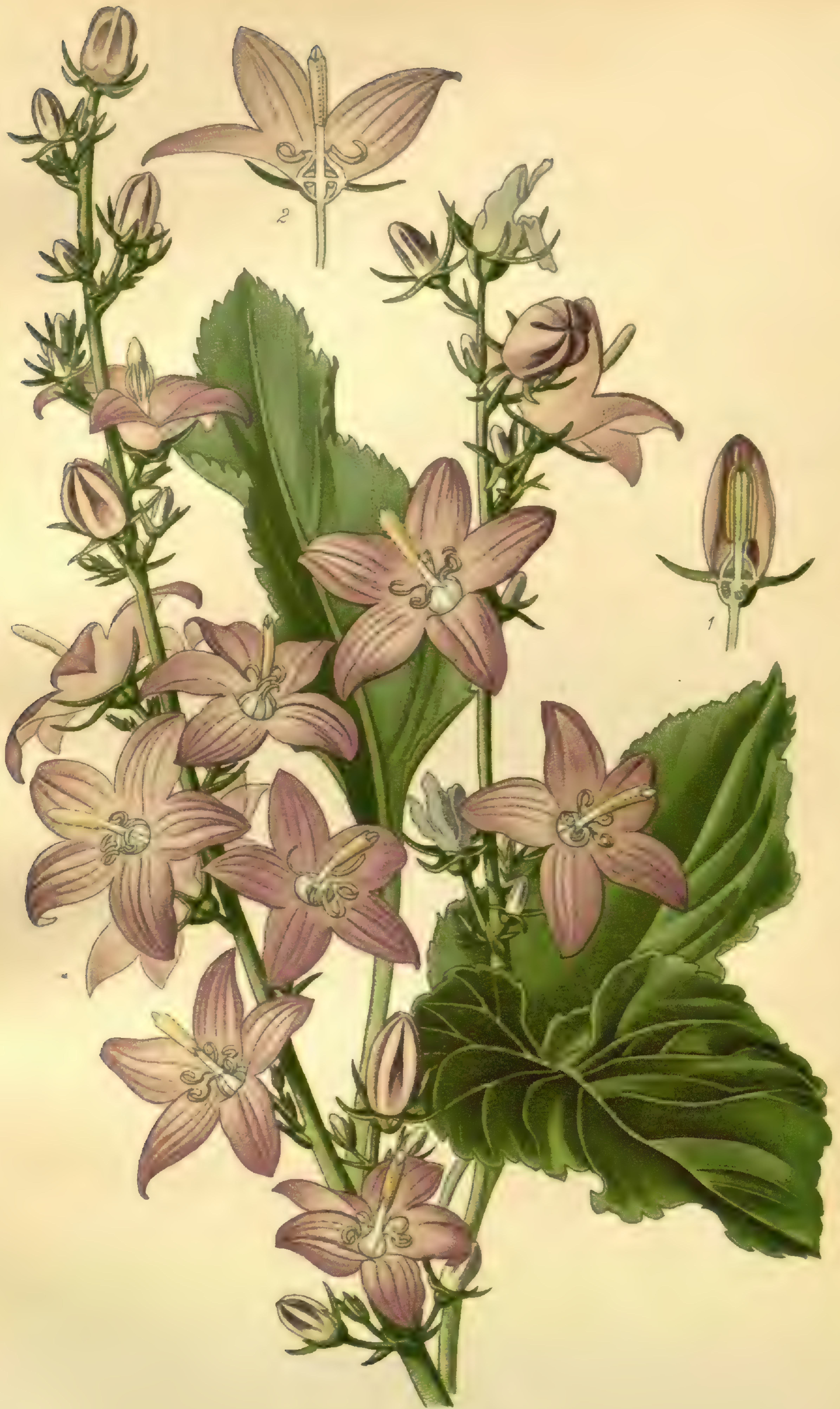
CHIMNEY BELL-FLOWER ( CAMPANULA PYRAMIDALIS )