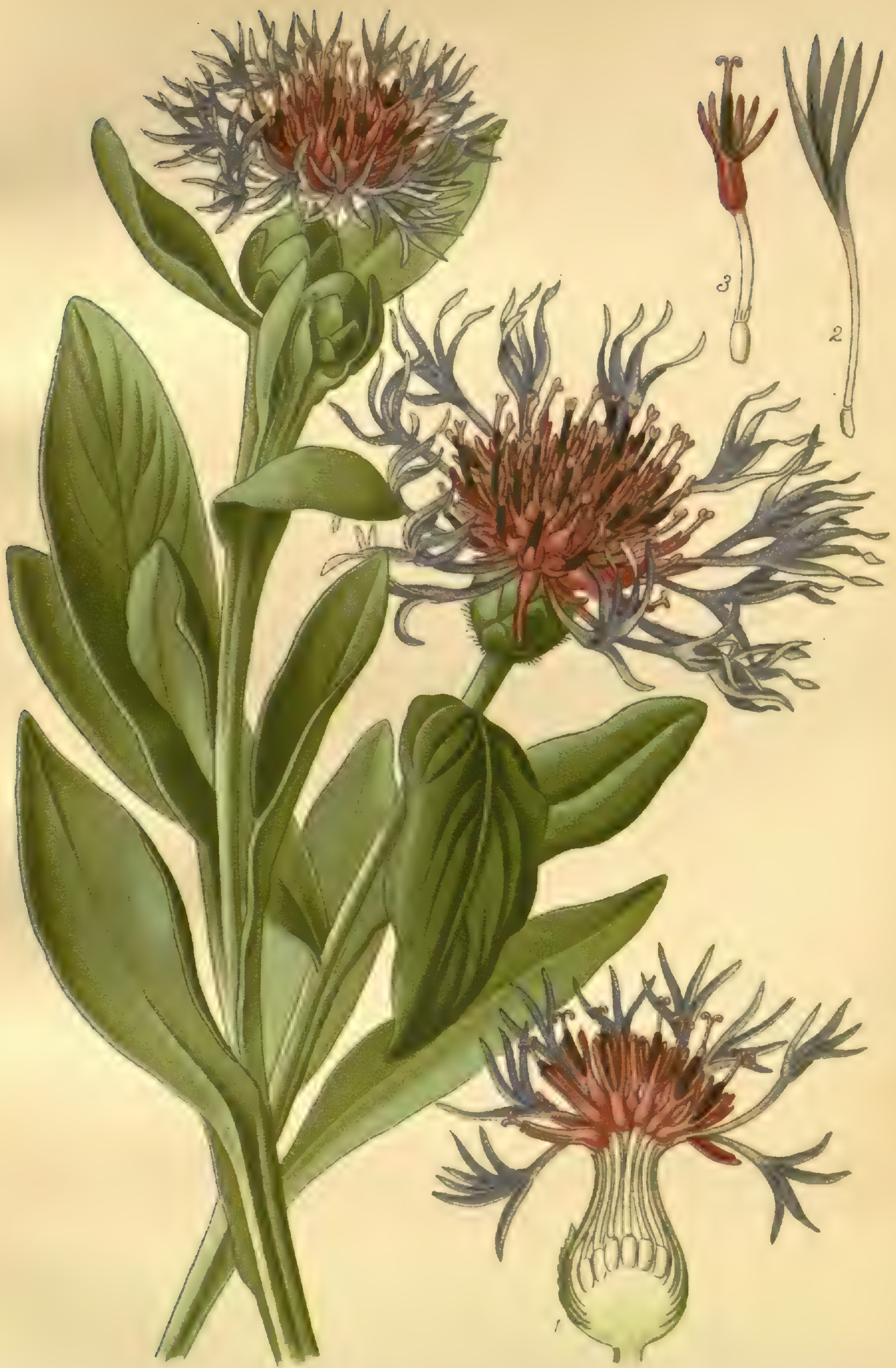
MOUNTAIN CORNFLOWER (CENTAUREA MONTANA)