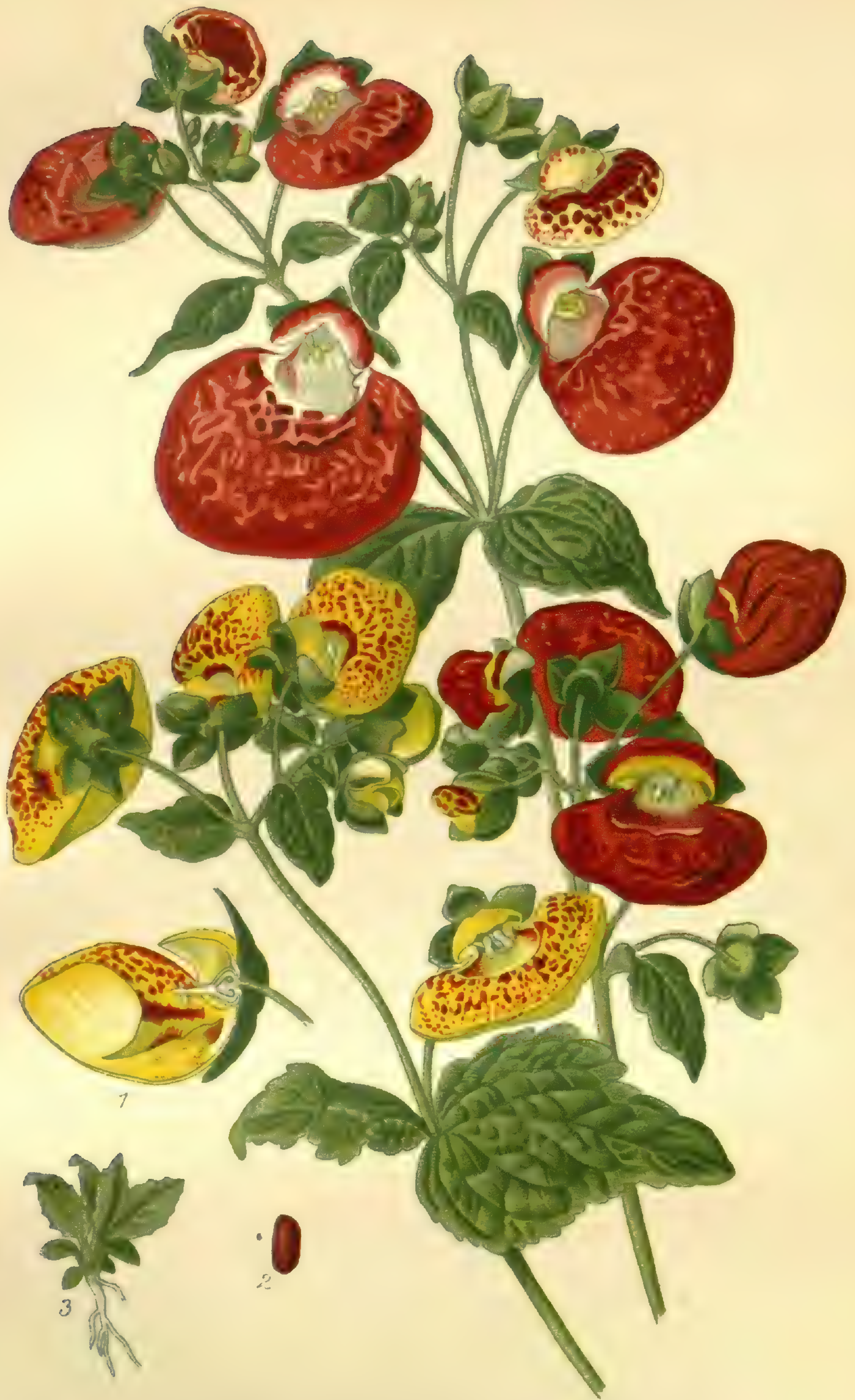
HERBACEOUS CALCEOLARIA (CALCEOLARIA HYBRIDA)