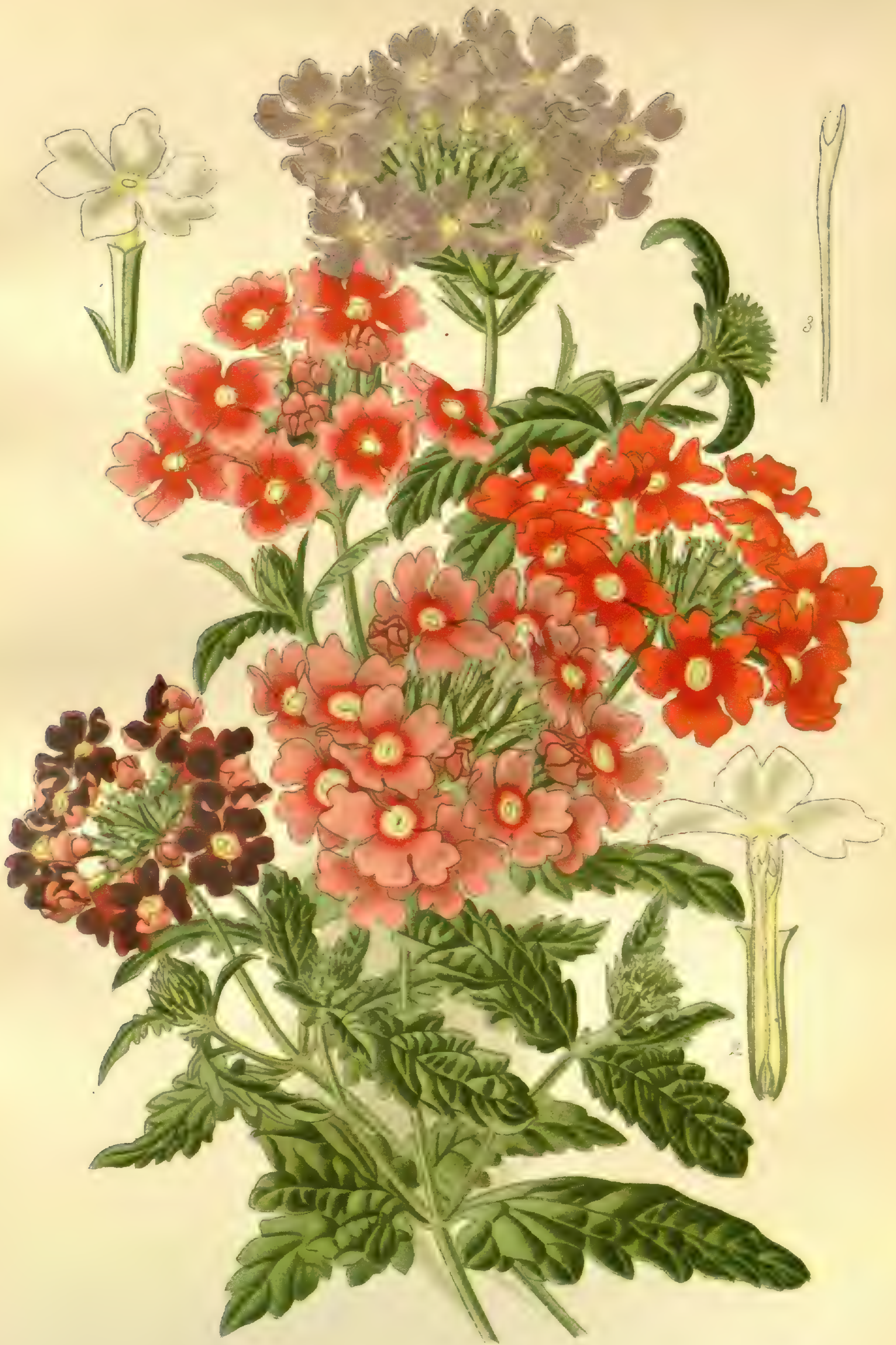
BEDDING VERBENAS ( VERBENA HYBRIDA )