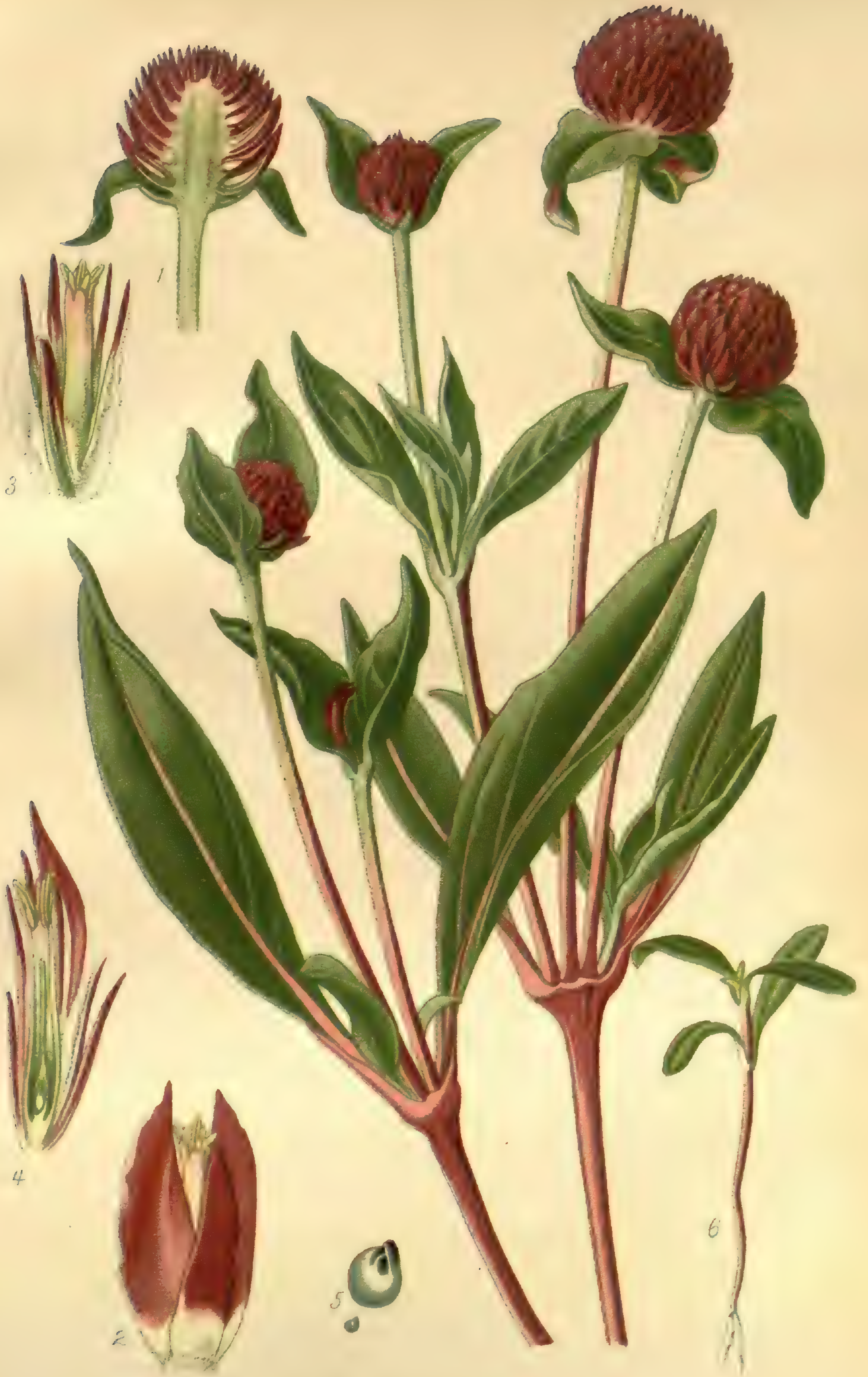
GLOBE AMARANTH (GOMPHRENA GLOBOSA)