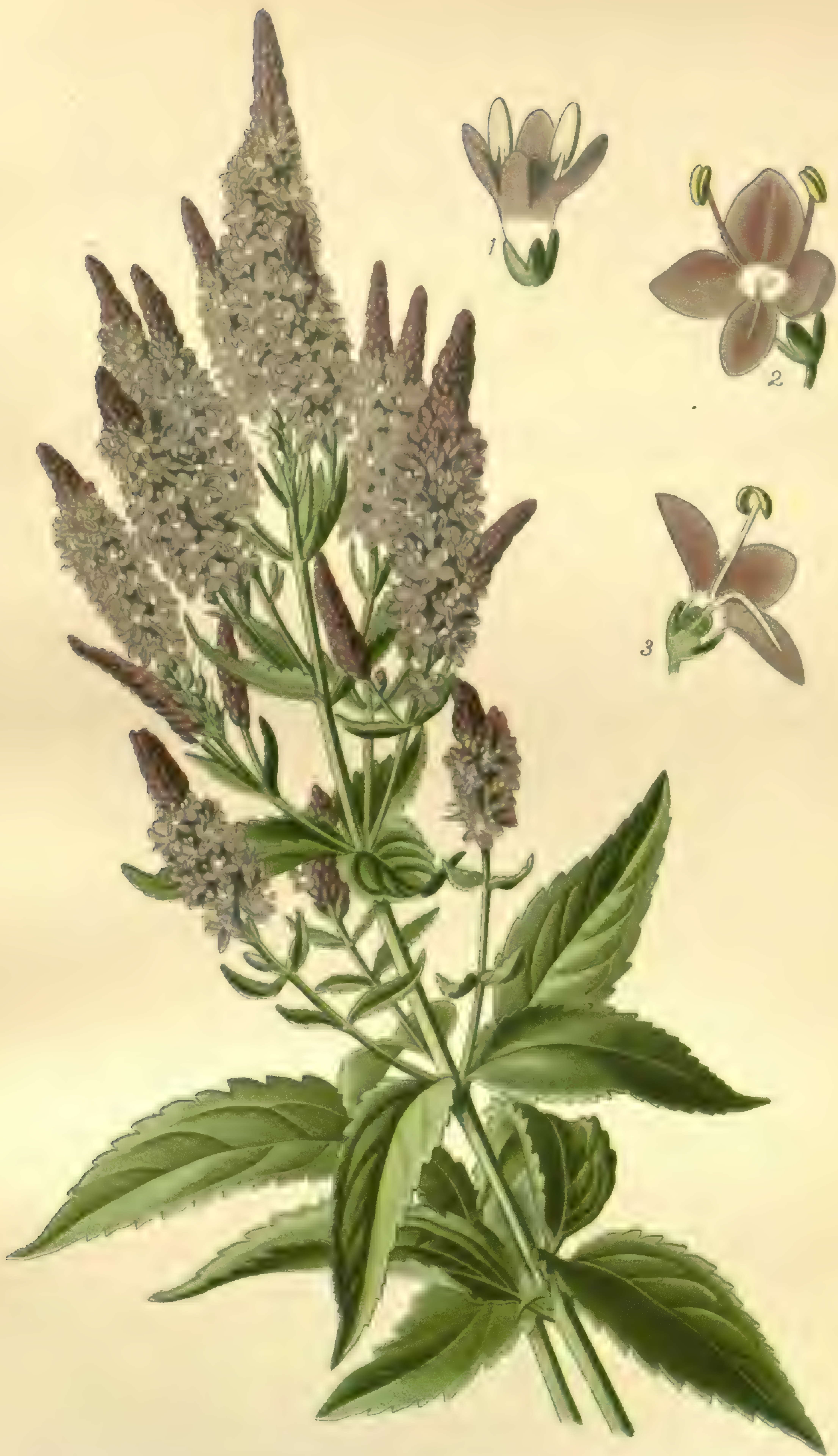
LONG-LEAVED SPEEDWELL ( VERONICA LONGIFOLIA )