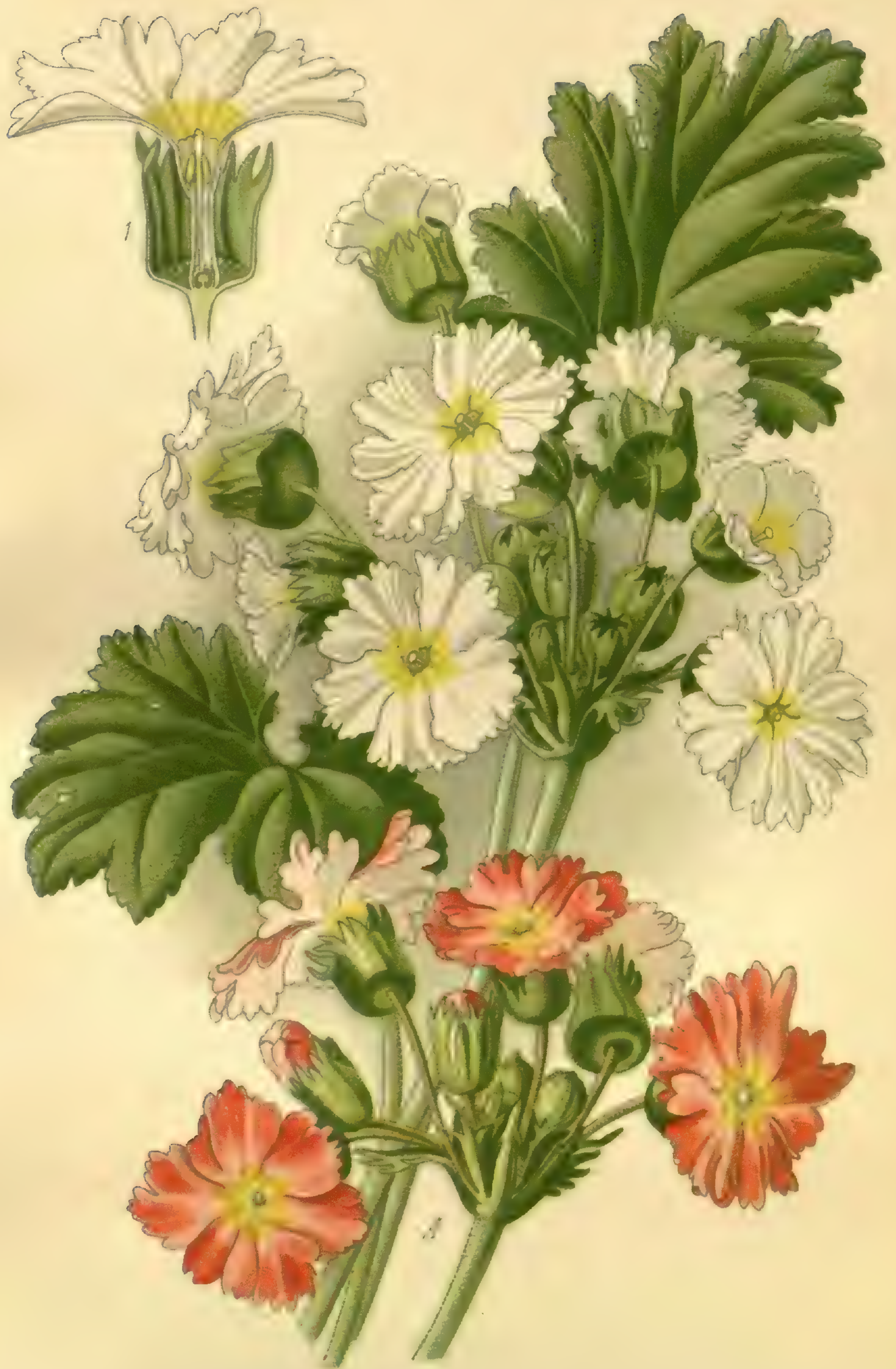
CHINESE PRIMROSE (PRIMULA SINENSIS)