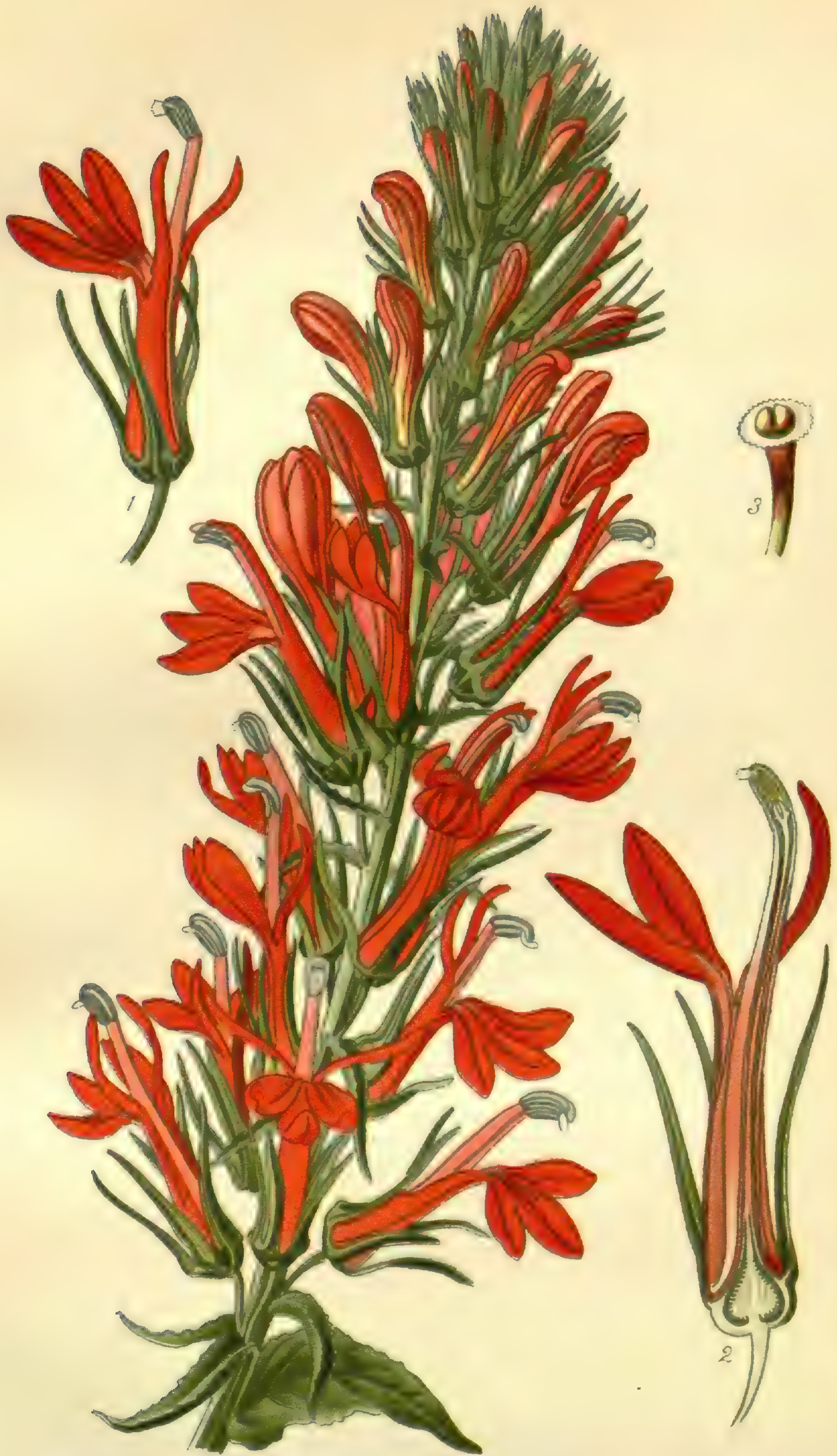
CARDINAL FLOWER (LOBELIA CARDINALIS)