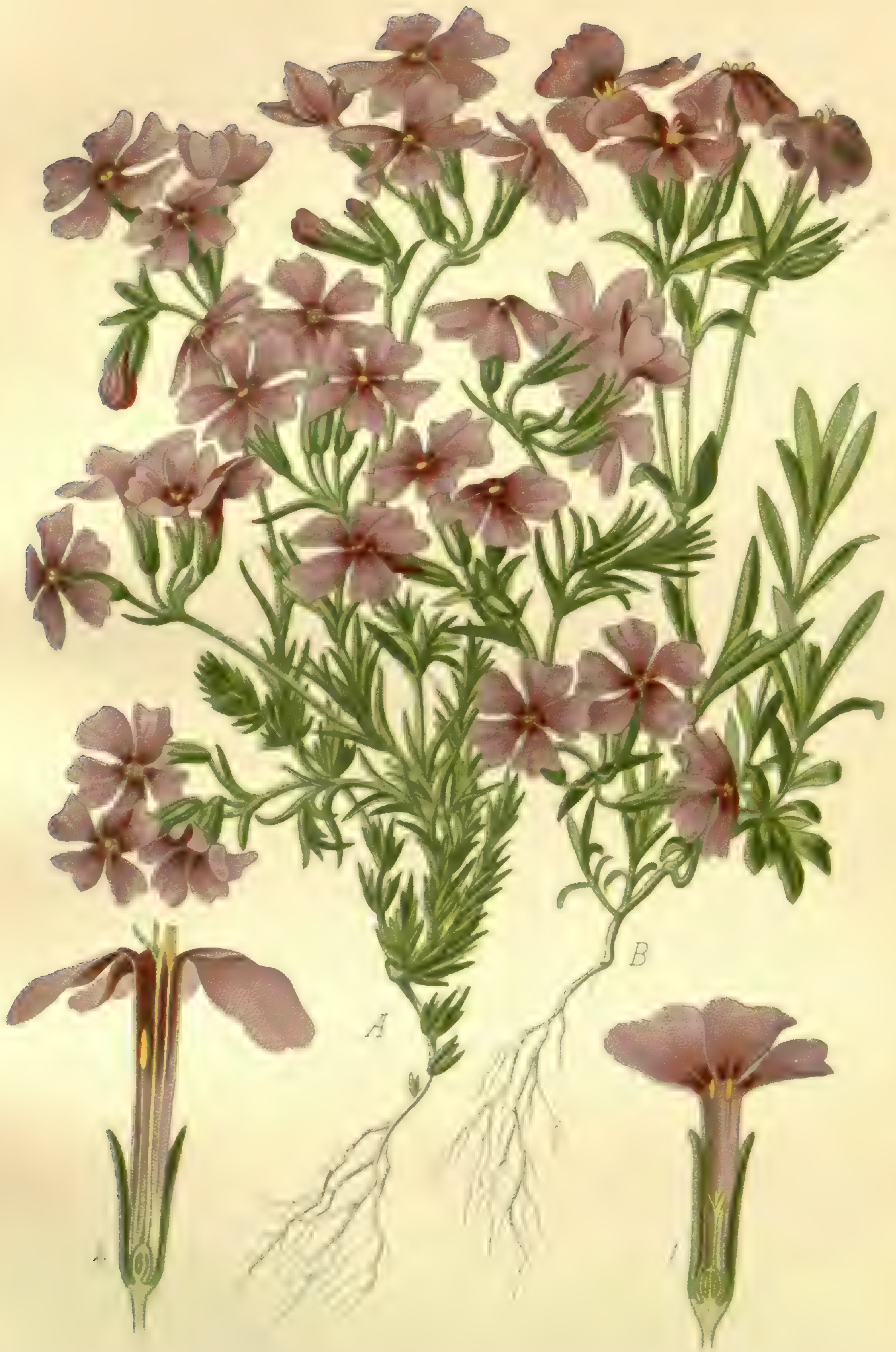
PHLOX SUBULATA and var.