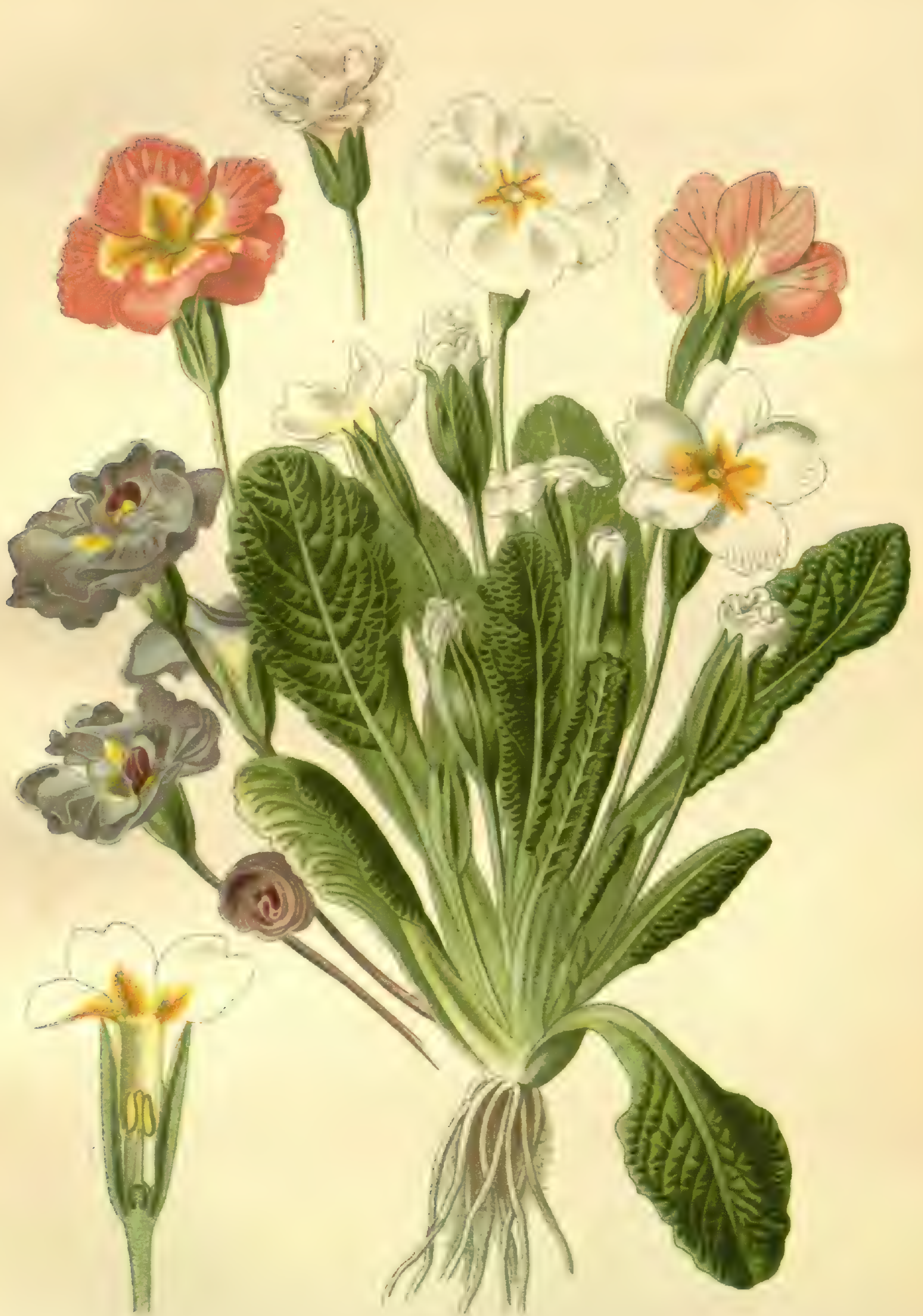
PRIMROSE ( PRIMULA VULGARIS , and vars. )