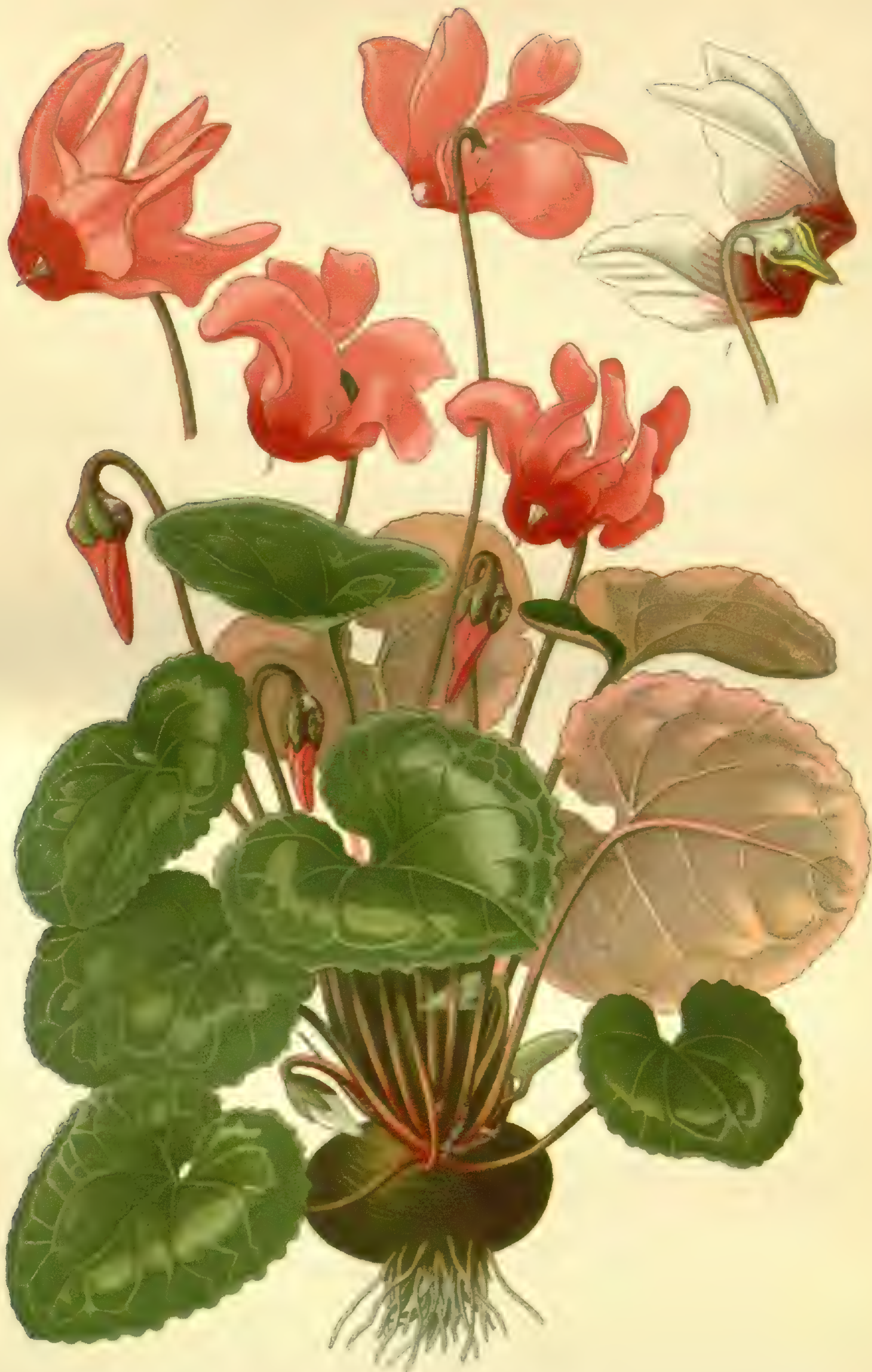
PERSIAN CYCLAMEN (CYCLAMEN PERSICUM)