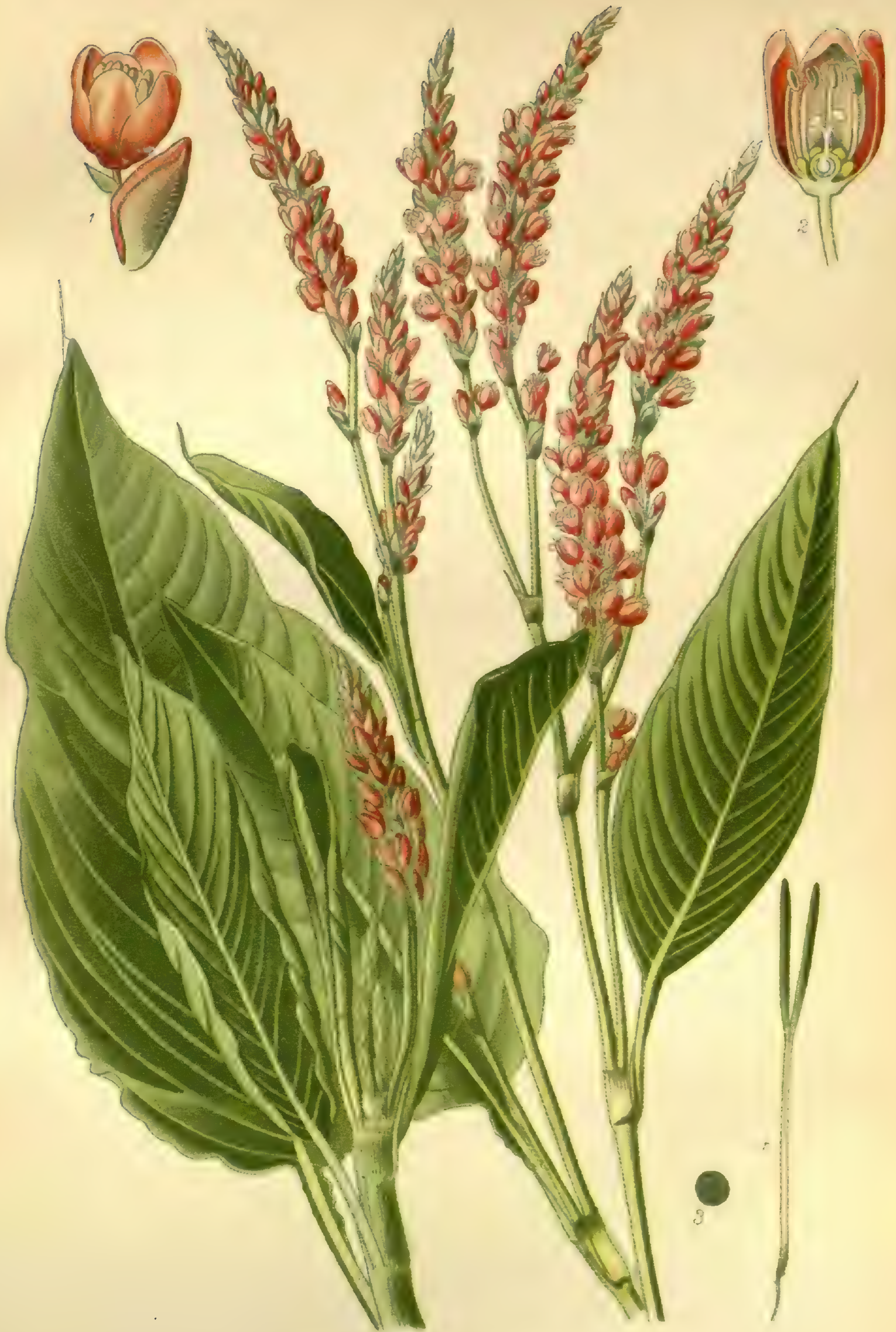
EASTERN KNOTWEED (POLYGONUM ORIENTALE)