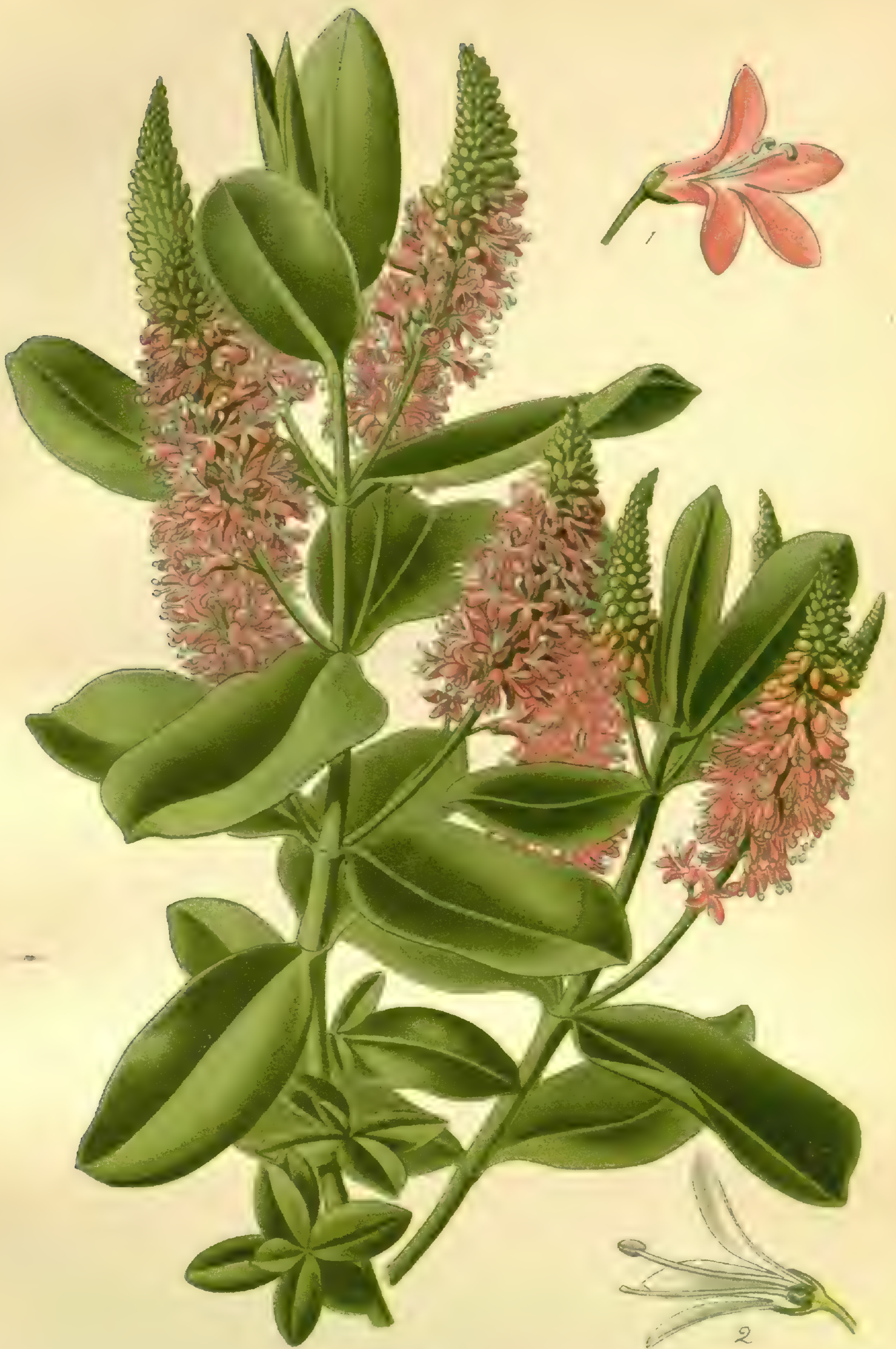
SHRUBBY SPEEDWELL ( VERONICA SPECIOSA )