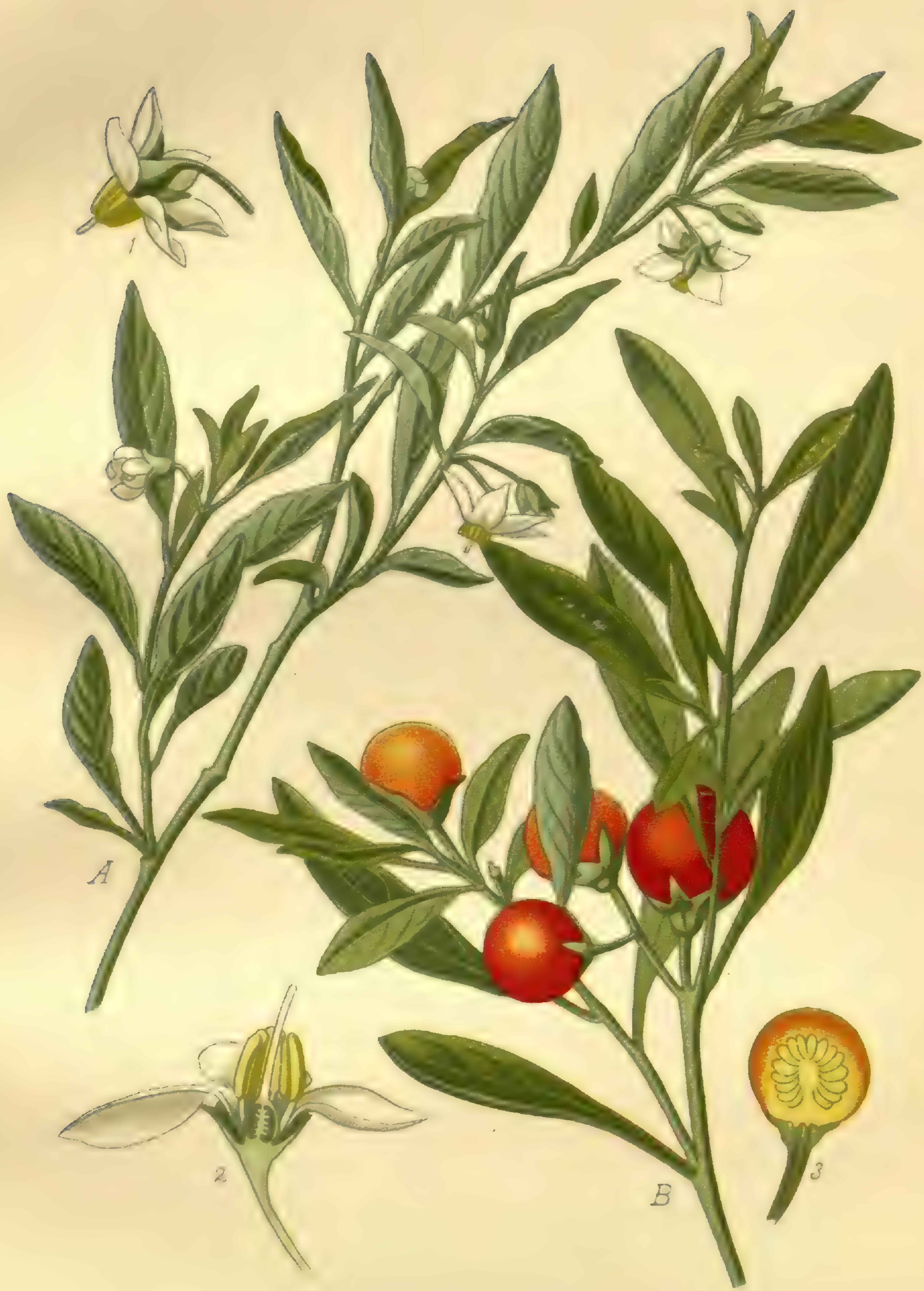
STAR CAPSICUM (SOLANUM CAPSICASTRUM)