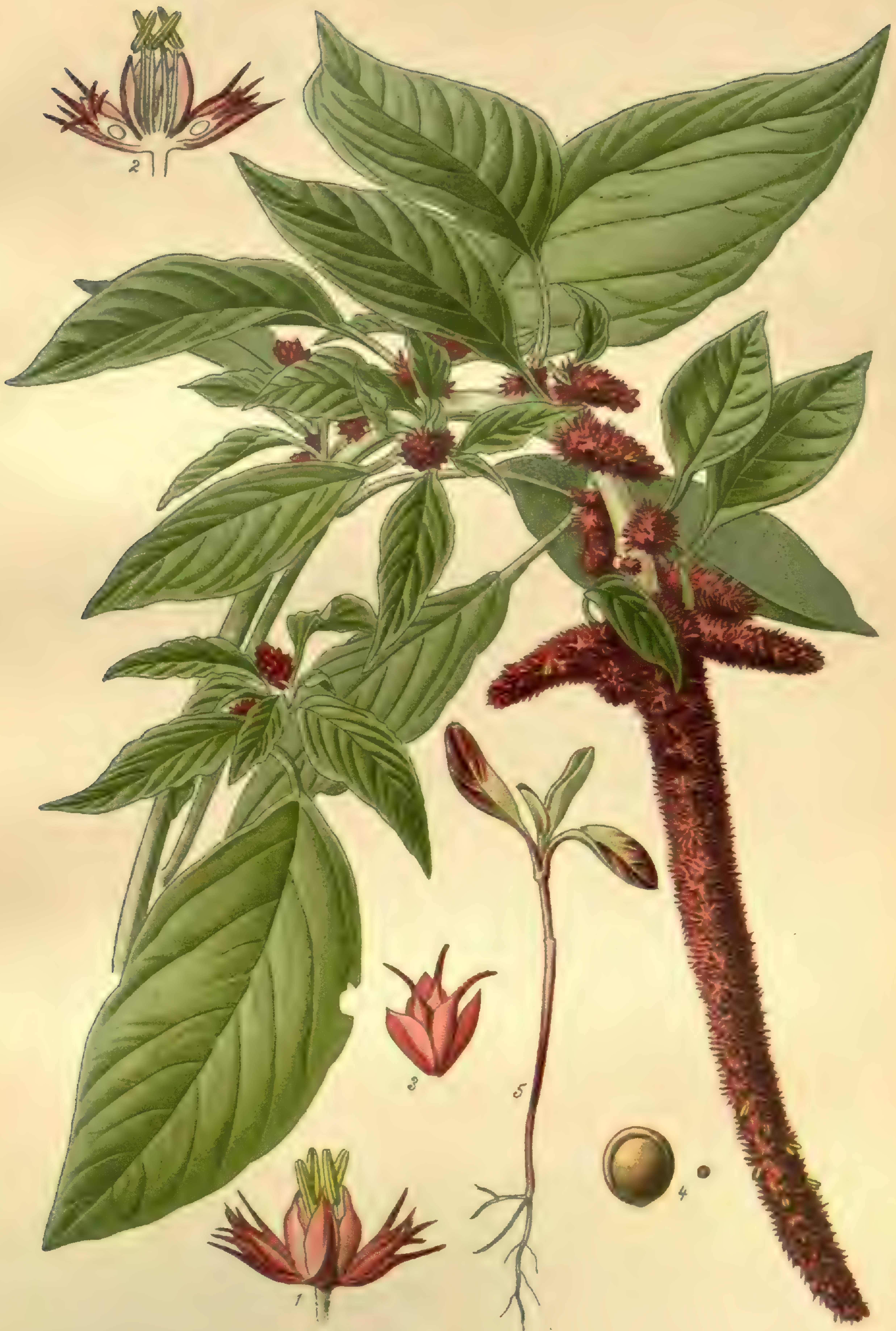
LOVE-LIES-BLEEDING (AMARANTUS CAUDATUS)