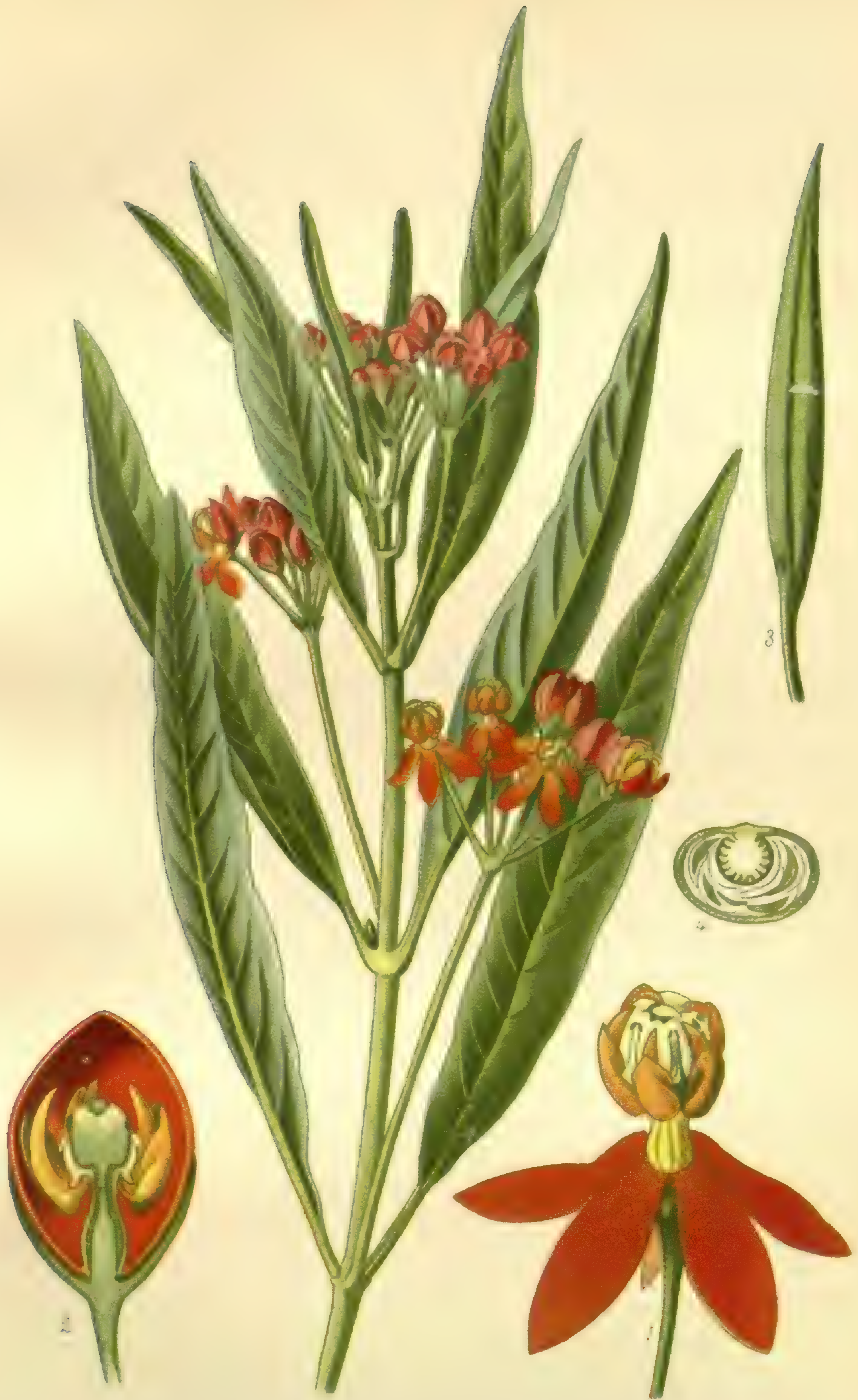
REDHEAD (ASCLEPIAS CURASSAVICA)