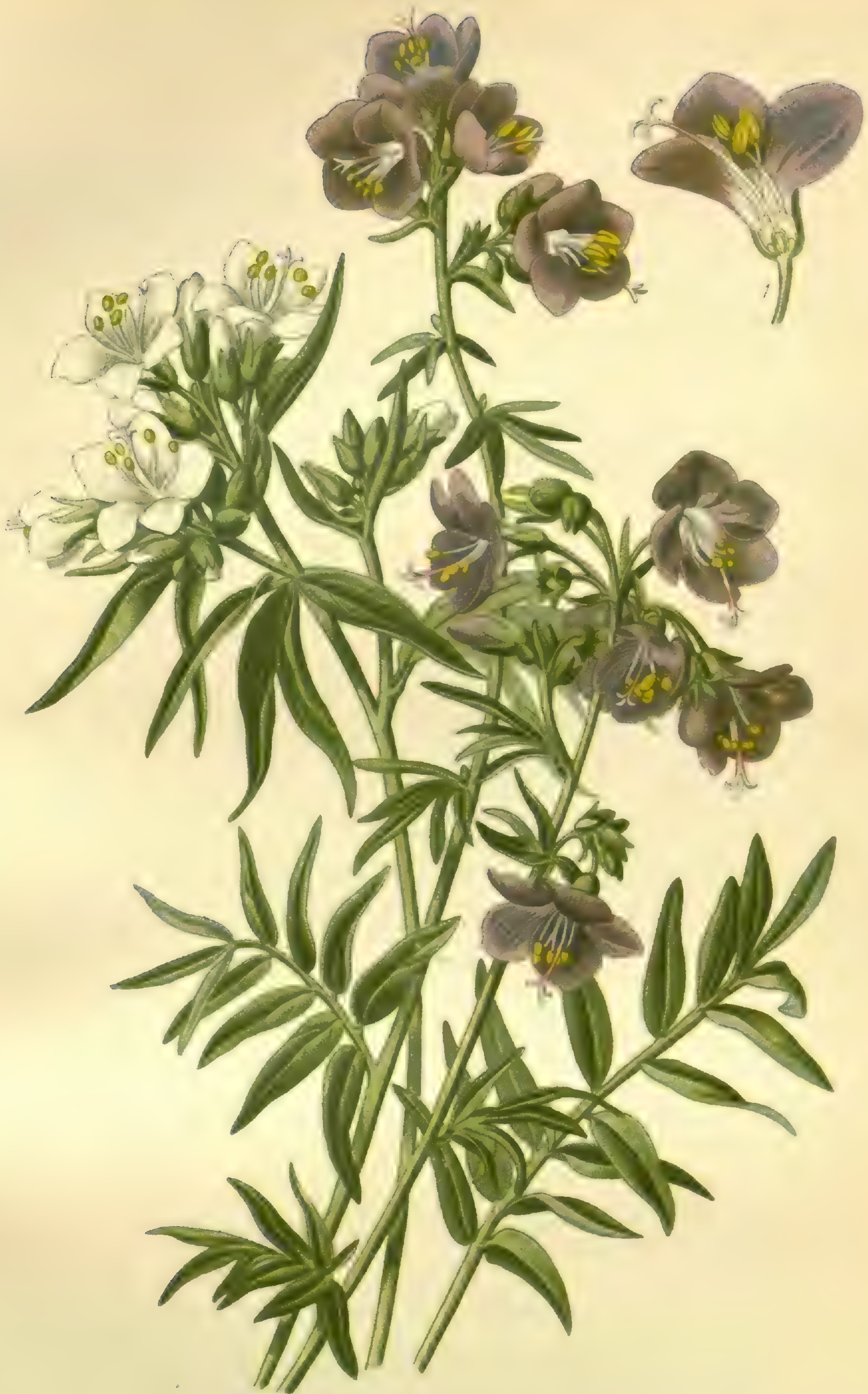
JACOB'S LADDER (POLEMONIUM CÆRULEUM)