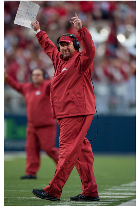
Head coach Bret Bielema has led Arkansas to three straight wins following a bye week, defeating Florida (2016), Auburn (2015) and LSU (2014).