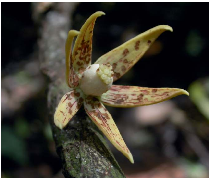
The globally Endangered Monocyclanthus vignei is a rare tree in wet evergreen forest of Liberia and Ghana and is found in Atewa Forest. It is the only member of its genus (W. Hawthorne).

Although the vegetation structure of Atewa Forest has been highly modified by logging, farming and mineral prospecting and extraction, forest vegetation remains at all altitudes. It is reasonable to assume that this list of plants, which has accumulated over many years of surveys and collecting (the oldest record in the database is from 1899), still represents the current floral richness. At least 24 of the threatened and near-threatened species have been reported during recent fieldwork (Addo-Fordjour et al. 2013; A Rocha International unpubl. data).