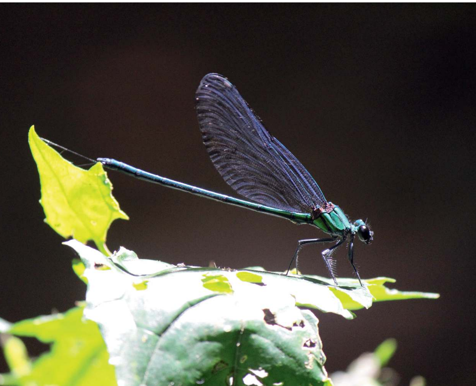
Western Bluewing Sapho ciliata (J. Lindsell)