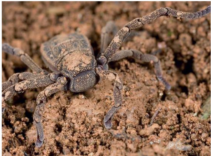
The Atewa Hooded Spider Ricinoides atewa was described from Atewa Forest in 2008.