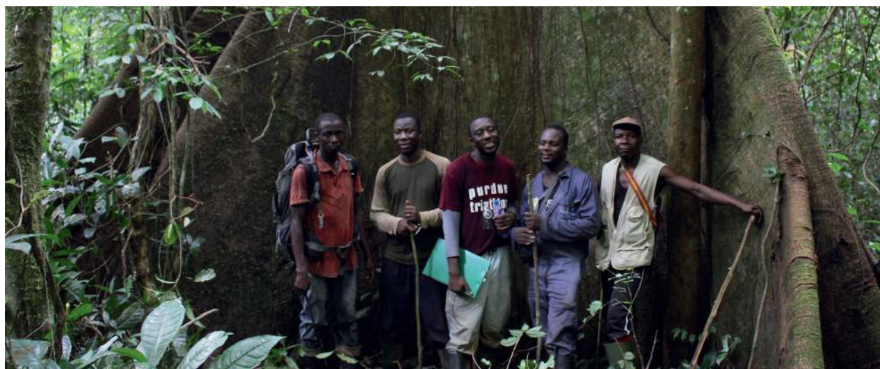
A Rocha fieldworkers assembled by a large Ceiba pentandra tree in Atewa Forest.

* this percentage refers only to vascular plants.