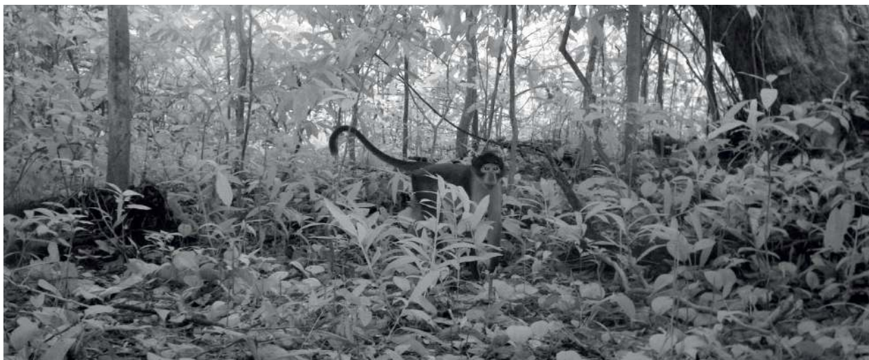
White-naped Mangabey Cercocebus lunulatus photographed in Atewa Forest on an camera trap, the first confirmed evidence of the species in the forest.

Despite this apparently negative trend, a number of very rare and more generally threatened species persist in Atewa Forest. The most remarkable recent discovery is that of the White-naped Mangabey Cercocebus lunulatus . Although there is evidence in the historical record of their occurrence in eastern Ghana there have been no modern confirmed sightings until 2017 when a small group was photographed on a camera trap in Atewa Forest. This species has been listed as Endangered by IUCN but may now meet the criteria for Critically Endangered. Until this discovery it was thought that White-naped Mangabey was confined to a number of forests in the far west of Ghana and across the border in