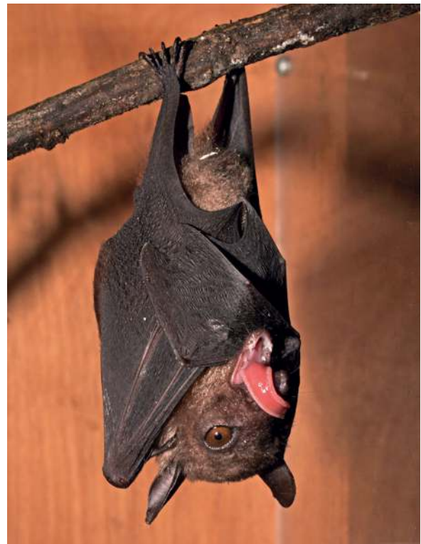
Left, images from camera traps in Atewa Forest of (upper) the heavily-hunted White-bellied Pangolin Phataginus tricuspis (VU) and (lower) a pair of Slender-tailed Squirrels Protoxerus aubinnii (DD), a poorly known species newly recorded for the site. Above, Western Woermann's Fruit Bat Megaloglossus azagnyi.