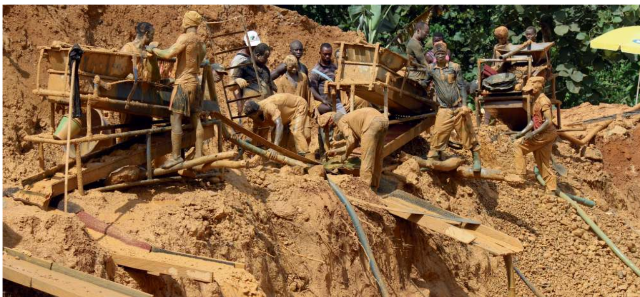
Small-scale gold mining (galamsey) has been prevalent around Atewa Forest in recent years.