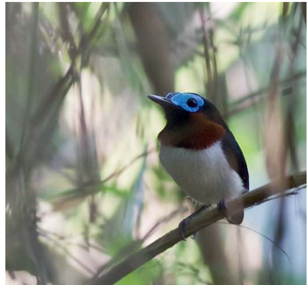
White-spotted Flufftail Sarothrura pulchra (left) and Red-cheeked Wattle-eye Dyaphorophyia blissetti (photographed elsewhere) are both recorded in Atewa Forest (D. Monticelli).