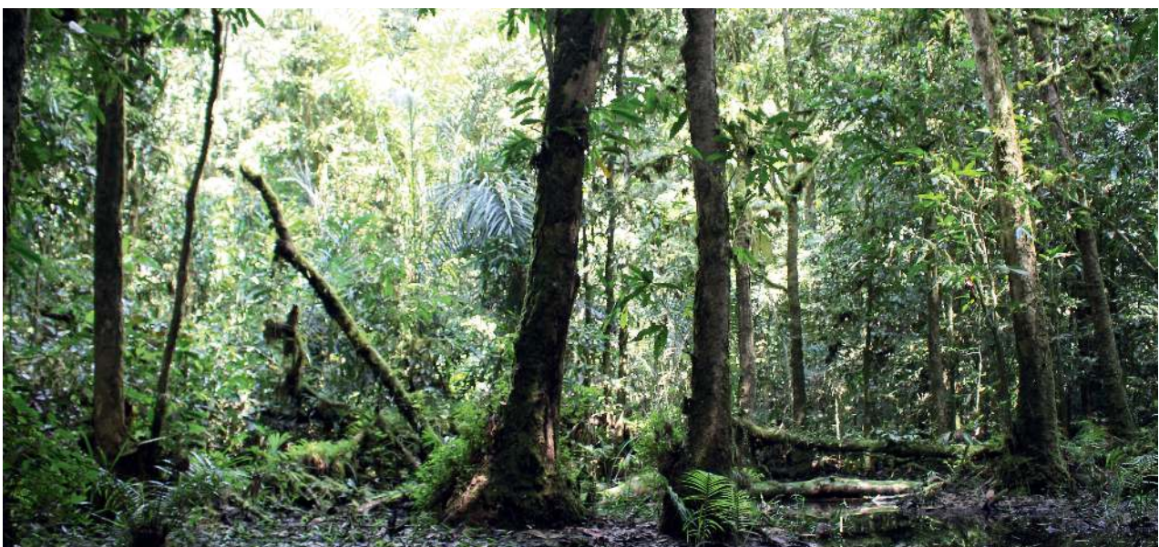
Swampy forest on the plateau of the Atewa range