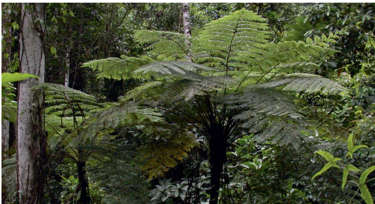
The tree fern Cyathea manniana is one of Atewa Forest's most noteworthy plants (W. Hawthorne)

Throughout this report we make frequent use of IUCN's Red List threat categories (Table 1).