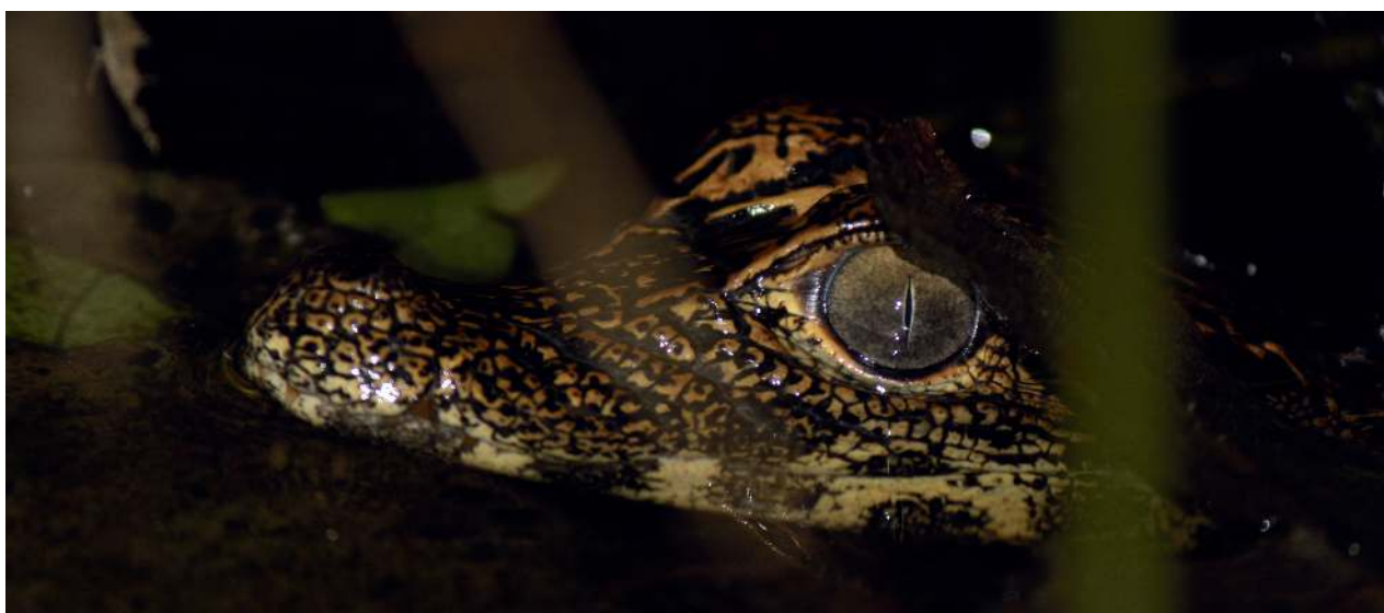
West African Dwarf Crocodile Osteolaemus tetraspis photographed in Atewa Forest in November 2017 occupies forested swamps on the summit of the plateau. (J. Lindsell).

Nonetheless, it is notable that the West African Dwarf Crocodile Osteolaemus tetraspis , which is a globally threatened species (VU), can still be found in the swamps on the Atewa range plateau.