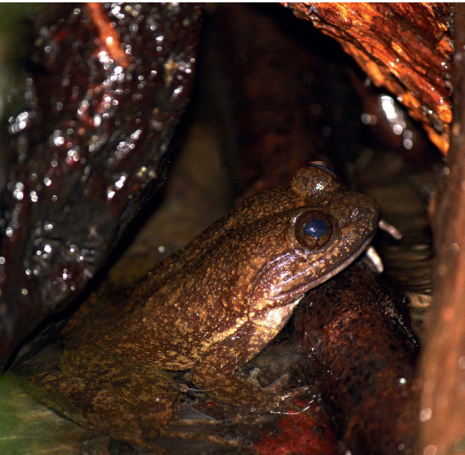
The [Togo] Slippery Frog Conraua derooi in Atewa Forest, is now known to be a distinct species from the population in western Togo making it entirely restricted to Atewa Forest.