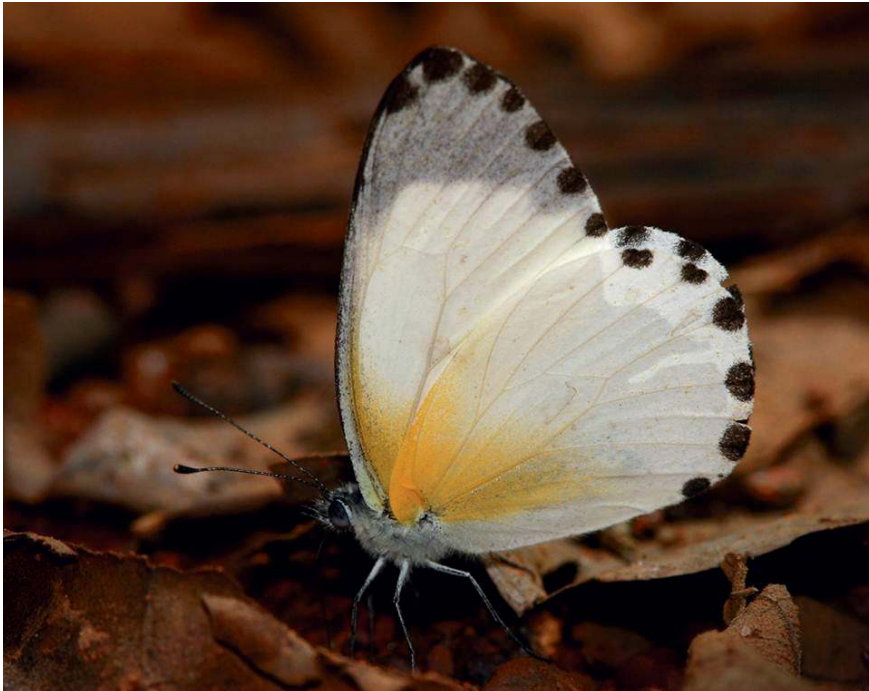
Atewa Dotted Border Mylothris atewa is restricted to Atewa Forest and classified as Vulnerable to extinction.

VU. The swallowtail and Caroline’s Sapphire Iolus carolinae are listed as Data Deficient, reflecting the challenge with assessing this group.