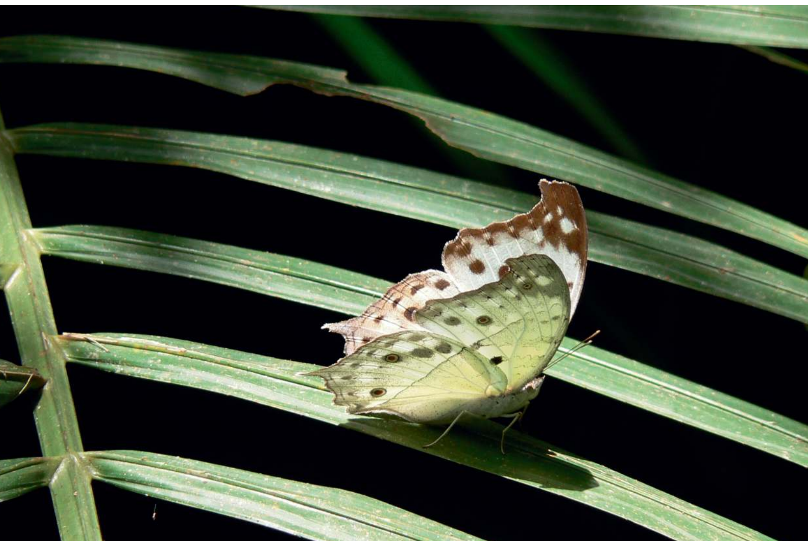
The Forest Mother-of-Pearl Protogoniomorpha parhassus is an impressive large forest butterfly widespread in the Afrotropics and one of over 700 species thought to occur in Atewa Forest (J. Lindsell).