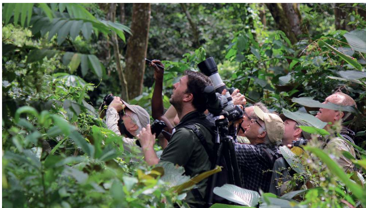
An eco-tourist group being shown a West African Batis occulta in Atewa Forest (J. Lindsell).

The globally threatened White-necked Picathartes Picathartes gymnocephalus was reported to occur in Atewa Forest (Dowsett-Lemaire & Dowsett, 2005) but recent efforts have failed to locate it. The picathartes nests in rocky