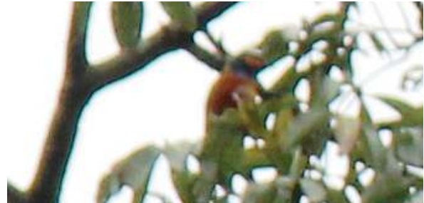
The Western Wattled Cuckooshrike Lobotos lobatus is a very rarely photographed species. This image (in which one is just about distinguishable) was the first record for Atewa Forest (J. Lindsay).