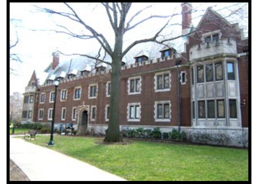
Mather House, the building the History Department shares with Art History, Classics, Political Science, and Religion