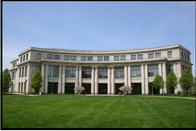
Kelvin Smith Library—Home away from Home for many History students