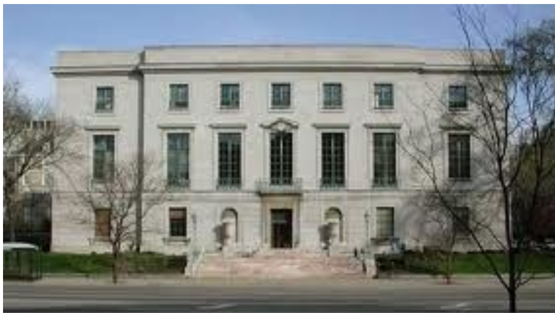
Allen Memorial Medical Library