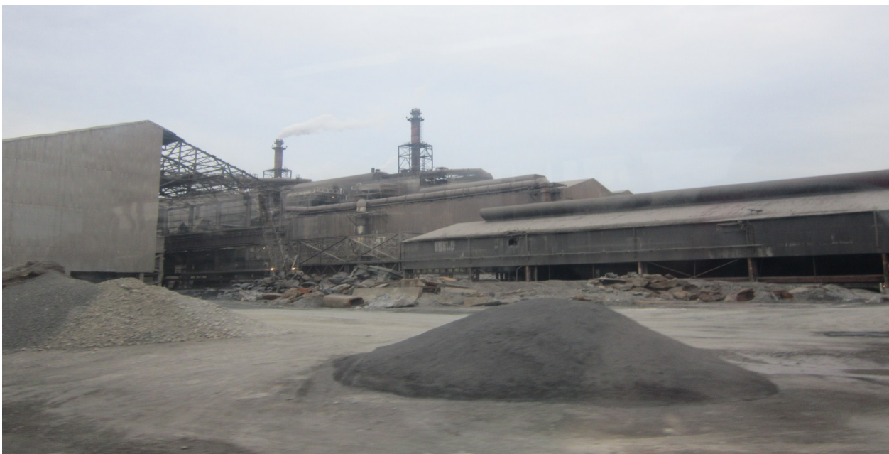
ArcelorMittal Steel plant in Cleveland