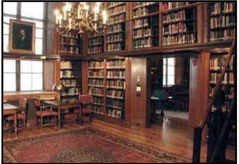
The Lowman Room of the Allen Memorial Medical Library