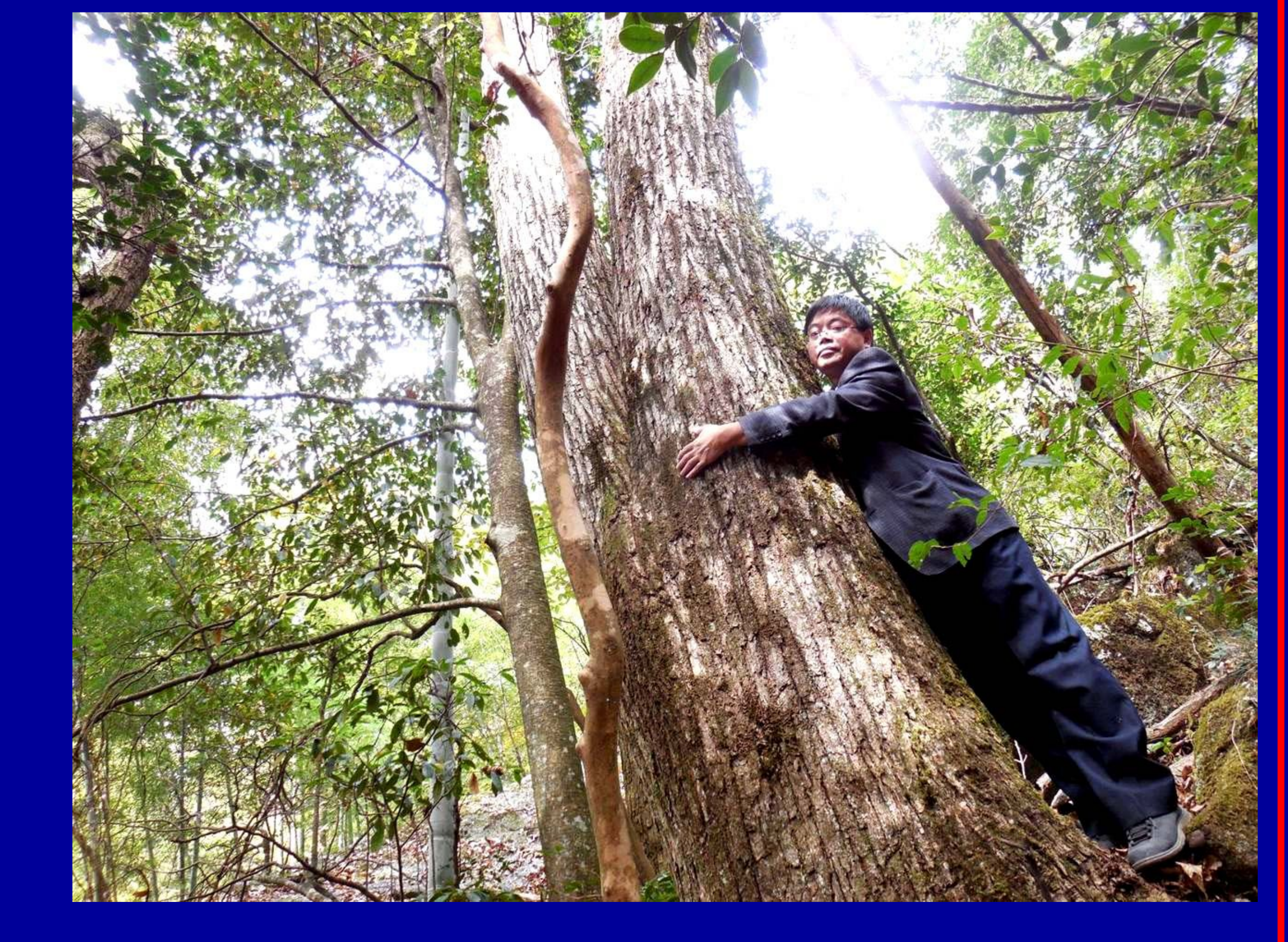
Investigation and collection of Castanea henryi germplasms