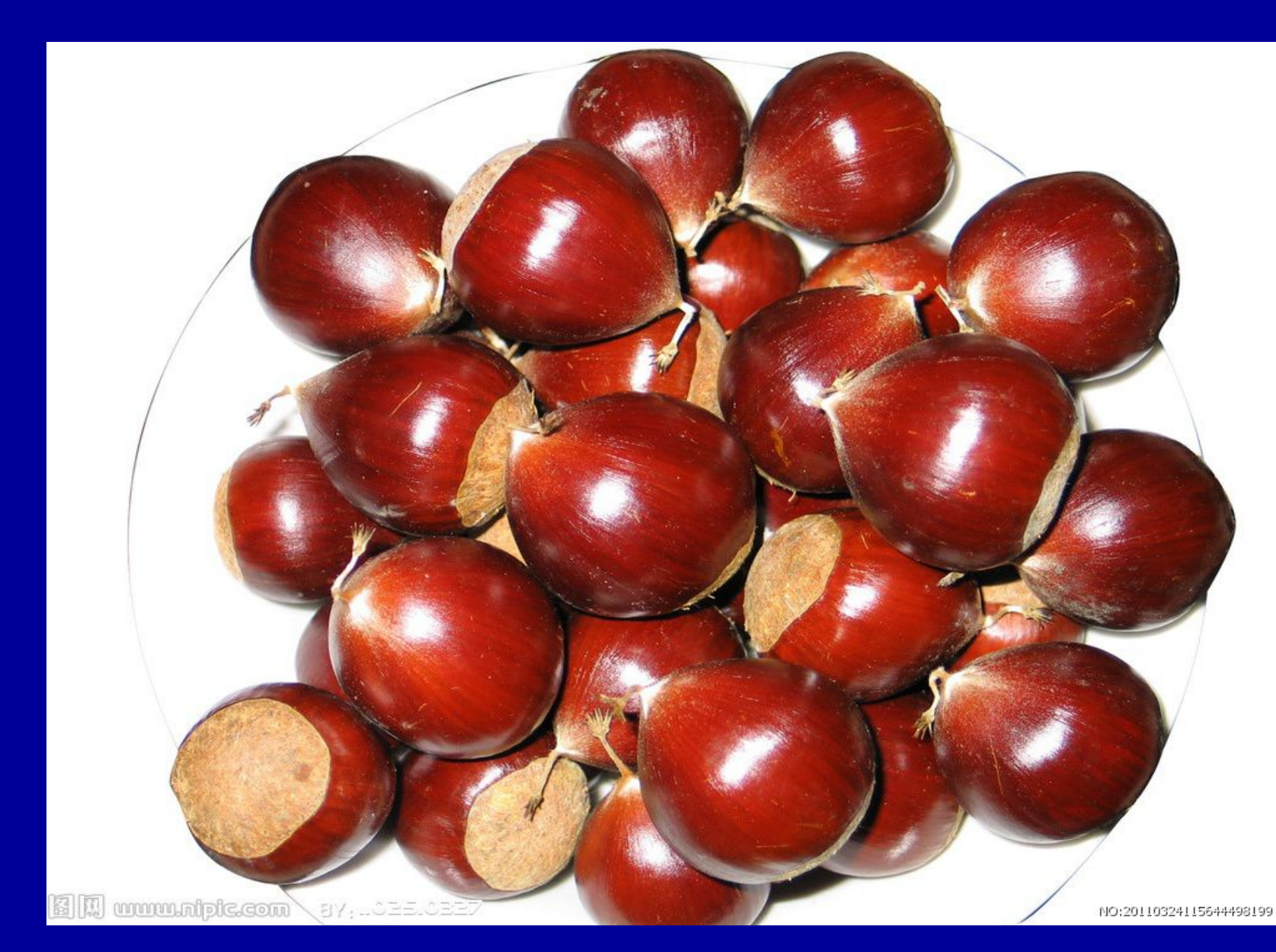
Evaluation and selecting of Castanea henryi germplasms