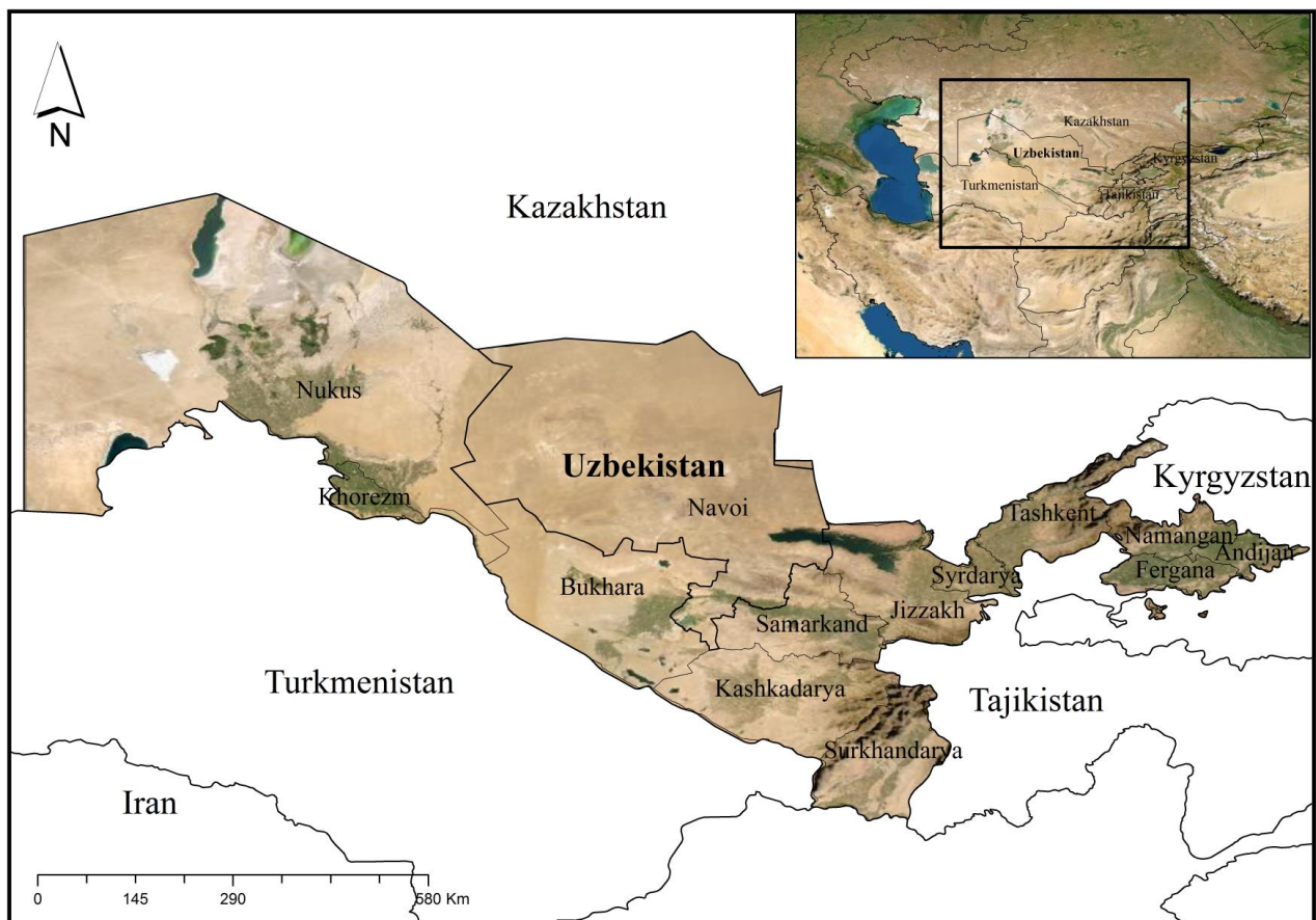
Fig. 1 – Study area. Regional division of Uzbekistan.