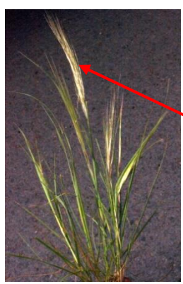
Mediterranean needle grass Stipa capensis Grass family (Poaceae)

Bristles Pointing upward Beginning to bend outward