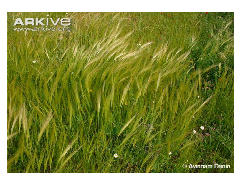
Fig. 3 Dense stand of needle grass