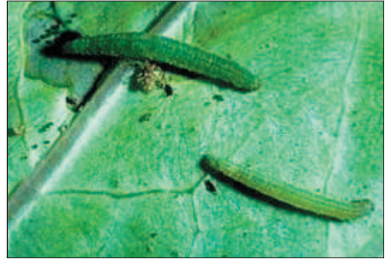
Diamondback moth larva. Department of Entomology, Texas A&M University.