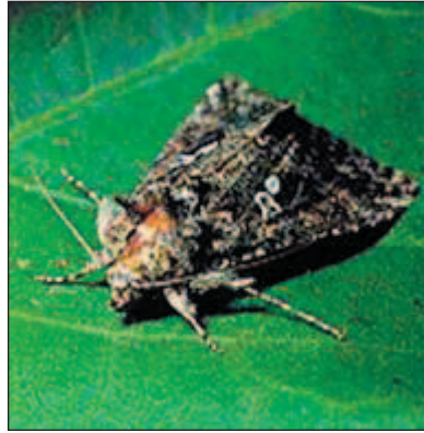
Cabbage looper moth.