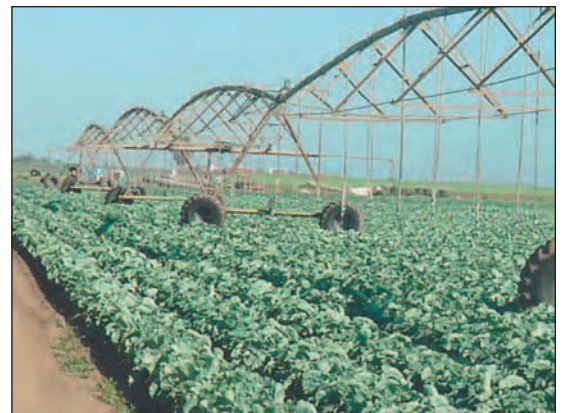
Linear or lateral move irrigation system in broccoli.

Soil texture, environmental conditions, and crop age are factors to consider when irrigating any crop. Cole crops are generally shallow-rooted, with roots ranging from 18 to 24 inches long. Some exceptions to this are mustard, rutabaga, and turnips, whose roots range from 36 to 48 inches. (Doneen and MacGillivray, 1943) Chinese cabbage and pak choi have shallow root systems that respond well to light, frequent irrigations. (Larkcom, 1991) Essentially, the art of irrigation is applying the right amount of