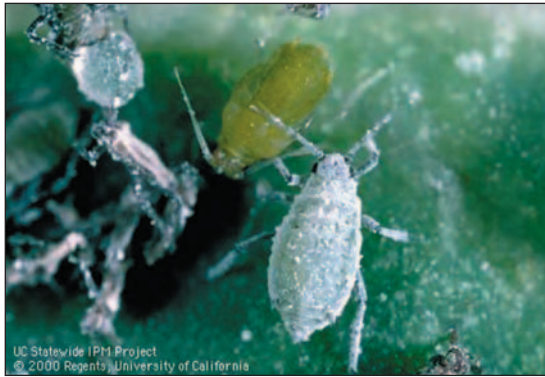
Cabbage aphid.

The cabbage aphid, Brevicoryne brassicae , is a major pest of cole crops worldwide. It is small (1/8 inch long), dark green, and exudes