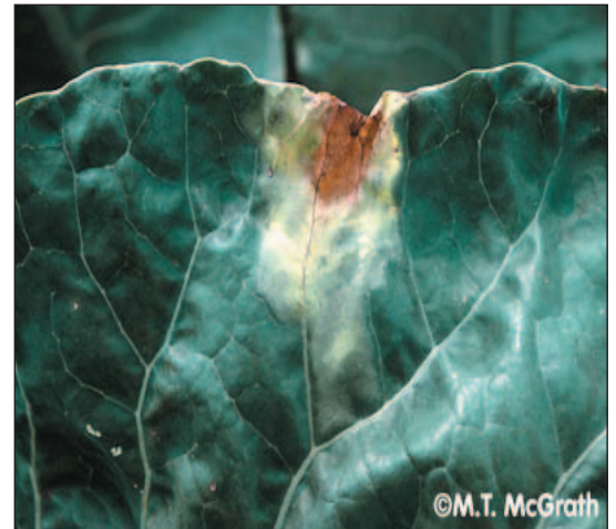
Black rot.

Black rot is caused by the bacterium Xanthomonas campestris . This bacterium favors humid, rainy conditions, and is dispersed by the splashing of droplets of water. Xanthomonas enters the plant at leaf margins or through wounds. Leaf margins develop yellowish patches that turn brown with black veins. The infection works its way down the leaves, leaving a “V” pattern in its wake. The