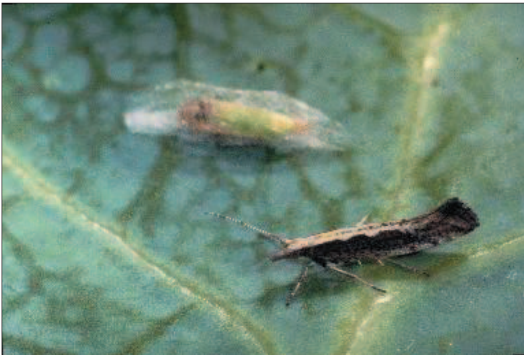
Diamondback pupae and adult.