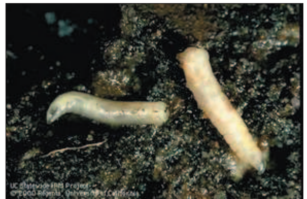
Cabbage maggot.

Floating row covers will prevent cabbage flies from depositing eggs during the critical period after plant emergence or