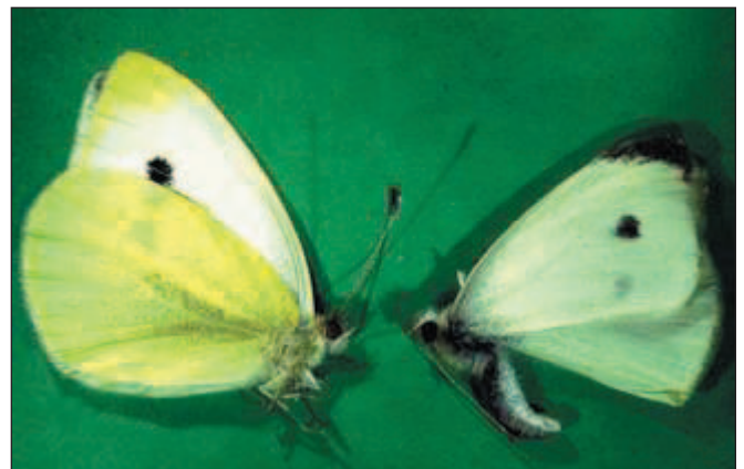
Imported cabbageworm moths.