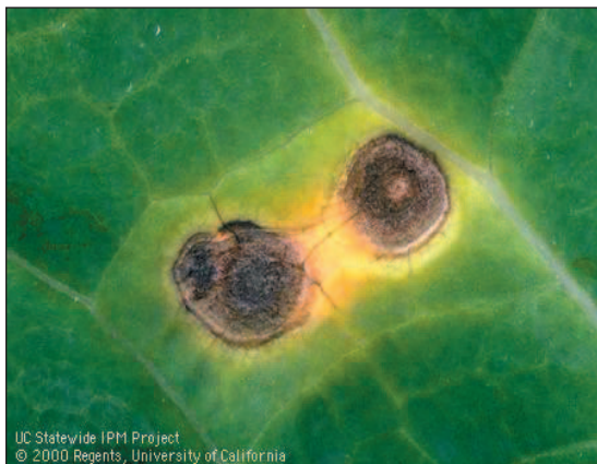
Alternaria leaf spot.

This disease is caused by the fungi Alternaria brassicae and/or A. brassicola . Small dark spots initially form on leaves, but later develop into tan spots with target-like concentric rings. When dried, these spots fall from the leaves, resulting in a “shot-hole” effect. Prolonged periods of high humidity, cool temperature, and rain favor its development. Infected cabbage heads will have