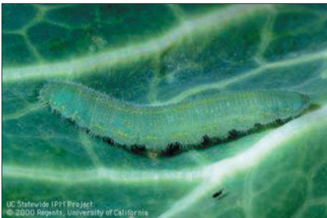
Imported cabbageworm.