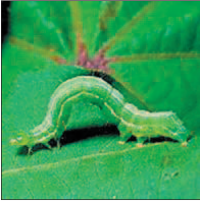
Cabbage looper.