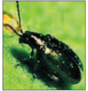
Flea beetle.

The following information is summarized from the ATTRA publication Flea Beetle: Organic Control Options . For more detailed information on flea beetle, request the publication by calling ATTRA or download it at: http://attra.ncat.org/attra-pub/PDF/fleabeetle.pdf .