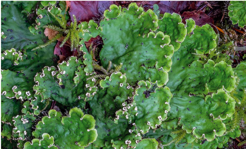
Fig. 3: Peltigera leucophlebia.