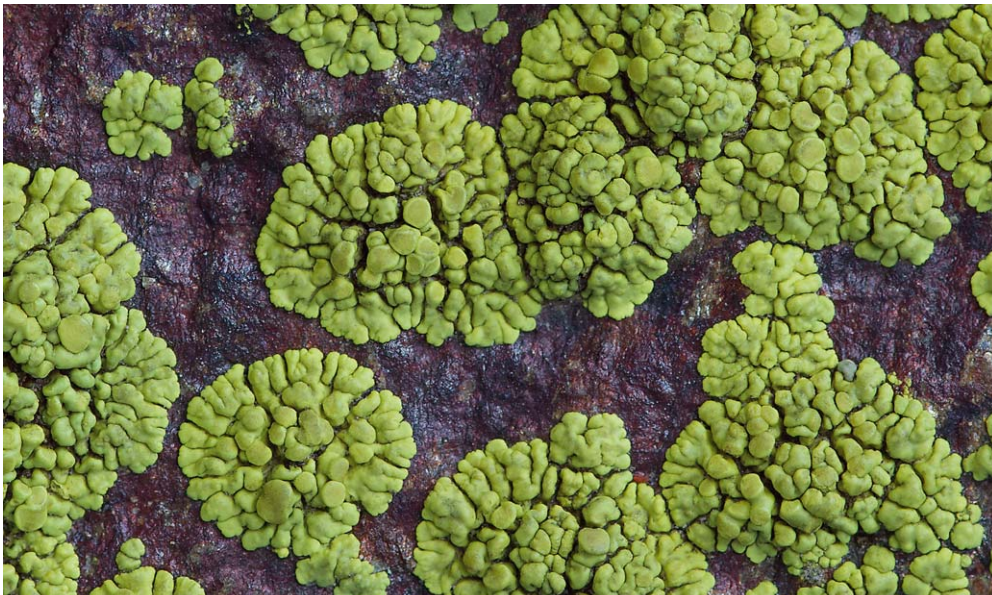
Fig. 4: Pleopsidium chlorophanum.

Syn.: Acarospora chlorophana (WAHLENB.) A. MASSAL., Gussonea chlorophana (WAHLENB.) TORNAB., Parmelia chlorophana WAHLENB., Pleopsidium flavum (BELLARDI) KÖRB. var. chlorophanum (WAHLENB.) KÖRB.