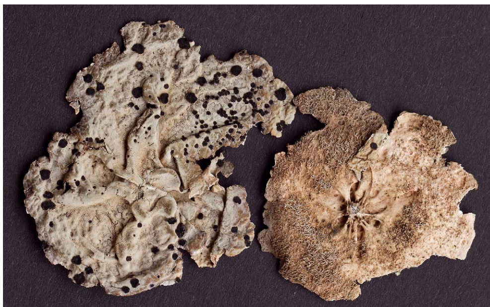
Fig. 5: Umbilicaria virginis.

Note: an arctic-alpine, probably circumpolar lichen, found on wind-exposed siliceous cliffs, often in small niches and under overhangs; apparently \pm limited to the nival belt in the Alps.