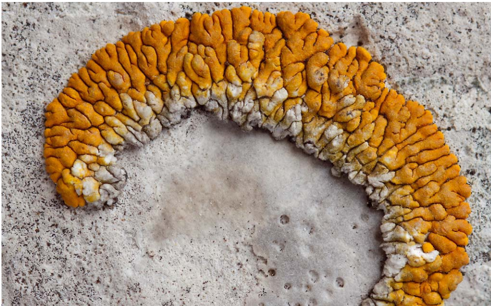
Fig. 2: Caloplaca anularis.

Note: a species of the Eurasiatic mountains from the temperate zone southwards, found on steeply inclined, compact limestone and dolomite, perhaps more frequent but undercollected in the Alps because of its preference for sites difficult to access.