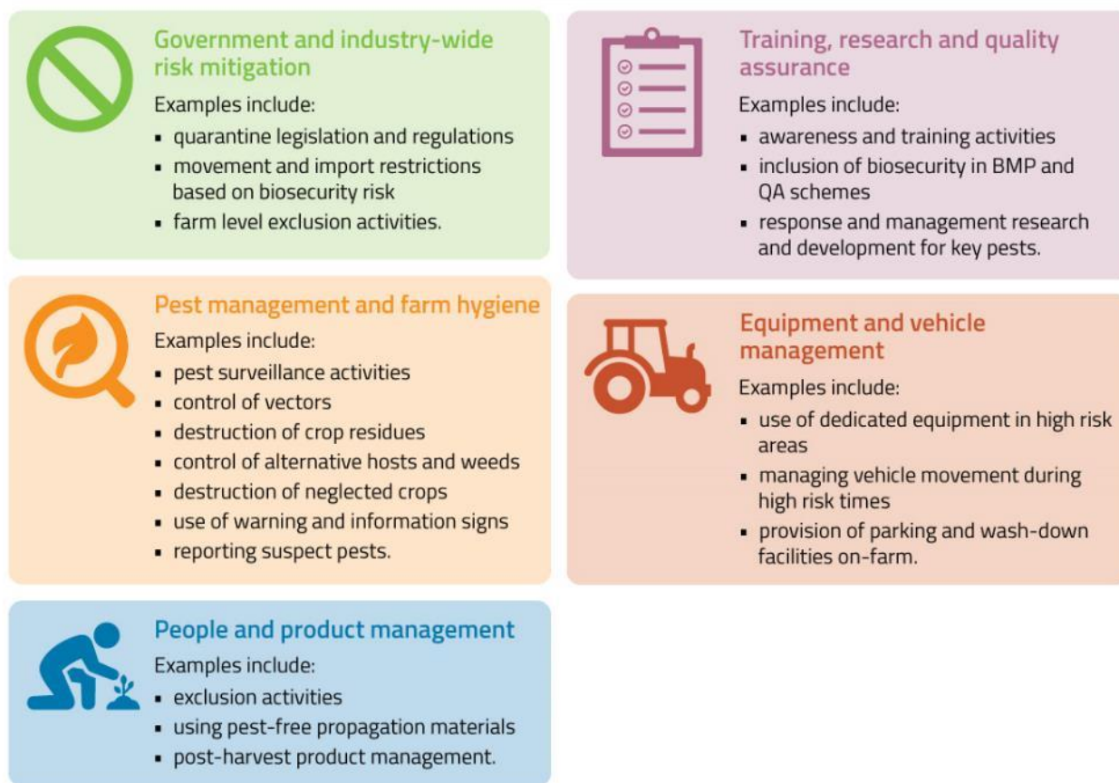
Figure 2. Examples of biosecurity risk mitigation activities.