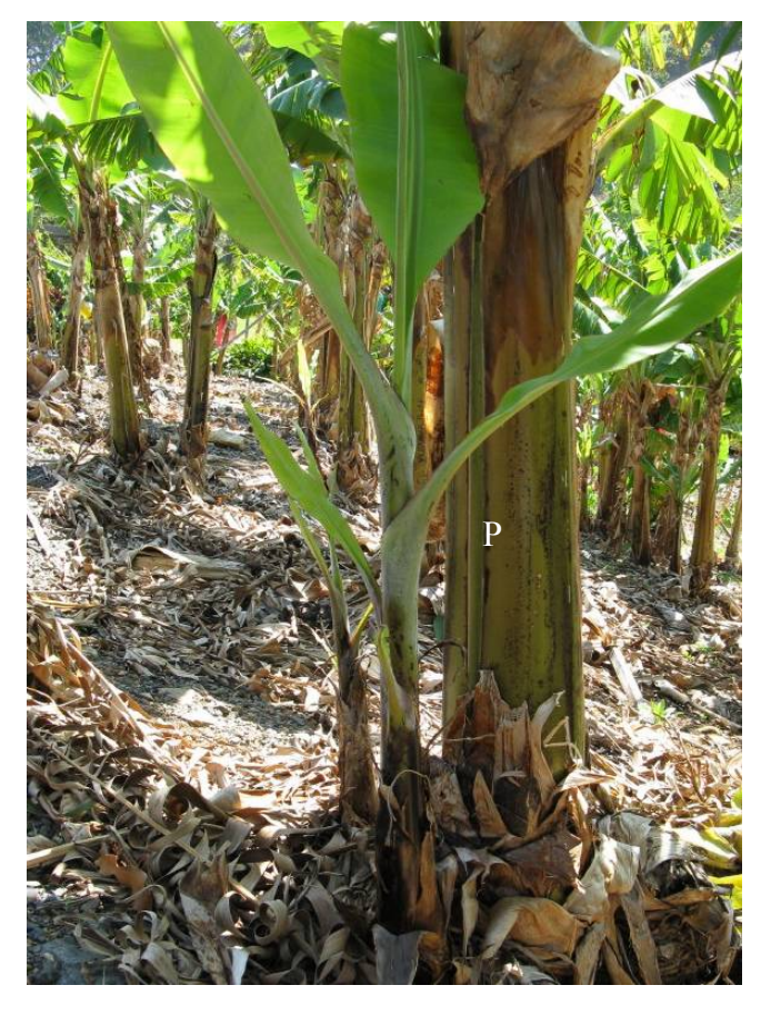
Figure 2. Banana plant showing the main pseudostem (P) with two suckers. If suckers develop well ahead of fruiting of the pseudostem they should all be removed. However, as the pseudostem matures, one sucker will be left to become the replacement plant.

Routine desuckering of banana stools is undertaken at least every 4 months in order to remove suckers (Figure 2) that may compete with the pseudostem for water and nutrients (Broadley et al. 2004).