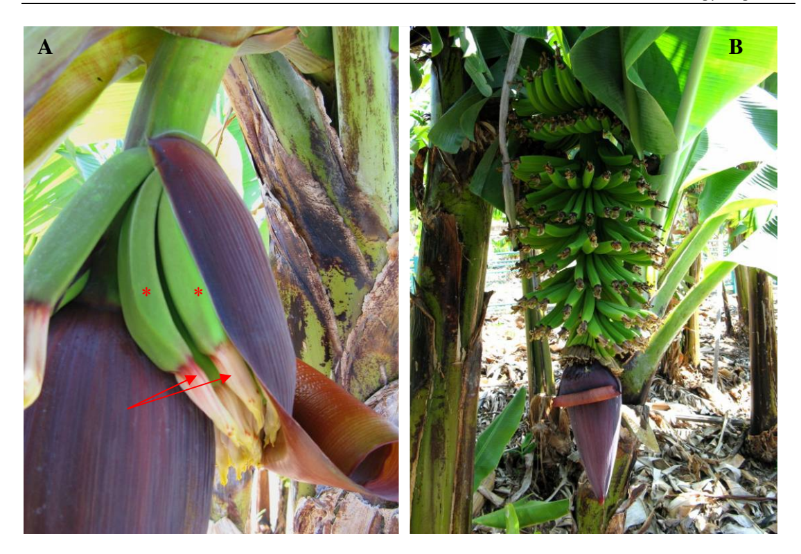
Figure 8. A) Close-up of female flowers showing the remains of the white, tubular tepals (arrowed) and the fruits (*) developing from the ovaries in a hand and, B) maturing inflorescence showing the fruits developing from the female flowers and starting to reflex (turn upwards), and the 'bell' containing the male flowers

The tepals<sup>11</sup> are white, tubular and toothed (Figure 8A). The flowers secrete nectar at the tip of the ovary and this then collects at the base of the tepals. They are negatively geotropic and turn upwards as they develop (Figure 8B). Male and female flowers are morphologically indistinguishable until the inflorescence is about 12 cm long; at this point the ovary in the male flower fails to develop any further (Simmonds 1959a). Flowers have a 3-lobed stigma and style and an inferior ovary fused from 3 loculi. Each loculus of a female flower contains two rows of ovules embedded in a strip of mucilage (Simmonds 1953). There are 5 stamens in male flowers; these are reduced to staminodes in female flowers. Pollen, if produced, is sticky (Simmonds 1959a).