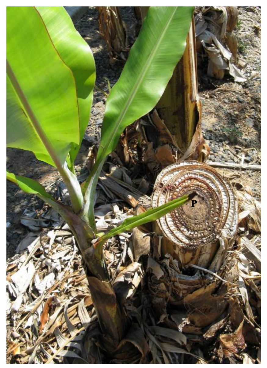
Figure 5. Maiden sucker developing after the pseudostem (P) has been cut back. Note the circular arrangement of leaf sheaths in the transverse section of the pseudostem (see discussion in Section 3.1).

iii) Maiden sucker – where the sucker/ratoon has normal foliage leaves but has not reached the fruiting stage (Figure 5).