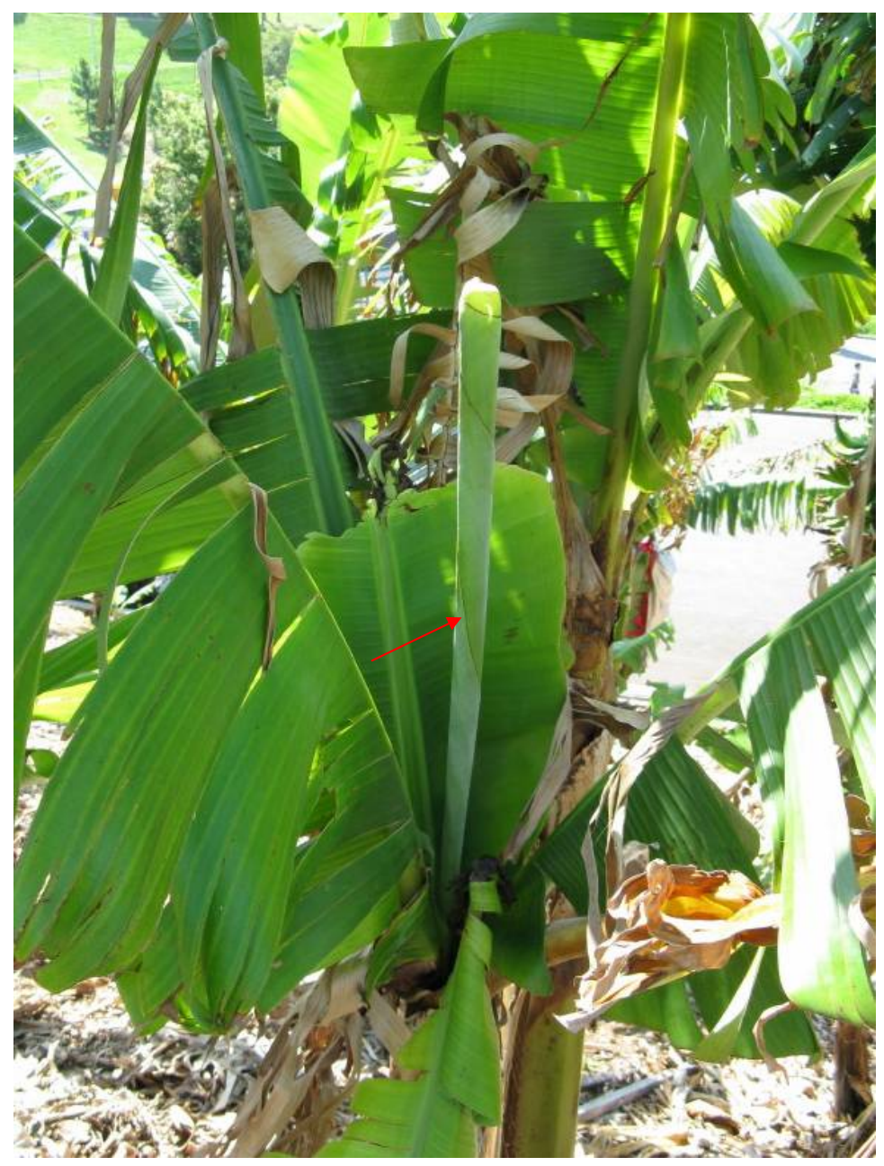
Figure 6. Emergence of a rolled leaf (arrowed) from the top of the pseudostem. The older leaves have unrolled as they have developed and show the characteristic predominant midrib, parallel venation and blade tearing