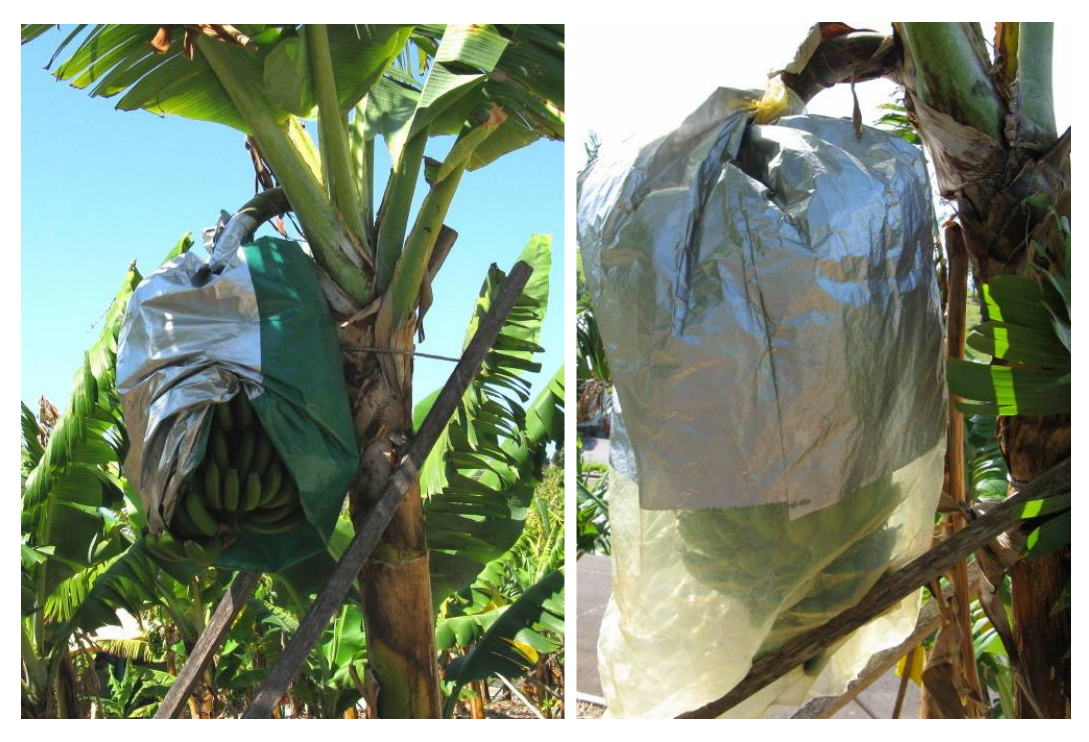
Figure 3. Two types of plastic bunch covers. Note propping of pseudostems with wooden stakes to prevent their falling over under the weight of the bunches.

In most commercial operations, the banana bunches are covered in plastic or cloth bags to prevent blemishes from mechanical and bird/flying fox/sugar glider damage (Figure 3). This operation also enhances the effectiveness of insecticides that have been applied to the developing bunch and aids fruit development through provision of a warm environment (Broadley et al. 2004; Daniells & Lindsay 2005). The cover should not be applied until about 21 days after shooting so that the fingers are firm enough to resist frictional damage (Morton 1987). The use of tubular polyvinyl chloride (PVC) and polyethylene was first trialled in Queensland in the late 1950s and became standard practice worldwide (Morton 1987). Different colours of plastic are now available but it is not known if these affect bunch ripening (Daniells & Lindsay 2005). Other tasks performed on developing bunches include bunch trimming, insecticide treatment and removal of the 'male bud' (debelling) at the end of the inflorescence so as to redirect sugars to the developing fruits (Morton 1987; Broadley et al. 2004; Daniells & Lindsay 2005). Pseudostems of some cultivars, particularly those in the Cavendish subgroup, usually require propping to prevent their falling over as the developing bunches become heavier (Figure 3); the props are applied as soon as possible after bunch emergence (Broadley et al. 2004).