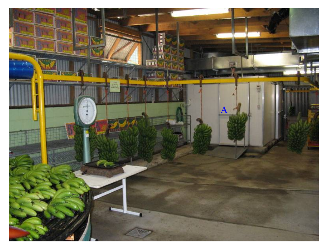
Figure 4. Packing shed in a small commercial facility showing cool room (A), harvested bunches hanging on a conveyor system, and turntable (left foreground) for washing individual hands removed from the bunches.

reduced to 85%. Ethylene gas is pumped in at a rate that provides the desired speed of ripening (Morton 1987).