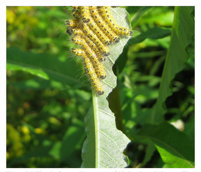
Figure 6. Willow leaf gnawed by a group of Phalera bucephala caterpillars