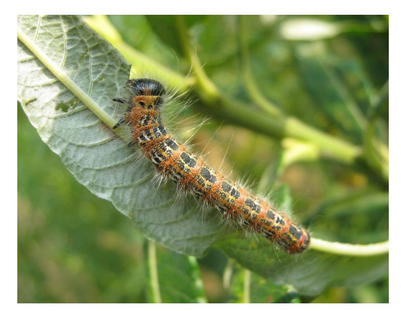
Figure 2. Mature caterpillar of Phalera bucephala