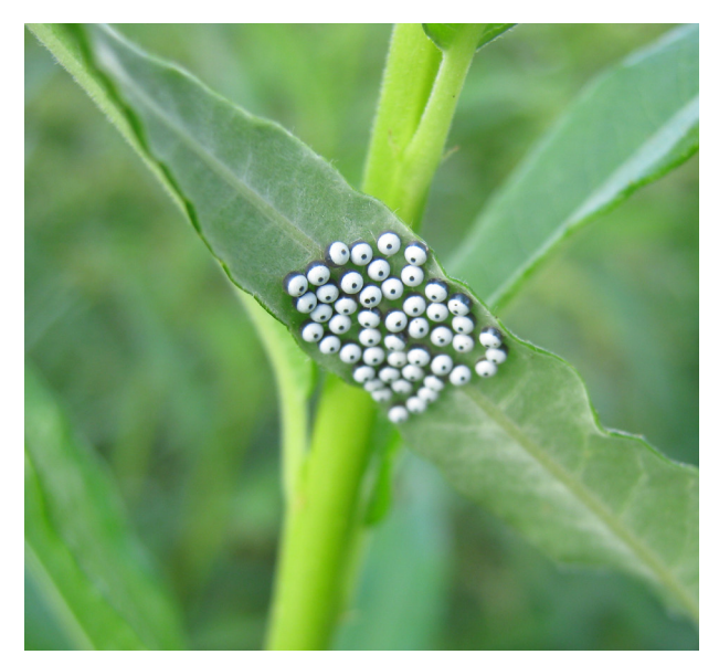
Figure 1. Egg cluster of Phalera bucephala on willow leaf