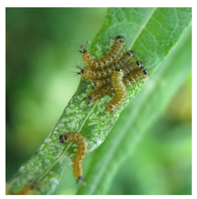
Figure 5. Feeding of young caterpillars of Phalera bucephala