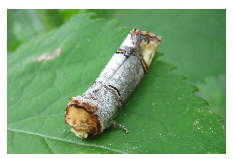
Figure 4. Moth of Phalera bucephala with folded wings