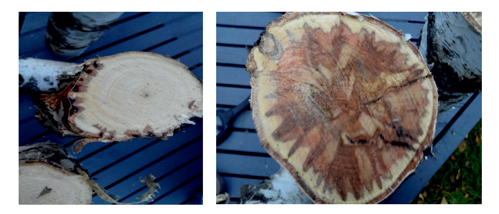
Photo 3. Damages of woody by phytopathogenic bacterium Erwinia multivora Scz.-Parf [11]

Bacteria ( Erwinia multivora Scz.-Parf.), by penetrating into the wood through the damages, which are made by woodpecker, frost cracks, mechanical damages, destroy pectic partitions of cells, cell sap fills by itself the whole volume of infected wood. Wood becomes wet and very heavy (Photo 3) [11].