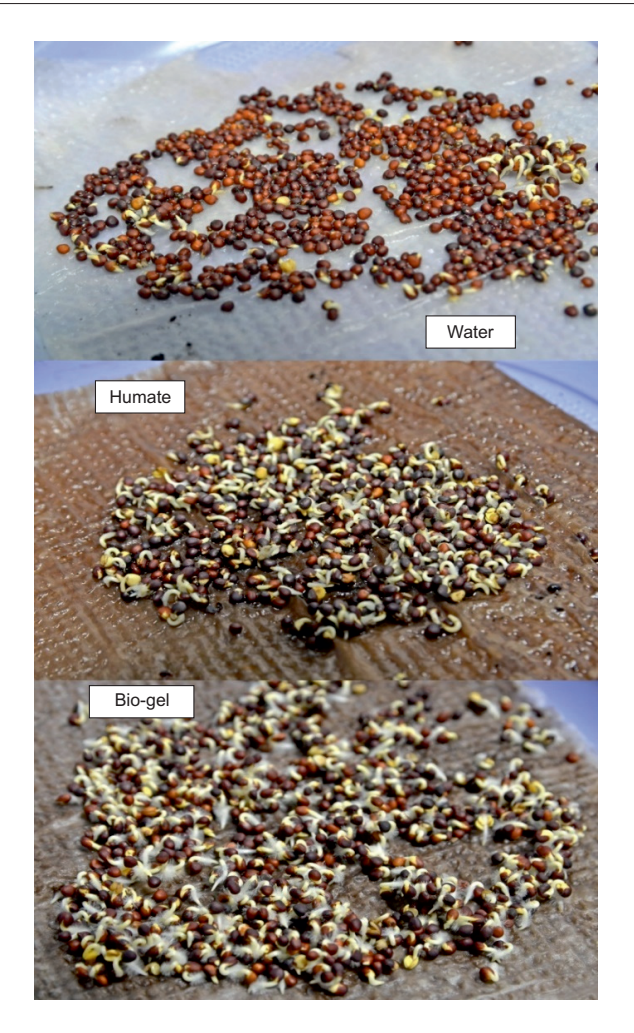
Photo 5. Influence of the products of humate of the chemical origin and "Bio-gel" on the test crop – rape seed

high efficiency of new product in the process of biological activity of agro-industrial production.