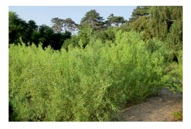
Photo 4. Efficiency of "Bio-gel" on perennial tree crops

It is also confirmed by field experiments on different crops, including forest crops with the chemical fungicides of different producers. Experiments showed that the use of half-dose of chemical fungicides together with "Bio-gel" provides practically the same result, as the dose, which is recommended by producers. Thus was proved the rather