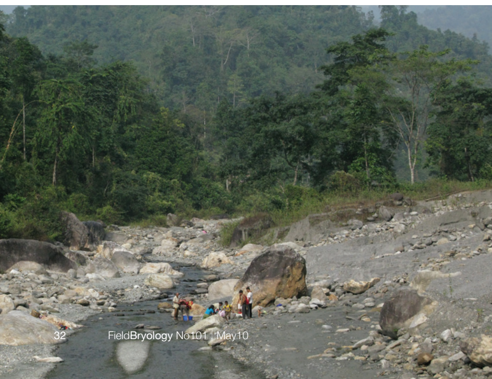
◀ The subtropical foothills of south-west Bhutan near Samtse showing one of the many small stream valleys descending to the plains on the Indian border.