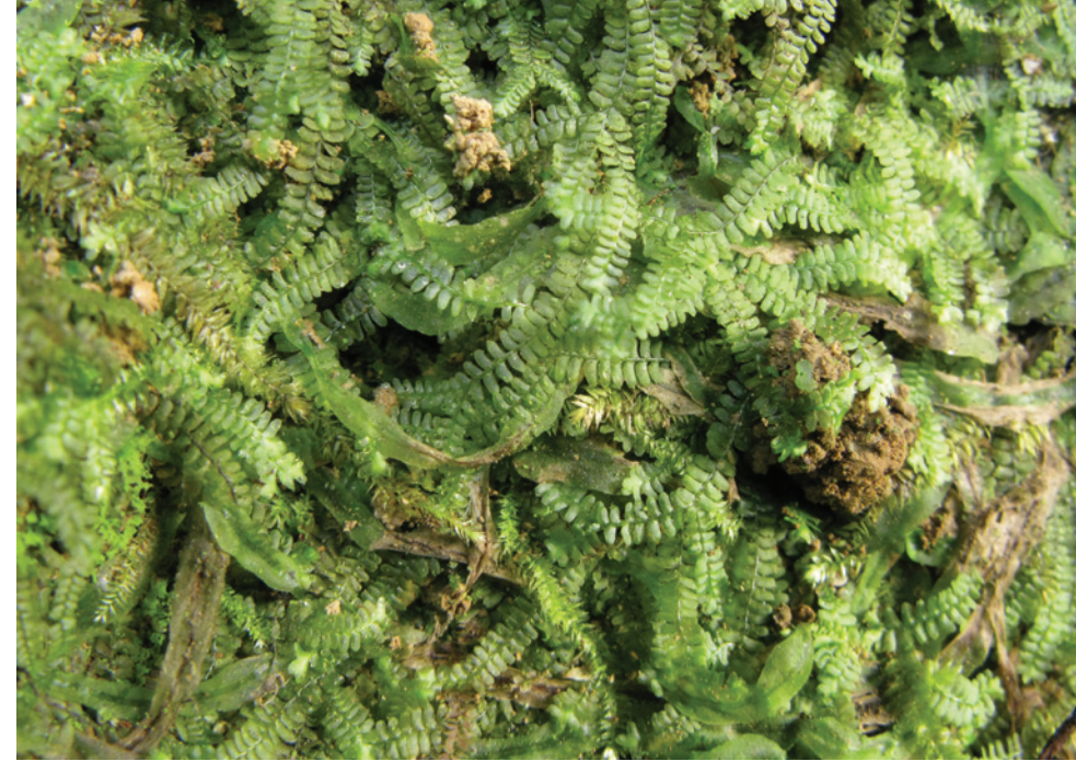
△ Above: Meteorium buchanani (Meteoriaceae), a common epiphyte in mossy temperate oak forests in Bhutan. D. Long ▷ Centre: Wiesnerella denudata (Wiesnereallaceae), a rare, complex thalloid liverwort found along streams in humid temperate broadleaf forests in Bhutan. D. Long ▷ Right: Bazzania tridens growing on shady rocks in the same ravines where B. bhutanica was relocated. D. Long

a few bryophytes were collected as well as many flowering plants. It was in one of these ravines that Bazzania bhutanica was discovered. These foothills of the Bhutan Himalaya have in the past supported luxuriant subtropical forests (Grierson & Long, 1983) rich in large and often valuable trees such as Ailanthus grandis , Bombax creiba , Pterospermum acerifolium , Shorea robusta , Terminalia myriocarpa and Tetrameles nudiflora , but over the past century intermittent logging has removed many of these trees and much of the forest is now secondary. Nevertheless, along many streams in valleys and ravines, reasonable forest cover has sometimes survived and such places are important refugia for trees, shrubs, lianas, herbs and bryophytes characteristic of those forests. The primary human activities in these forests are firewood and fodder harvesting, and cattle grazing, both of which are sustainable in moderation, but a significant threat to biodiversity if over-indulged.