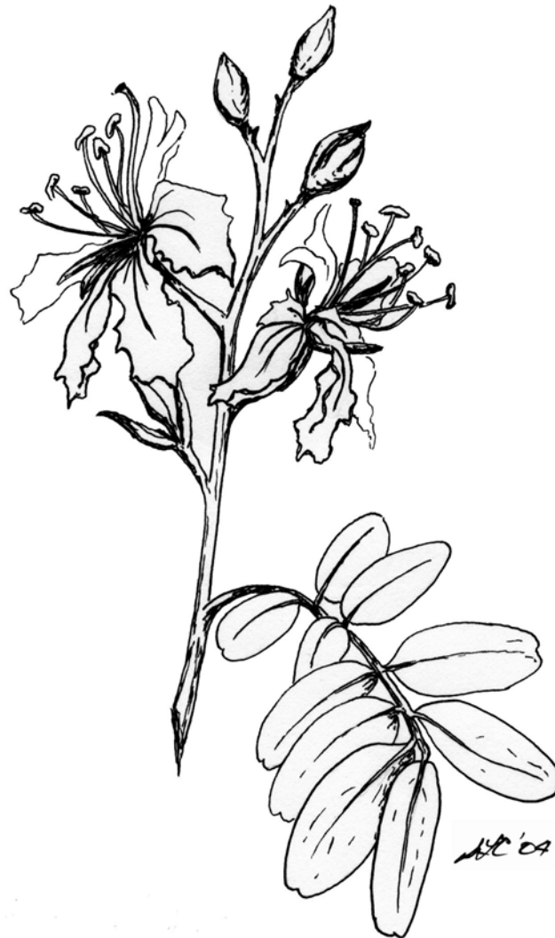
Baikiaea Plurijuga , Zambezi Teak