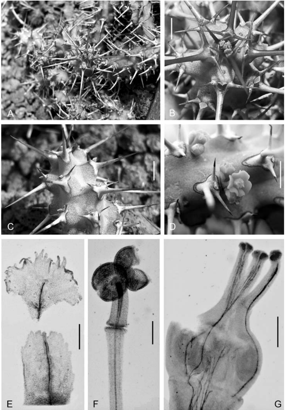
Fig. 2. Euphorbia greuteri – A: habit; B: close up of shoot apex with the tiny leaves; C: close up of branch showing the spine shields; D: cymes in bud and very early stage of flowering; E: bract of involucre (bottom) and lobe of cyathium (top); F: staminate flower; G: pistillate flower (ovary broken on left side). – Scale bars: B-D = 2.5 mm, E-G = 0.5 mm; photographs by N. Kilian (A-B), M. Meyer (C-D) and E. Scherer (E-G) of a plant from the type locality cultivated at the Botanic Garden Berlin-Dahlem.