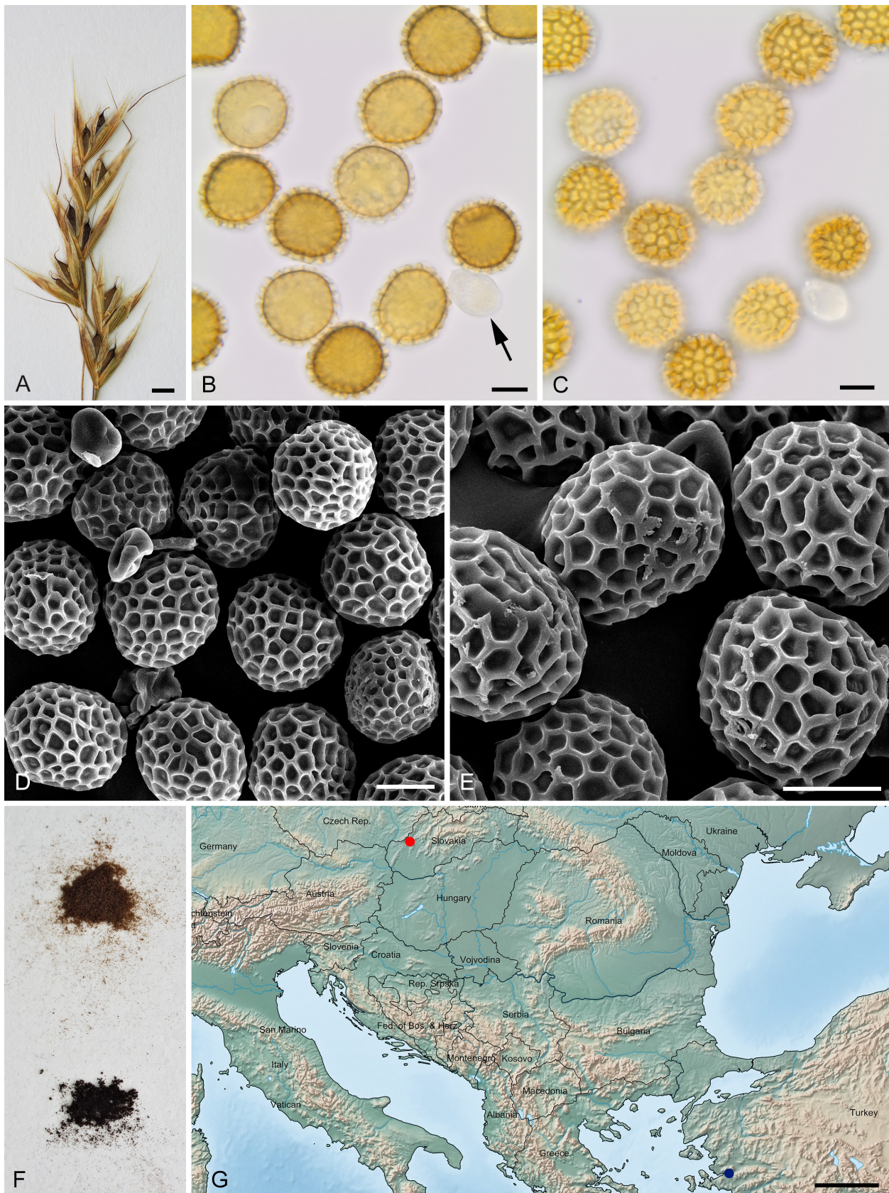
Fig. 1. A–E: Tilletia elizabethae on Ventenata dubia (holotype); A: habit; B, C: spores and a sterile cell in LM (in median and surface view, respectively); black arrow shows a sterile cell; D, E: spores and sterile cells in SEM. – F: spore mass colour of Tilletia elizabethae (above) and T. ventenatae (below). – G: type localities of T. elizabethae (red circle) and T. ventenatae (blue circle) (generated with SimpleMapp; Shorthouse 2010). – Scale bars: A = 2 mm; B–E = 10 µm; G = 200 km.