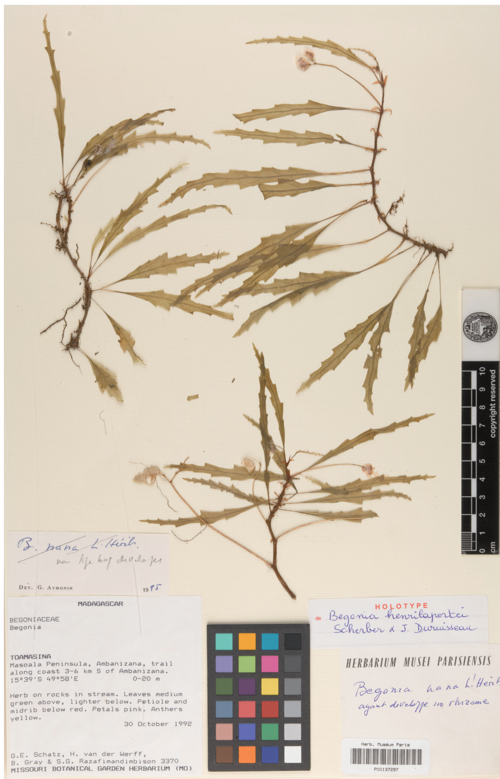
Fig. 3. – Holotype of Begonia henilaportei Scherber. & J. Duruisseau. [Schatz et al. 3370, P]