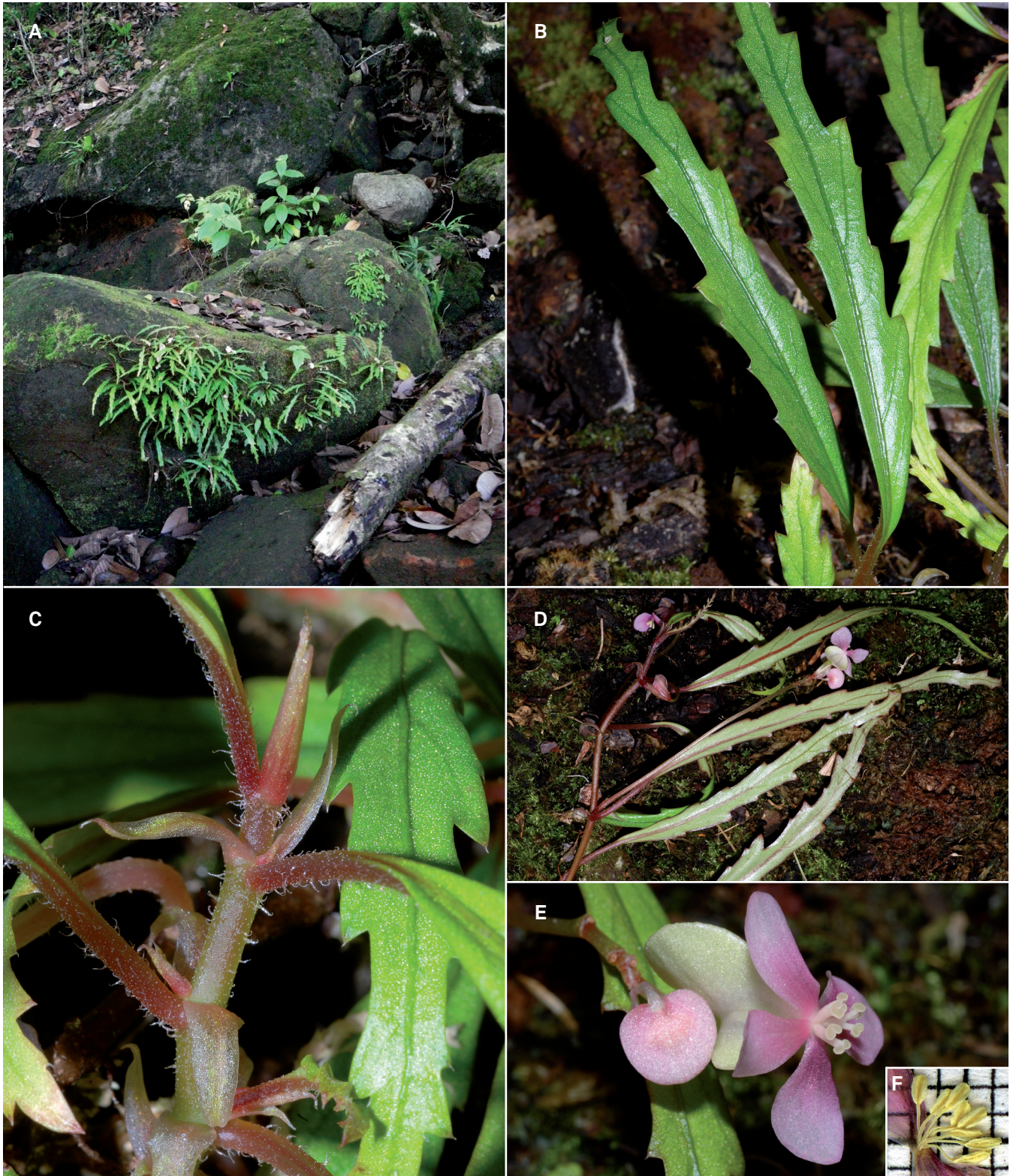
Fig. 2. – Begonia henrilaportei Scherber. & J. Duruisseau. A. Habit in the type locality; B. Leaf adaxial surface; C. Apex of stem; D. Leaf abaxial surface; E. Inflorescence showing female flower and male flower bud; F. Stamens.