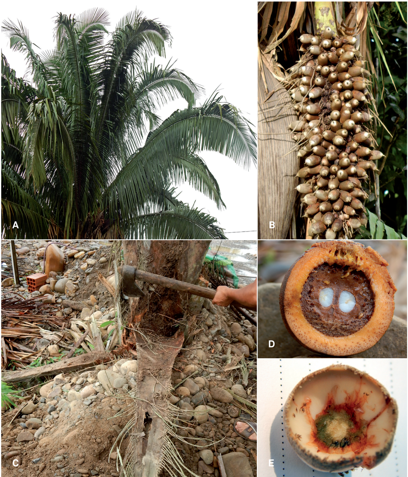
Fig. 2. – Attalea blepharopus Mart. A. Growth habit; B. Inflorescence at ripe stage; C. Fibrous margins of leaf base; D. Cross section of fruit showing two developing seeds; E. Staminodial ring adnate to corolla (removed from a fruit) appears densely ciliate in the margins.