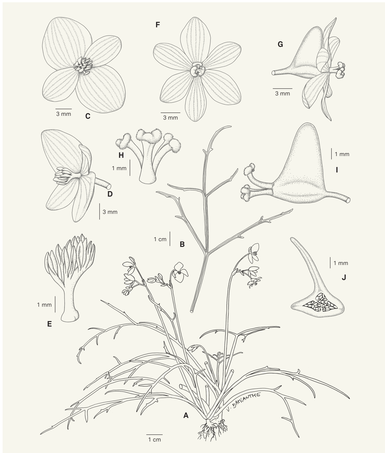
Fig. 2. – Begonia pteridoides Scherber. & Duruiss. A. Habit; B. Leaf, adaxial side; C. Male flower, front view; D. Male flower, side view; E. Androecium; F. Female flower, face view; G. Female flower, side view; H. Styles and stigmas; I. Ovary; J. Ovary cross-section. [Scherberich 1148, LYJB] [Drawing: Vanessa Damianthe]