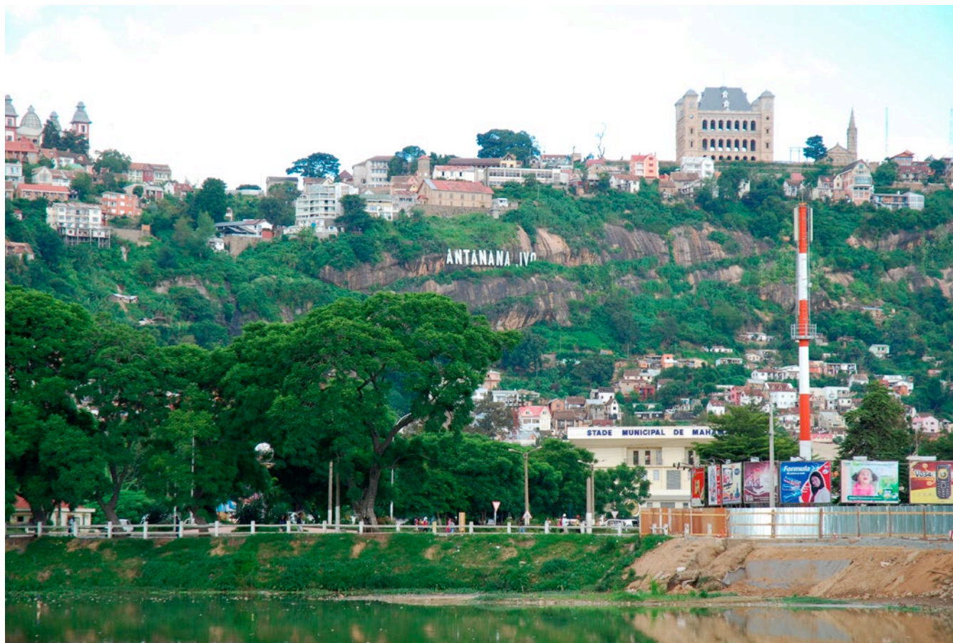
Fig. 2. – Inselberg in the capital Antananarivo with the “Palais de la Reine”.

rich in locally endemic species and possess more habitat specialists than similar habitats in most other tropical regions.