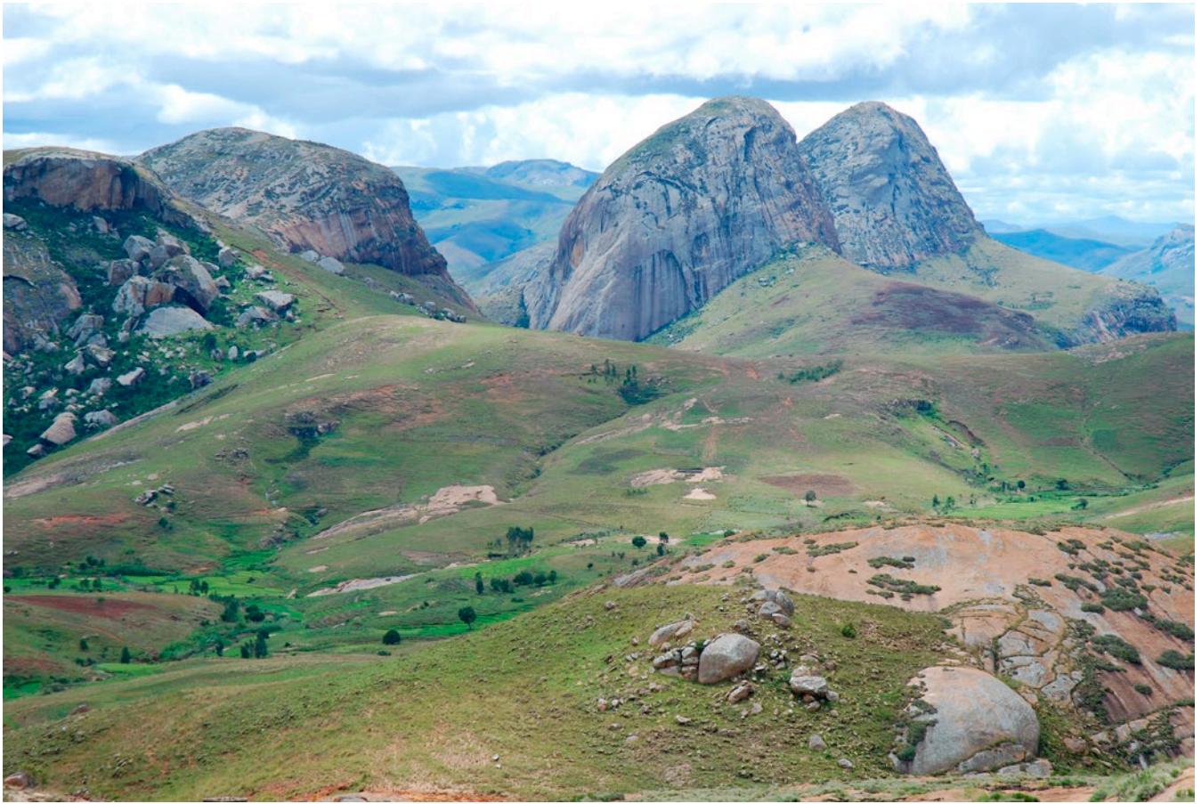
Fig. 1. – Inselberg landscape, near Ambalavao.