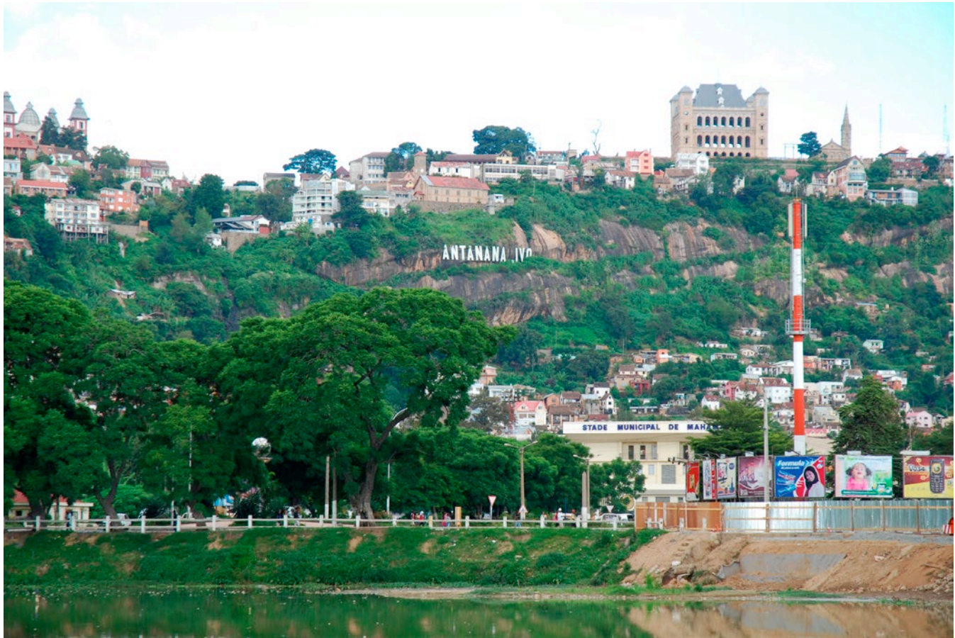
Fig. 2. – Inselberg in the capital Antananarivo with the “Palais de la Reine”.

rich in locally endemic species and possess more habitat specialists than similar habitats in most other tropical regions.