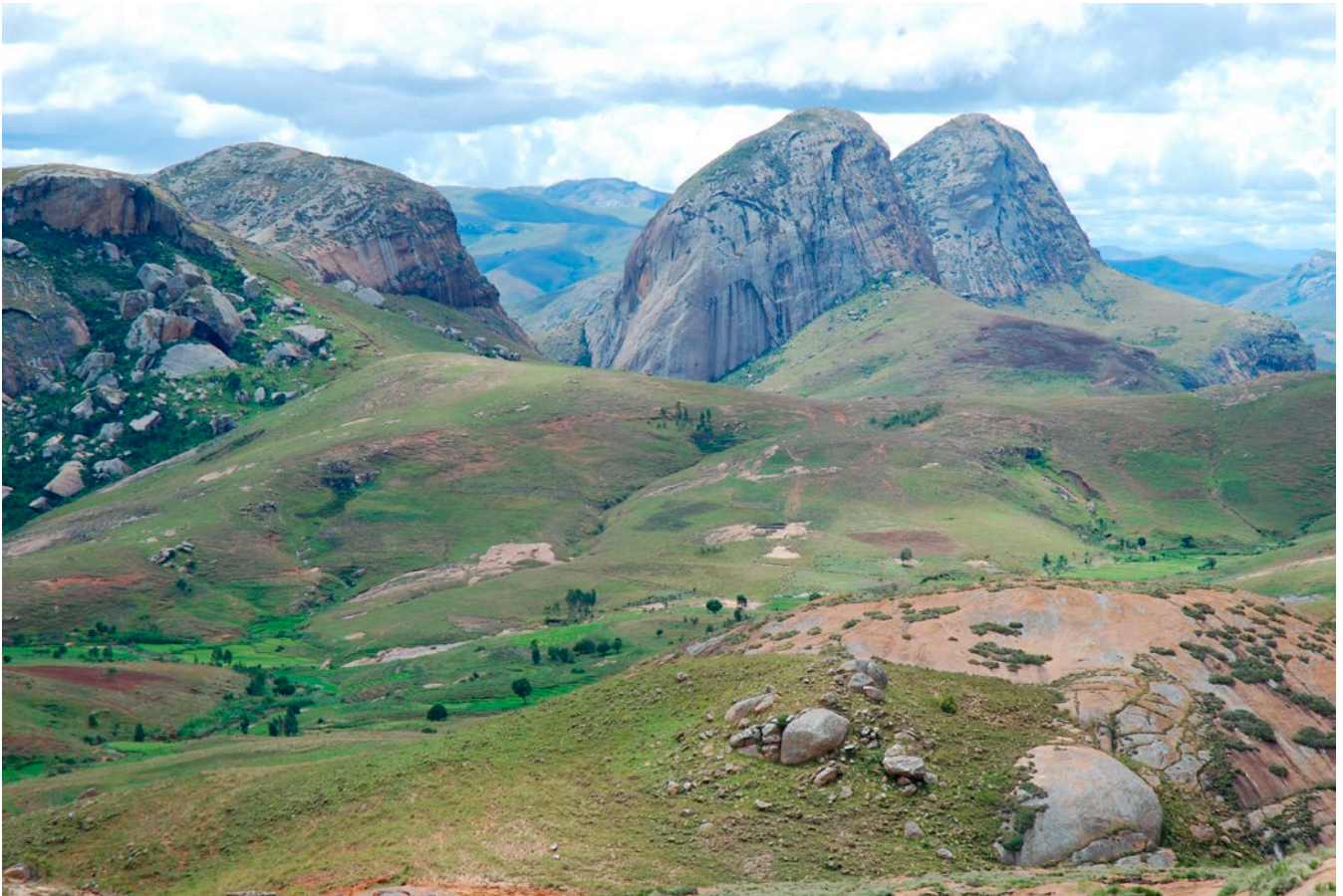
Fig. 1. – Inselberg landscape, near Ambalavao.