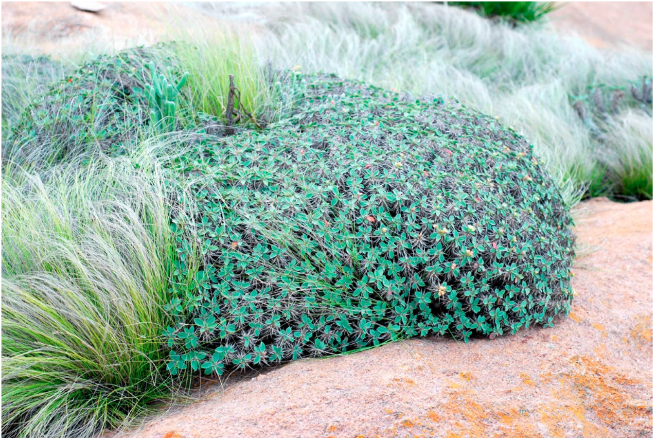
Fig. 4. – Euphorbia horombensis Ursch & Leandri ( Euphorbiaceae ) a succulent on open rocks at Vohitsanavo inselberg, Anja Park (Fig. 3: n° 23). [Razafindraibe et al. 278]

(B.S. Williams) Schltr., Angraecum pseudofilicornu , Oeceoclades calcarata (Schltr.) Garay & P. Taylor, Sobennikoffia humbertiana ) were present.