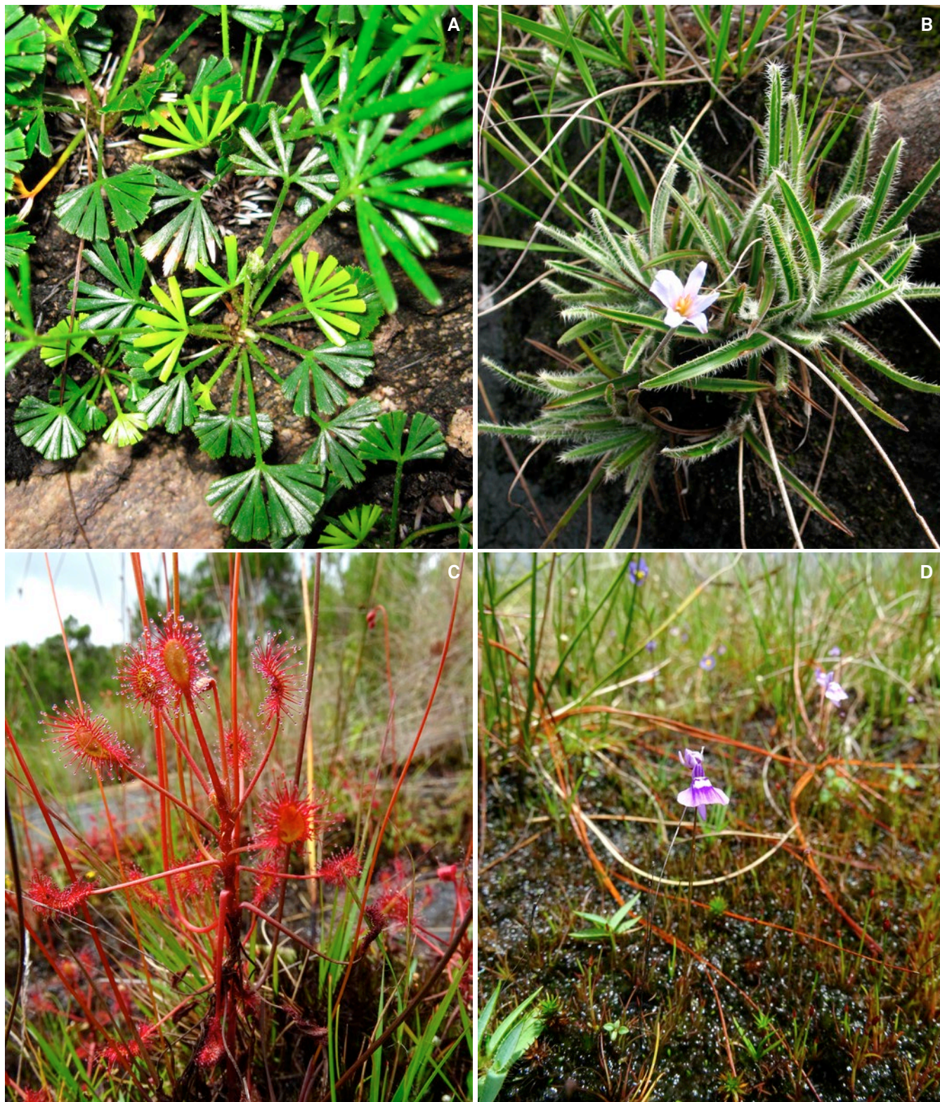
Fig. 5. – A. Actiniopteris dimorpha Pic. Serm. ( Pteridaceae ) a desiccation-tolerant species of fern at Vohidava, Ihoay; B. Xerophyta sp. ( Velloziaceae ) near Anjoman'Akona, south of Ambositra; C. Drosera madagascariensis DC. ( Droseraceae ); D. Utricularia sp. ( Lentibulariaceae ). [A: Razafindraibe et al. 300; B: Rakotoarivelo et al. 287; C: Rabarimanarivo et al. 745; D: Rabarimanarivo et al. 705]