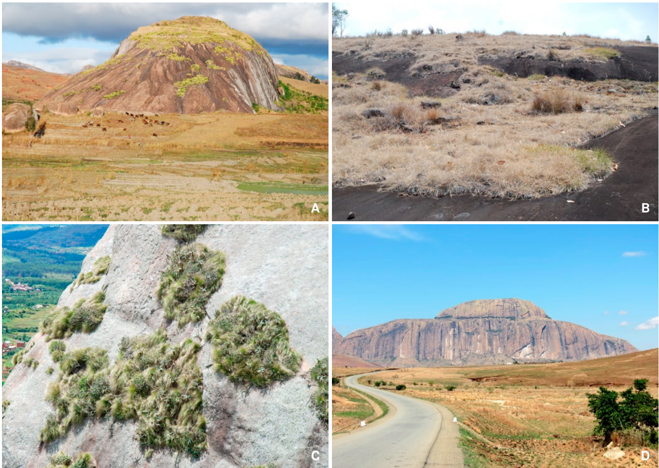
Fig. 6. – A. Inselberg, south of Anja Park (Tangorika) covered with Furcraea foetida (L.) Haw. (Asparagaceae); B. Mat with Styppeiochloa hitchcockii (A. Camus) Cope (Poaceae) near Angavokely; C. Mats formed by Coleochloa setifera (Ridl.) Gilly (Cyperaceae) and steep slopes, south of Fianarantsoa; D. General overview of "Bonnet du Pape, at Voatavo (Fig. 3: n° 26).

exceptions include those within certain National Parks such as Andringitra and Marojejy. In unprotected areas globally, inselbergs often support the last remnants of natural vegetation in a given area. While certain types of human use of inselbergs have occurred for generations and do not seem to have caused severe damage, in recent times human impact appears to have become by far more destructive resulting in steadily growing pressure on these areas, and today most inselbergs in Madagascar exhibit detrimental human impacts. These include: the over-collection of certain useful species which impacts local populations or even threatens local endemics with extinction; use of inselbergs for grazing cattle and goats; uncontrolled bush-fires, usually resulting from the widespread burning of grasslands for agriculture, that may significantly impact the population of individual species and which are also responsible for habitat degradation or destruction as a whole (see WHITMAN et al., 2011 for a study of the influence of fire and water availability