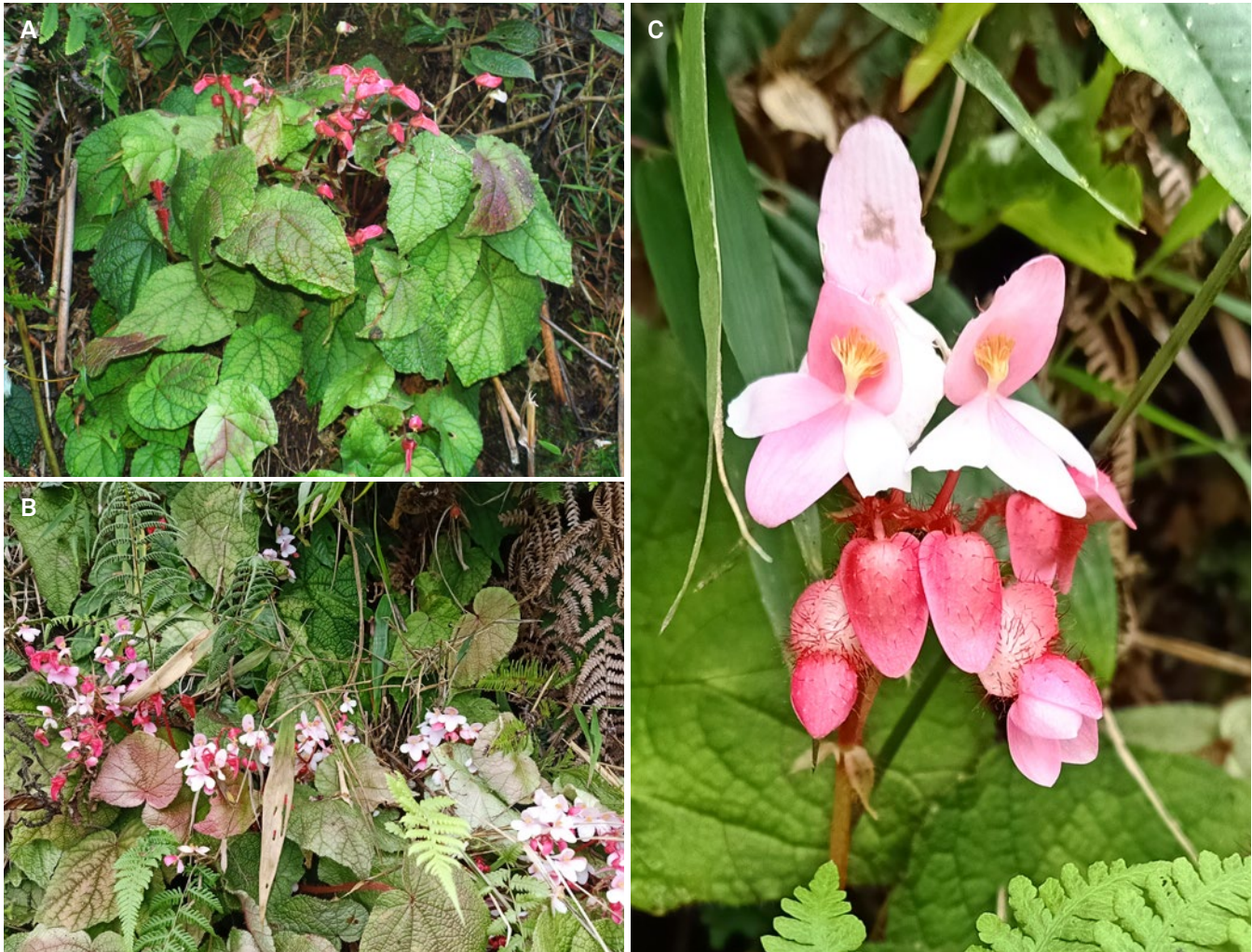
Fig. 2. – Begonia egamii D. Borah, Taram & M. Hughes. A, B. Habitat; C. Detail of staminate flowers showing the unusual asymmetric androecium.

Flowers from November to December, fruiting from December to January.