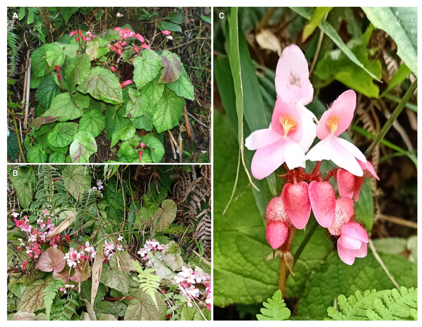
Fig. 2. – Begonia egamii D. Borah, Taram & M. Hughes. A, B. Habitat; C. Detail of staminate flowers showing the unusual asymmetric androecium.

Flowers from November to December, fruiting from December to January.