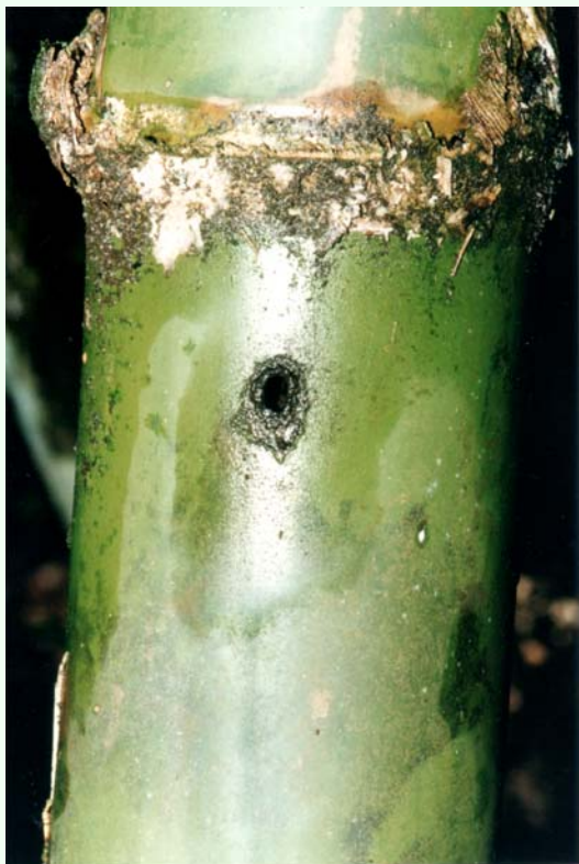
Figure 5. Internodes of Guadua chacoensis (Rojas) Londoño and Peterson (Poaceae) with a hole in the wall. High quality figures are available online.