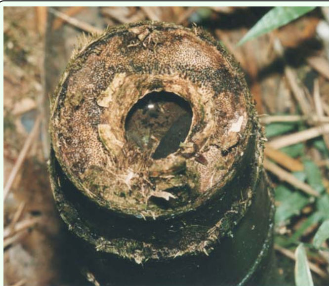
Figure 6. Stumps of Guadua chacoensis (Rojas) Londoño and Peterson (Poaceae). High quality figures are available online.