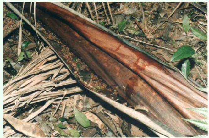
Figure 8. Fallen floral bracts of the palmetto Euterpe edulis Martius (Arecaceae) at the field site in Iguazú National Park, Misiones Province. High quality figures are available online.