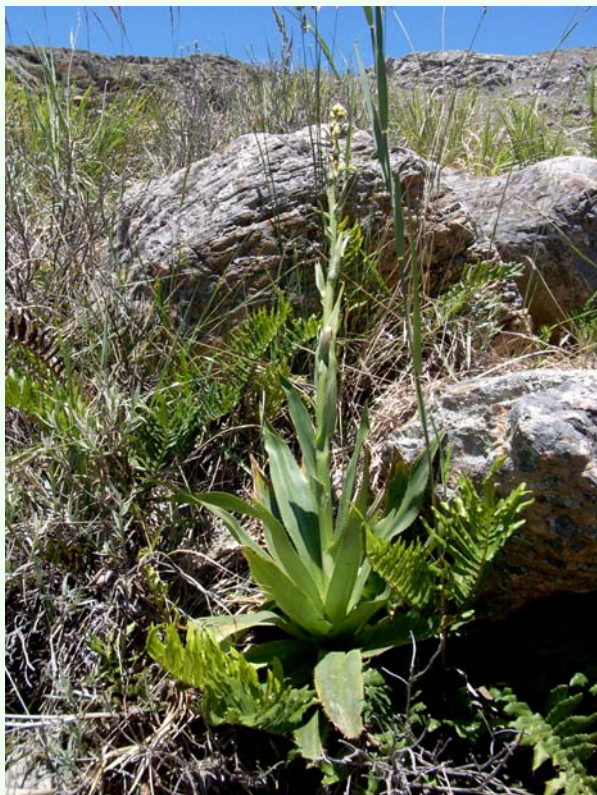
Figure 3. Eryngium aff. serra Cham. and Schltldl. (Apiaceae) at the field site in Sierra de la Ventana, Buenos Aires Province. High quality figures are available online.