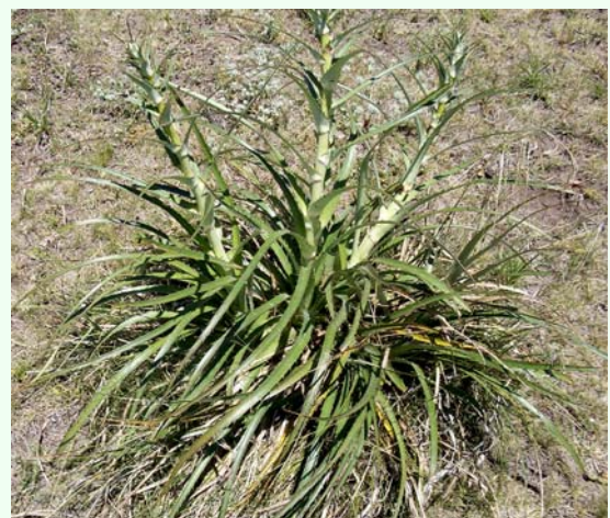
Figure 2. Eryngium horridum Malme (Apiaceae) at the field site in Sierra de la Ventana, Buenos Aires Province. High quality figures are available online.