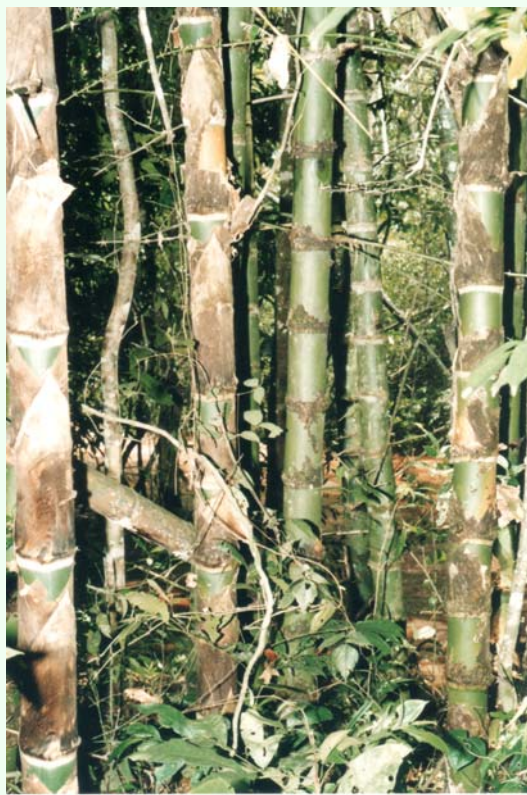
Figure 4. Guadua chacoensis (Rojas) Londoño and Peterson (Poaceae) at the forest site in Iguazú National Park, Misiones Province. High quality figures are available online.