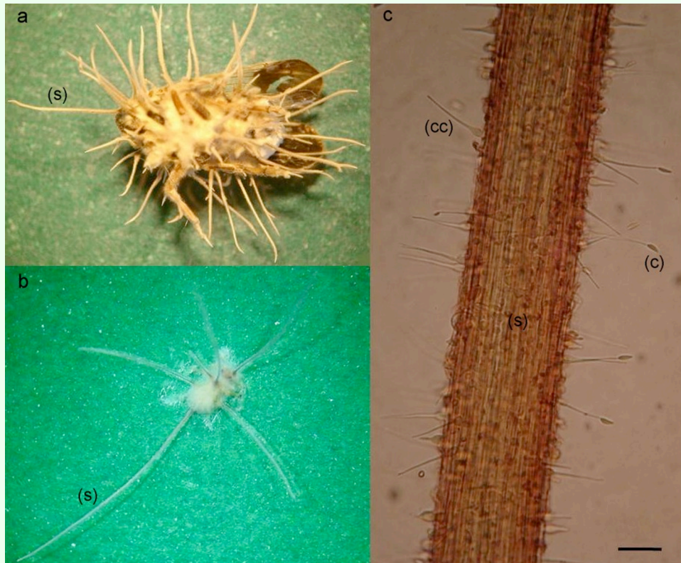
Figure 1. a: Adult Oliarus dimidiatus infected with Hirsutella sp. ARSEF8378. Note the formation of synnemata (s) branched with short lateral branches. b: Nymph of Ectopsocus sp. infected with Hirsutella sp. ARSEF8679. Note the synnemata (s) is slender and simple. c: Conidiogenous cells (cc) and (c) conidia of Hirsutella sp. ARSEF8679 arising as lateral cells over the whole length of the synnema (s). Scale bar: a: 2.5mm, b: 2mm, c: 17 \mu m. High quality figures are available online.