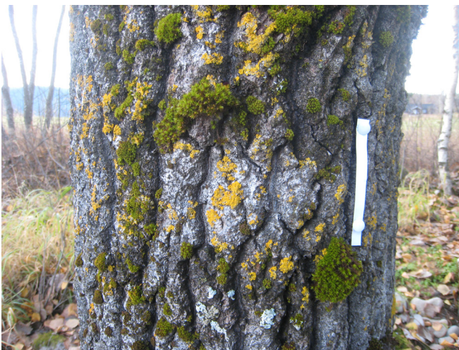
Figure 1. A Physcietalia vegetation with a large cover of Orthotrichetalia moss species, or an Orthotrichetalia vegetation invaded by Physcietalia lichen species? We prefer an integrated approach with both bryophytes and lichens included: several moss species ( Lewinskya speciosa , Nyholmia obtusifolia (both species formerly in the genus Orthotrichum , hence the name Orthotrichetalia ; Goffinet et al. 2004, Sawicki et al. 2010, Lara et al. 2016), Pylaisia polyantha ) and many lichen species ( Athallia pyracea , Caloplaca cerina , Candelariella xanthostigma , Myriolecis dispersa , Phaeophyscia orbicularis , Physcia adscendens , P. aipolia , P. stellaris , Toniniopsis subincompta , Xanthoria parietina ) were identified in an Orthotricho-Physcietea vegetation on a Populus tremula trunk (Koppang, Norway 2020). The length of the scale bar (white piece of paper) is 10.0 cm.

Many bryophyte and lichen species share the same habitat and substrate and are subject to the same (a)biotic conditions. Therefore, whenever possible, we integrated bryophyte and lichen syntaxonomy. As a result, our choice of syntaxa and syntaxon names fits the Dutch situation well but is not always in accordance with the International Code of Phytosociological Nomenclature (ICPN) (Weber et al. 2000). To illustrate this, we combined the 'bryophyte class' Frullanio dilatatae-Leucodontetea sciuroidis Mohan 1978 and the 'lichen class' Physcietea Tomaselli and De Micheli 1952 into one integrated class divided into the bryophyte-dominated order Orthotrichetalia Hadač in Klika and Hadač 1944 (originating from the Frullanio-Leucodontetea ) and the lichen-dominated order Physcietalia Hadač in Klika and Hadač 1944 (originating from the Physcietea ). According to the ICPN, the new name should be: Physcietea Tomaselli and De Micheli 1952. As in our integrated class both bryophyte and lichen species play a more or less equally important role, we combined both the original class names into the new name Orthotricho-Physcietea Tomaselli and De Micheli 1952 (Fig. 1), although not valid according to the ICPN. Why we chose to follow the ICPN in specific cases, and why we chose to divert from it in many other cases, is extensively