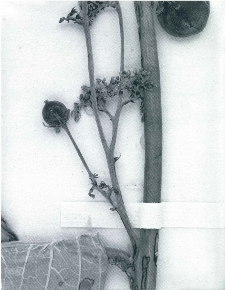
FIG. 3. Close up of bisexual glomerules with a central pistillate pedicel and paired dichasia of Phyllanthus grandifolius (Webster et al. 11268, DAV). \times 2 .

DISTRIBUTION AND HABITAT: The species is known only from the type collection, which lacks data except for the indication that it is from Colombia. In the enumeration of Mutis specimens of Blanco y Fernández de Caleyá (1991), Mutis 1902 is not listed, but localities of Mutis collections overall are summarized (in addition to the Bogotá area) as including Tolima (cabecera Mariquita) and Chocó, as well as collections in Ecuador by Caldas.