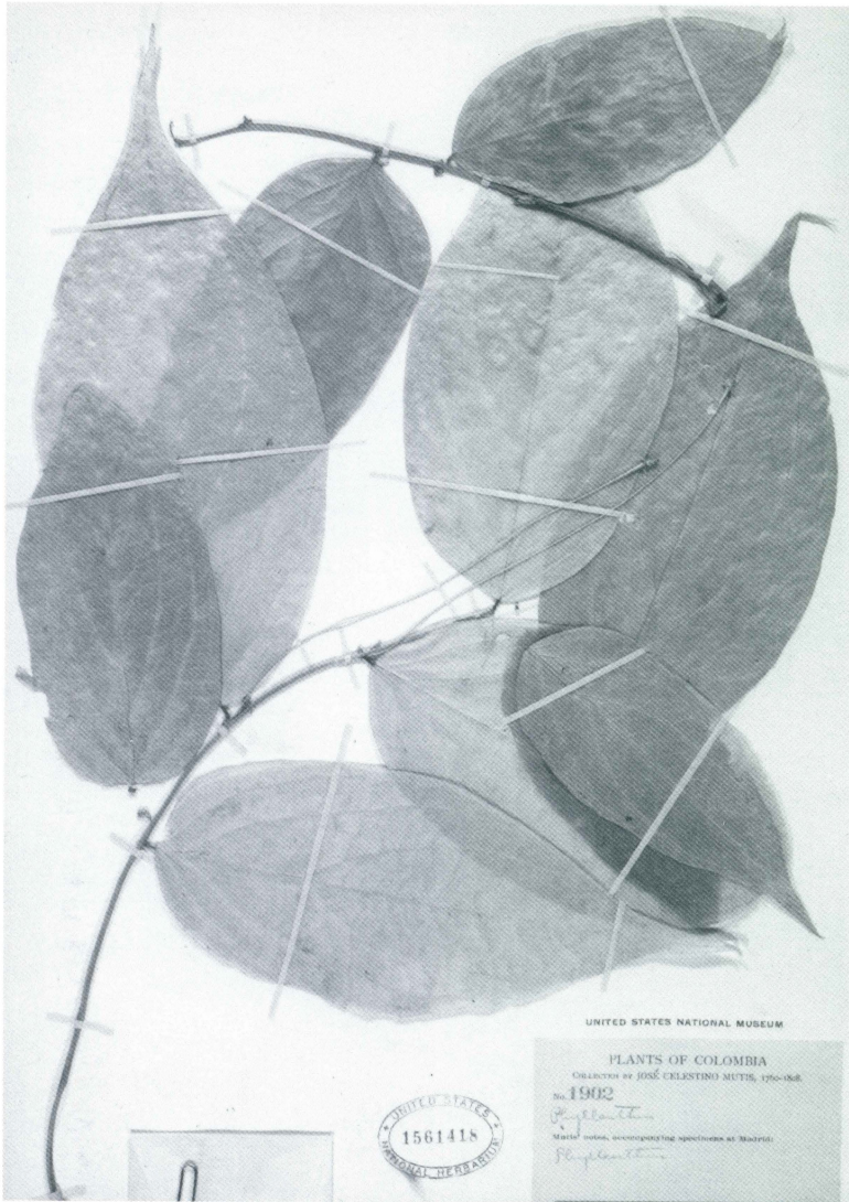
FIG. 1. Photograph of the holotype of Phyllanthus mutisianus (Mutis 1290, US 1561418).

Phyllanthoideae. The elongated slender fruiting pedicels suggest a possible affinity with Meineckia , but the seeds in the Mutis specimen, although immature, have a smooth testa very different from the arcuate seeds with foveolate testa found in Meineckia . Furthermore, in all species of Meineckia the staminate flowers are borne in condensed glomerules quite unlike the branching dichasia of the Mutis plant.