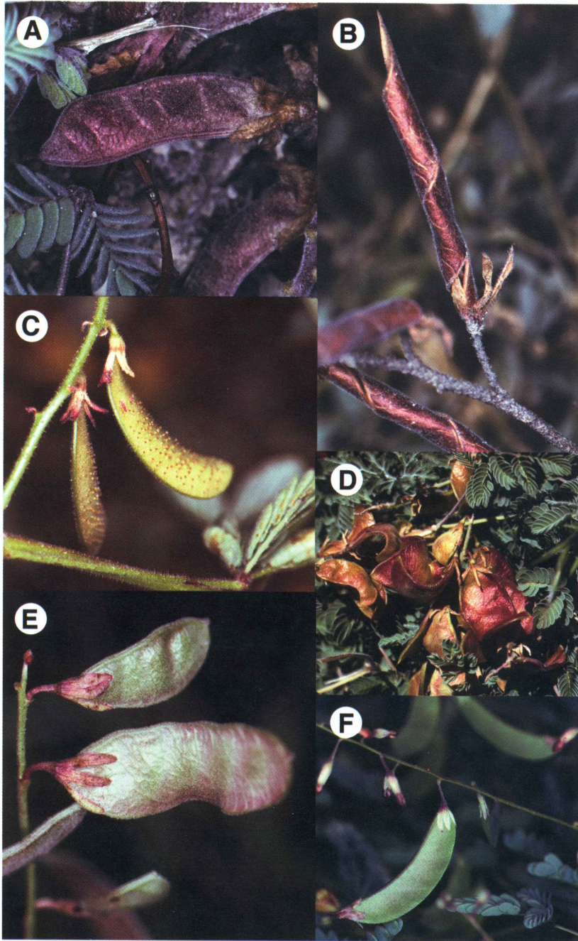
FIG. 3. Variation in fruits of Hoffmannseggia species. A. H. doellii from northern Argentina has dark-colored slightly recurved fruits. \times 2 . B. Fruits of H. miranda are dehiscent with the valves twisting after the seeds have been shed. \times 2 . C. H. peninsularis from Baja California has fruits similar to those of H. viscosa (Fig. 3F). \times 2 . D. H. repens restricted to the deserts of eastern Utah and neighboring Colorado, USA, has broad, flat, undulating fruits. \times 0.67 . E. H. tenella , an endangered species from southern Texas, USA has simple indehiscent fruits. \times 3.5 . F. H. viscosa has lunate fruits. \times 1.4 .