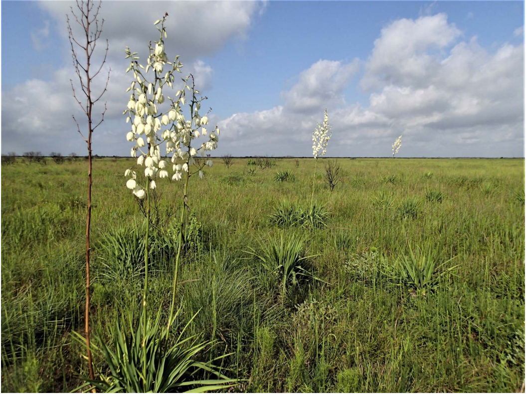
FIG. 3. Habit. Yucca carrii population, Brazoria National Wildlife Refuge.

Benth., Sambucus sp., Verbena stricta Vent., Hibiscus laevis All., Rubus sp., Ibervillea sp., Passiflora incarnata L., Vitis mustangensis Buckley, Campsis radicans (L.) Seem. ex Bureau, Borrhichia sp., Cuscuta sp., Cissus sp., Spartina spartinae (Trin.) Merr. ex Hitchc., Schoenoplectus americanus (Pers.) Volkart ex Schinz & R. Keller, Phragmites sp., Sorghum halepense (L.) Pers., Elymus canadensis L., Chloris sp.