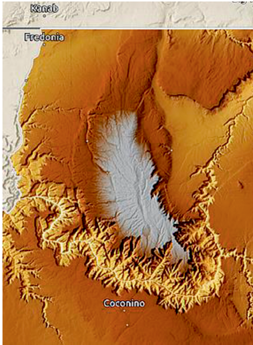
Fig. 2. Shaded relief map of the Kaibab Plateau, showing its sky island nature, with the higher elevations in white (more or less coincident with the study area) surrounded by lower elevations in brown.

Plateau, and Warm Springs Canyon (USDA 2014b).