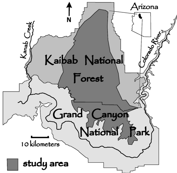
Fig. 1. Map showing the vicinity of the Kaibab Plateau and the area studied.

The lower elevational limit for this checklist is somewhat arbitrary, with the intention of capturing the unique flora of the upper elevations of the KP and lower portion of the ponderosa pine–Douglas-fir communities. By so doing, we included steep xeric and mesic terrain below the rim as well as hanging gardens. With the exception of the higher regions of the Powell Plateau, high buttes or mesas within GRCA were not included. The boundary of our study area (Fig. 1) is well defined by the upper portions of the rim of the Grand Canyon; where that rim falls below the ponderosa pine zone on the west, our boundary follows the Winter Road (FRs 425, 427, and 423 to FR 22). The boundary continues, making a northern arc with a radius of 8–10 km around Jacob Lake at the lower level of the ponderosa pine zone to the East Side Game Road (FR 220), through Saddle Mountain Wilderness and to the east rim of the KP. Although Rasmussen (1941) places the lower elevational limit of the KP at 1830 m (6000 ft) with an area of 95 km (60 mi) by 55 km (35 mi) and 2980 km 2 (1152 mi 2 ), our study area is ca. 1880 km 2 (725 mi 2 ).