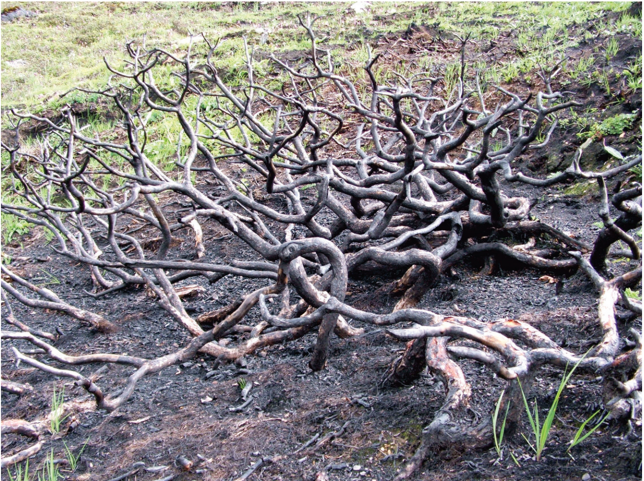
FIGURE 1 Rhododendron shrubs above 4100 m altitude at Soe Yaksa after prescribed burning.

prescribed burning can lead to 4.5 times as much carrying capacity as cutting or no treatment. The estimated carrying capacity after prescribed burning was also higher than the 0.10 livestock unit per hectare previously estimated for high-altitude regions (Dorjee 1986).