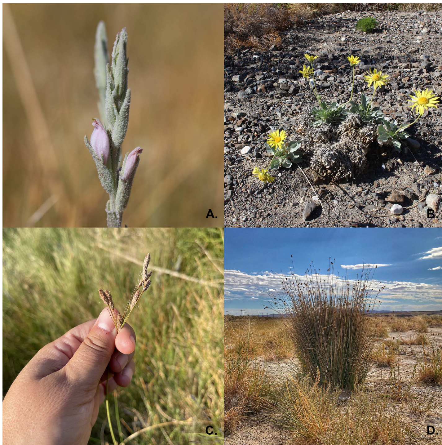
Figure 4. —Selected rare plants documented as a part of this study. (A) Chloropyron tecopense (Orobanchaceae). (B) Enceliopsis covillei (Asteraceae). (C) Fimbristylis thermalis (Cyperaceae). (D) Juncus cooperi (Juncaceae).

and dominate habitats (Curtis and Bradley 2015; Brooks et al. 2016).