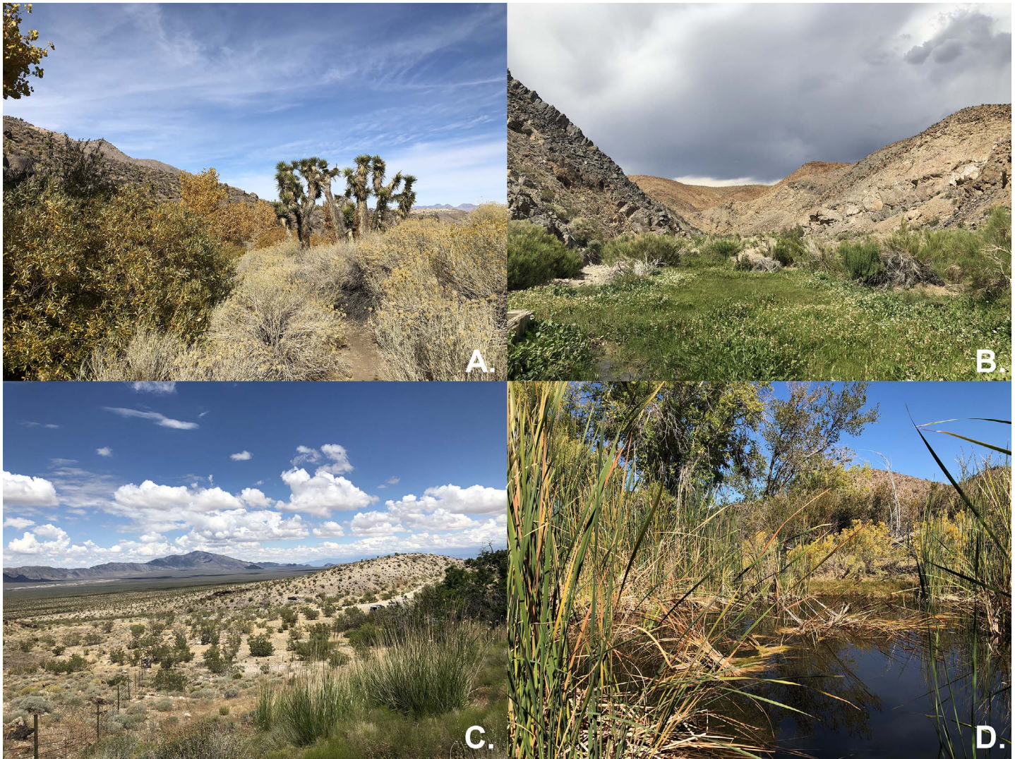
Figure 2. —Photographs of four desert springs sampled. (A) Lower Centennial Spring, Inyo County. (B) Miller Spring, Inyo County. (C) Wildhorse Spring, San Bernardino County. (D) Vaughn Spring, San Bernardino County.

In contrast, of the 296 upland plant taxa we documented, only 6.7% were nonnative taxa, and their life forms primarily consisted of annual herbs (54%), shrubs (19.8%), and perennial herbs (15.8%) (Supplemental Data Table 1). Asteraceae was the most species-rich family among upland taxa (21.6%).