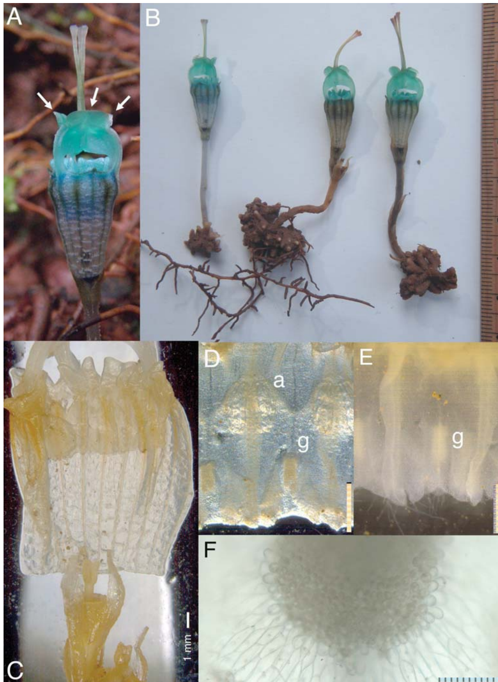
FIG. 2. Thismia betung-kerihunensis Tsukaya & H. Okada. A. Habitus. B. Three collected plants are shown. The thin root system observed under the middle individual does not belong to Thismia . The scale is in centimeters. C. Close-up of the flower preserved in 50% ethanol. The perianth tube was opened by a longitudinal slit. Note the absence of an acute apex in the anther connectives. Scale, 1 mm. D-E. Outer (abaxial) view of the anther connective. a, anther thecae; g, gland. Note the absence of acute apices and rectangular shape of the glands. Scale, 1 mm. Panel E shows the three-dimensional shape of the connectives and hairs from a specimen in 50% ethanol. F. Magnified image of the gland shown in panels D and E. Note the aggregates of round, nipple-like cells. Scale, 100 \mu m.