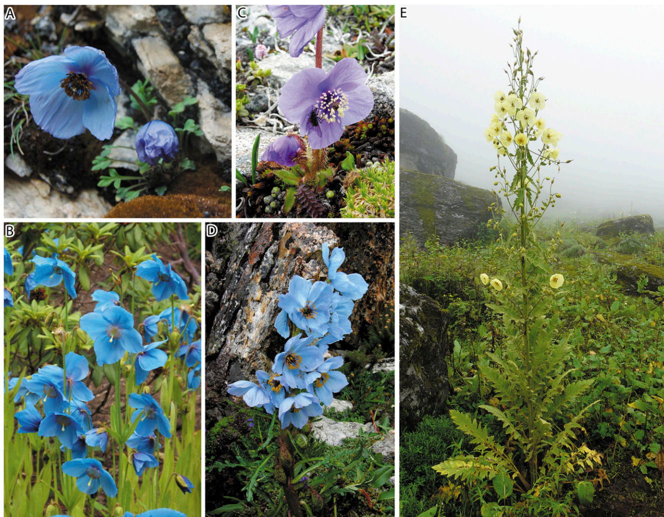
FIG. 2. Morphological overview of a species in each of the proposed Meconopsis sections. A. M. bella (in M. sect. Primulinae ). B. M. grandis cultivar (in M. sect. Grandes ). C. M. sp. (in M. sect. Aculeatae ) (possibly a hybrid between named species). D. M. speciosa (in M. sect. Aculeatae ). E. M. paniculata (in M. sect. Meconopsis ).

manually. Concatenated cpDNA data was analyzed using MrBayes v3.1.2 (Huelsenbeck and Ronquist 2005). Partition analysis was conducted for the combined cpDNA dataset with each cpDNA marker treated as a separate partition. The evolutionary models of nucleotide substitution were first selected by jModelTest (Posada 2008) under the Akaike information criterion (AIC), and we used the models most similar to the best fit models estimated by jModelTest and that were also available in MrBayes v3.1.2 for each gene partition: GTR+G for rbcl , GTR+I+G for ndhF , GTR+G for matK , and GTR+G for trnL-trnF dataset. Prior probability distributions on all parameters were set to the defaults. Twenty million generations were run using a Markov chain Monte Carlo method with four chains. Trees were collected every 100th generation. With 25% burn-in, a 50% majority-rule consensus tree was calculated to generate a posterior probability (PP) for each node.