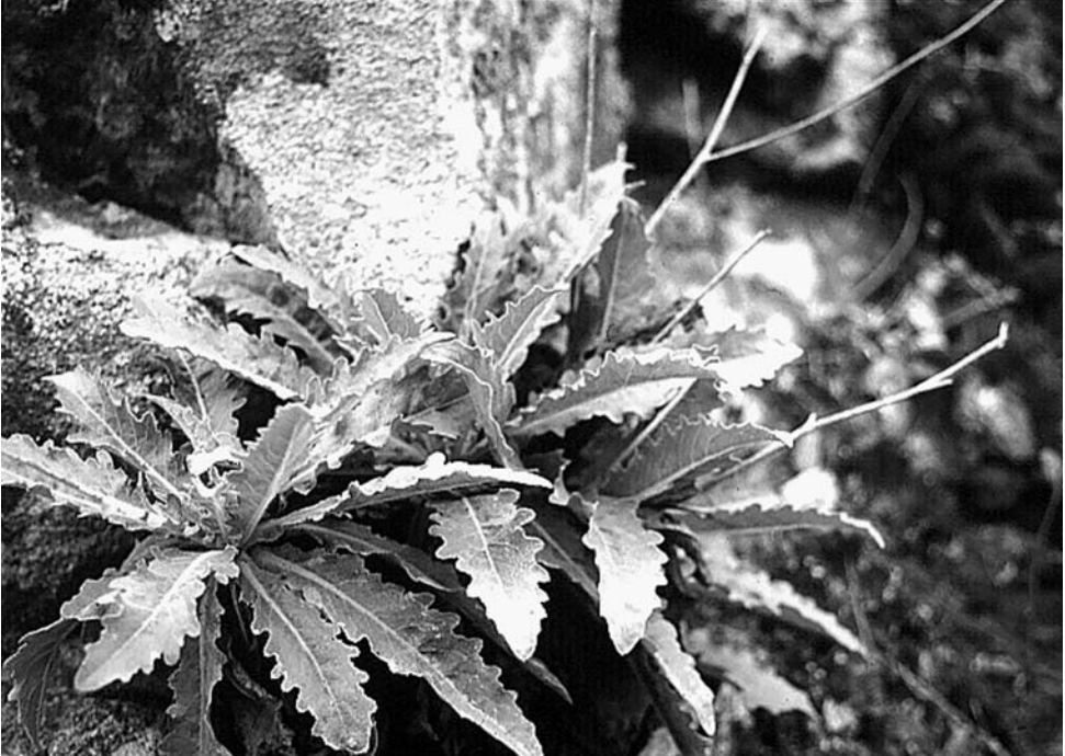
Fig.1. Tolpis farinulosa (Webb) J. A Schmidt – Santiago, Serra da Malagueta, 850 m, NNW slope.