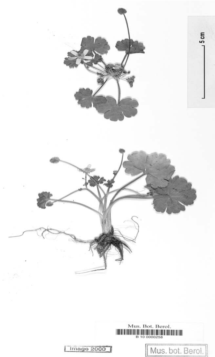
Fig. 2. Ranunculus veronicae – plants of the holotype sheet (Böhling 7066) at B.