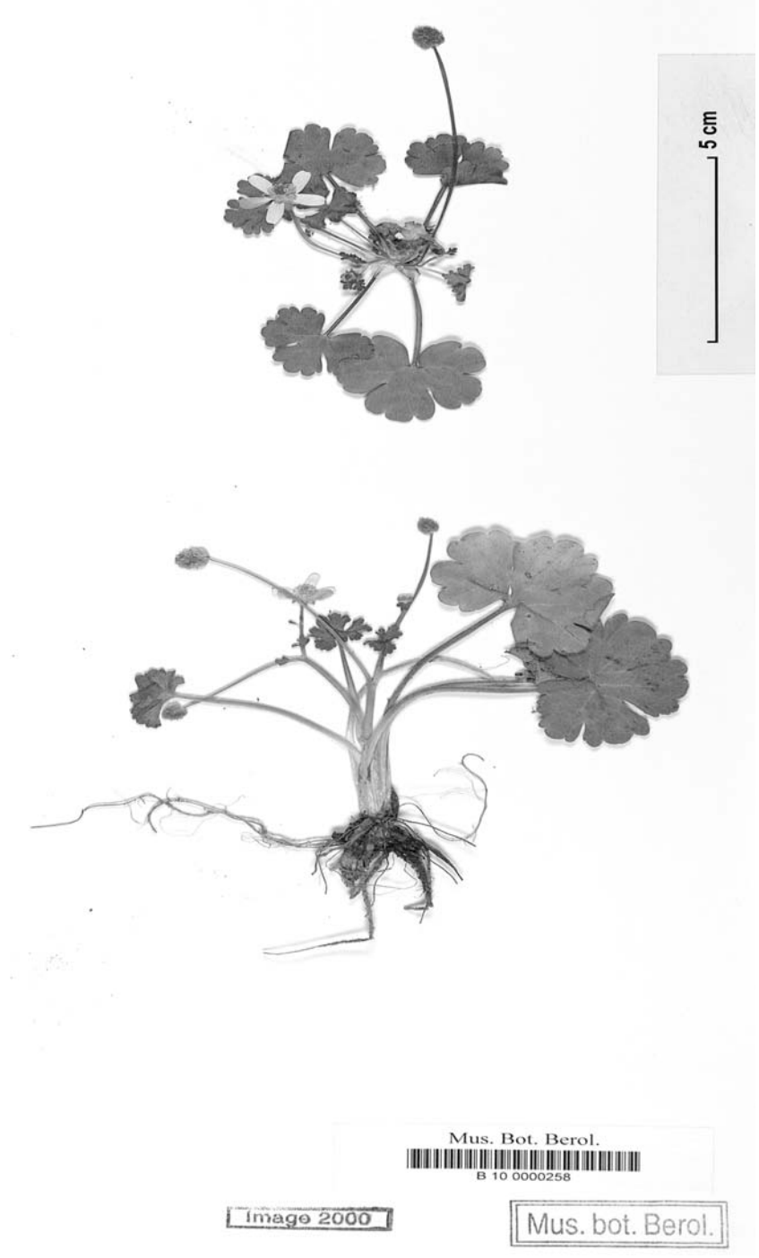
Fig. 2. Ranunculus veronicae – plants of the holotype sheet (Böhling 7066) at B.