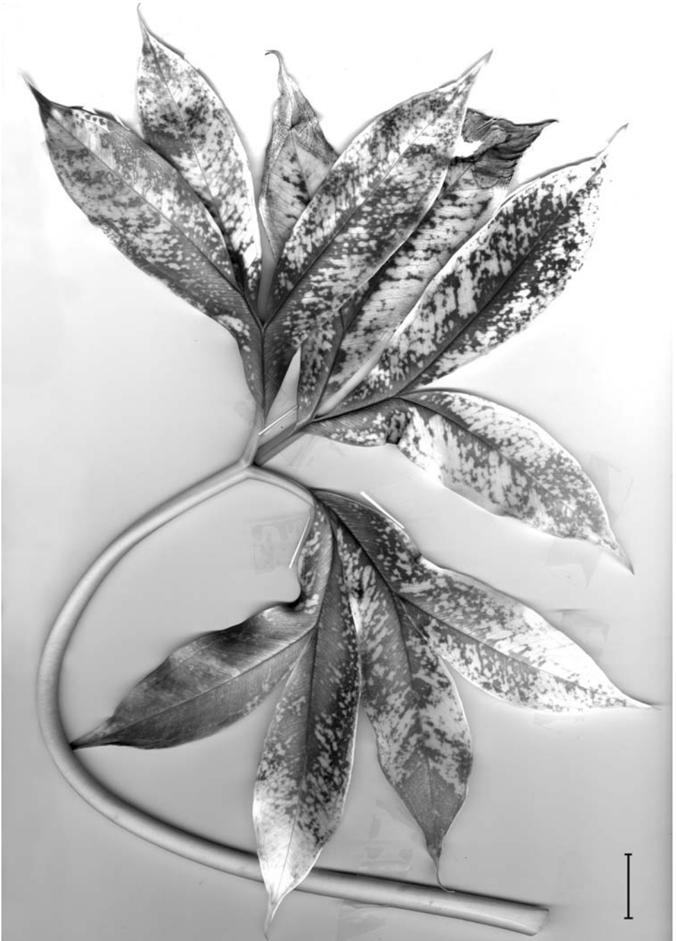
Fig. 2. Amorphophallus mangelsdorffii – Leaf from a cultivated plant originating from the locus typicus. – Scale bar = 2 cm; photograph by R. Mangelsdorff.