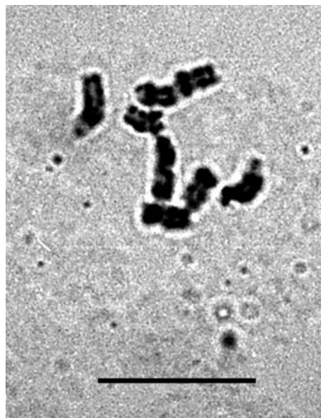
Fig. 4. Viola dirimliensis , metaphases of root-tip mitoses, 2n = 8 (from Eren & Şirin 473). – Scale bar = 10 \mu m.

G. Parolly, Ö. Eren, B. Nordt, E. von Raab-Straube & Th. Raus