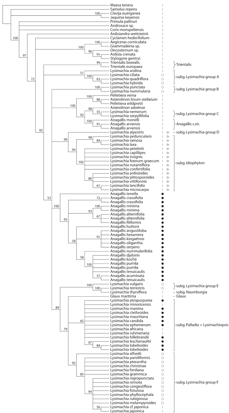
Fig. 1. Jackknife tree obtained from the Xac analysis of ndhF . Jackknife support values (> 50 %) are indicated above the nodes. ○ = Flowers with oil-producing tribores; ● = flowers with nectar-producing tribores.